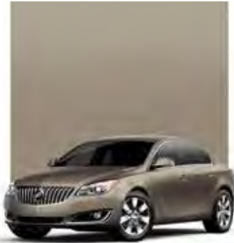
PEPPERDUST METALLIC 1,2,3