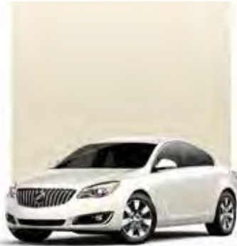
WHITE FROST TRICOAT 2,3