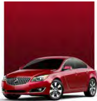
CRIMSON RED TINTCOAT 2,3