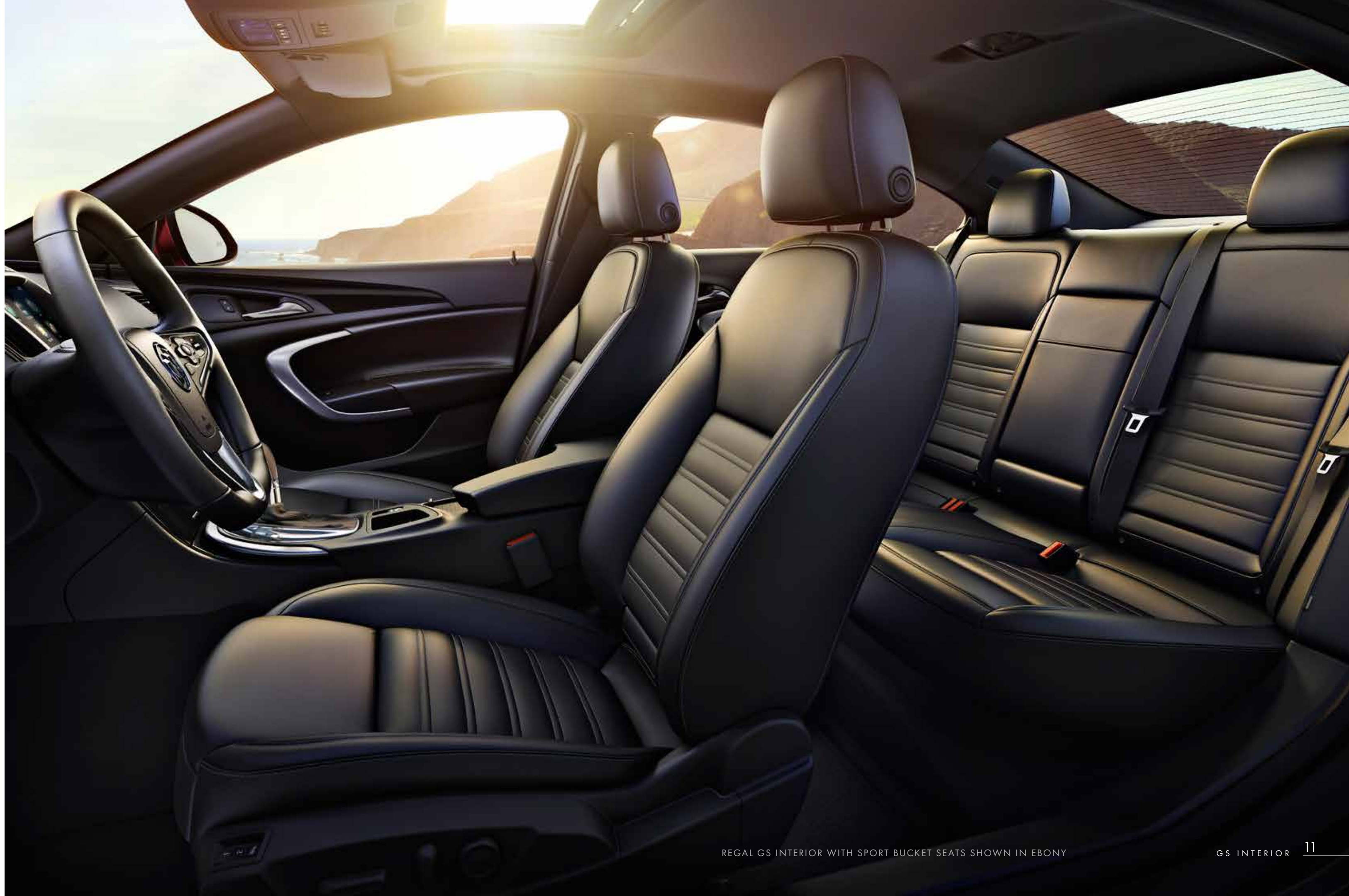
REGAL GS INTERIOR WITH SPORT BUCKET SEATS SHOWN IN EBONY