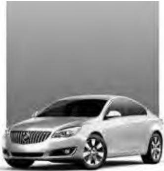
QUICKSILVER METALLIC 2