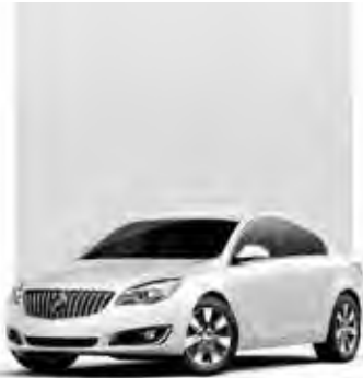
SUMMIT WHITE 1