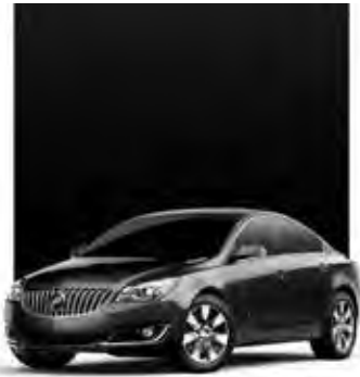
EBONY TWILIGHT METALLIC 2,3