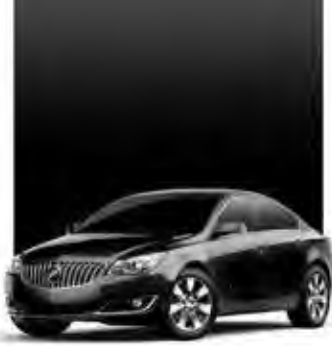
BLACK ONYX 1