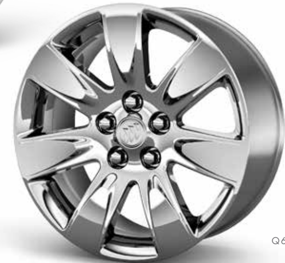
Q6Y 18" CHROMED ALLOY