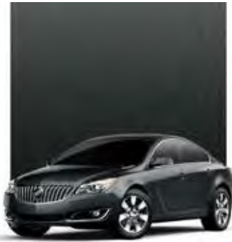
GRAPHITE GRAY METALLIC 2,3