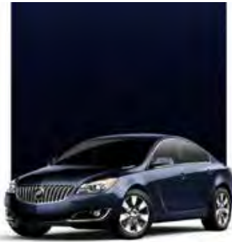
DARK SAPPHIRE BLUE METALLIC 1,2