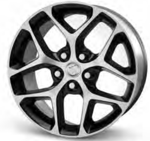
PTW 18" ALLOY WITH BLACK POCKETS (SPORT TOURING MODEL ONLY)