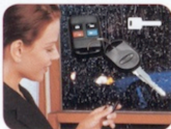
REMOTE START SYSTEMS