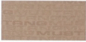
Medium Parchment Mustang Cloth Standard on V6