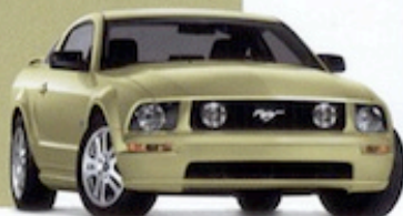
Legend Lime Metallic