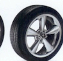
18" Polished-Aluminum Wheel with Tri-Bar Pony Center Cap Late availability on GT