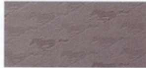
Light Graphite Galloping Horse Cloth Standard on GT