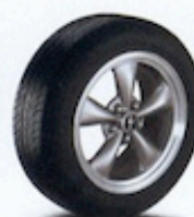
17" Painted-Aluminum Wheel with Tri-Bar Pony Center Cap Available with Pony Package