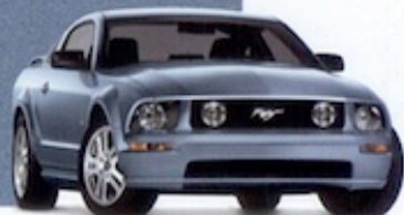
Windveil Blue Metallic