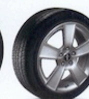
18" Premium Aluminum Wheel with Tri-Bar Pony Center Cap Available on GT