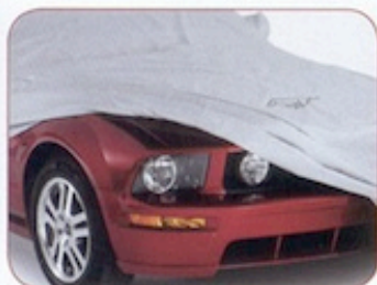
FULL VEHICLE COVER