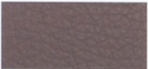
Light Graphite Leather Available on V6