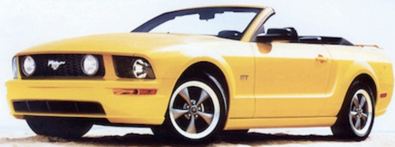
MUSTANG GT IN VISTA BLUE METALLIC WITH AVAILABLE EQUIPMENT AND MUSTANG GT CONVERTIBLE IN SCREAMING YELLOW