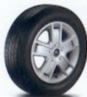
16" Steel Wheel with Wheel Cover Standard on V6 Standard