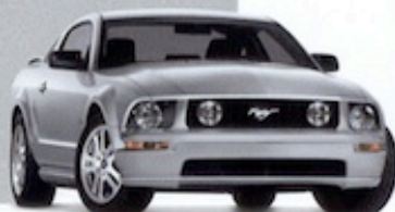
Satin Silver Metallic