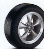
17" Painted-Aluminum Wheel Standard on GT