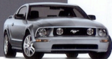
Tungsten Grey Metallic