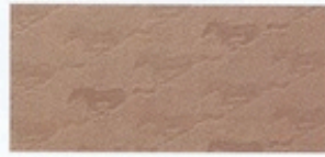
Medium Parchment Galloping Horse Cloth Standard on GT