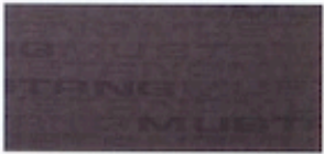
Dark Charcoal Mustang Cloth Standard on V6