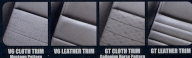
V6 CLOTH TRIM Mustang Pattern