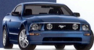
Vista Blue Metallic