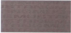
Light Graphite Mustang Cloth Standard on V6