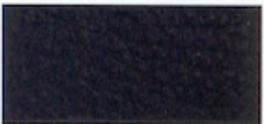
Dark Charcoal Leather Available on V6