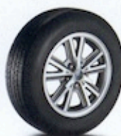
16" Bright Machined-Aluminum Wheel with Chrome Spinner Standard on V6 Premium; Available on V6 Deluxe