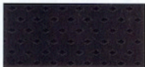
Dark Charcoal Leather Available on GT