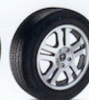
17" Bright Machined-Aluminum Wheel with Tri-Bar Pony Center Cap Available on GT