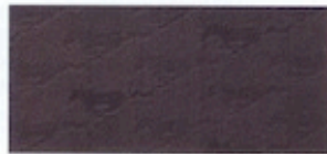
Dark Charcoal Galloping Horse Cloth Standard on GT