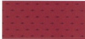
Red Leather Trim Available on V6 Deluxe and Premium and GT