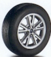
16" Bright Machined-Aluminum Wheel Standard on V6 Deluxe