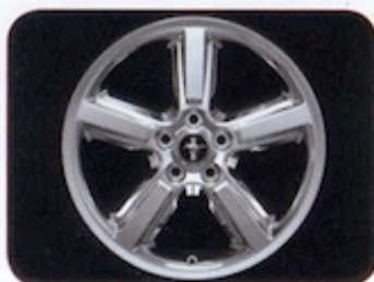
18" CUSTOM WHEELS