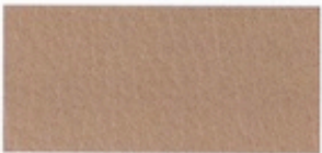
Medium Parchment Leather Available on V6