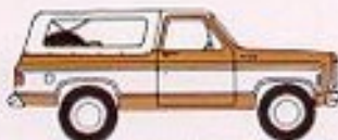
Special (ZY3) Two-Tone Paint with White Soft Top