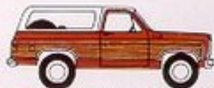
Available (YG2) Simulated Wood-Grain Trim with White Hardtop

PAINT OPTIONS offer a choice of 15 solid colors, eight of which are new for '80, and resulting available two-tone combinations. ZY3 Special Two-Tone Paint includes special side moldings. ZY5 Exterior Decor Package includes special