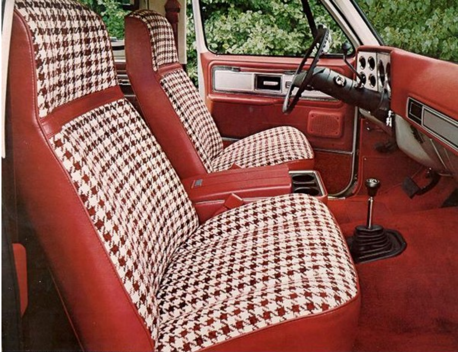
Sierra Classic interior with center console.

JIMMY FOR TOW OR SNOW . . . For year-around use of your Jimmy, ask your GMC dealer about available trailering equipment. He can also advise you about the power take off to operate snowplows and other specialized equipment.