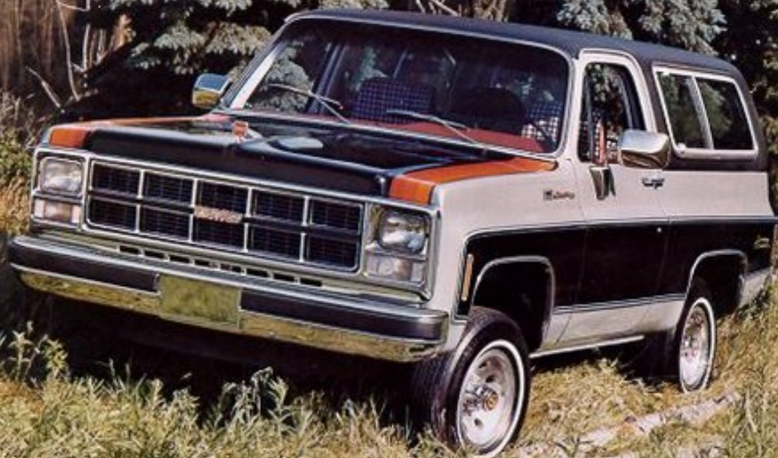
Shown with new V22 grille.