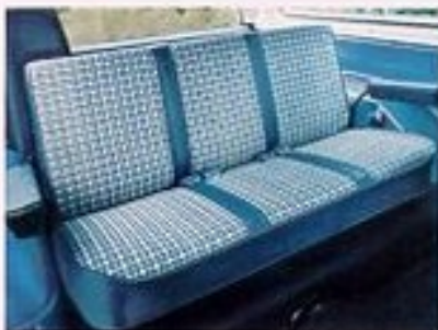
Available 3-passenger Sierra rear bench seat.

AVAILABLE REAR BENCH SEAT . . . provides seating for 3 passengers with impressive legroom in the floor area in front of the seat. Removable seat quickly folds up and out of the way for 89.6 cu. ft. of flat cargo area. Seat is trimmed to match front bucket seats. Rear compartment floor covering matches that of the front compartment.