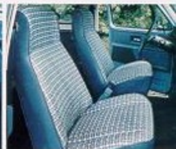
Sierra front seats.

AVAILABLE SIERRA CLASSIC INTERIOR Sierra Classic trim, now available for Jimmy, includes new custom cloth or Brahman-grain vinyl seat trim in Blue (vinyl only), Carmine, or Camel Tan; new visor mirror; new interior nameplates; trimmed cowl side panels; and new front door trim panels with assist straps and carpet trim. Two-tone interior is available with Blue, Carmine or Camel Tan in combination with Mystic custom vinyl (all colors) or custom cloth (Blue or Carmine only) seat trim, door trim panels and sunshades. Sierra Classic also includes custom steering wheel; Mystic headliner; color-keyed center console and carpeting. Bright-trim instrument cluster gages for speedometer, odometer, fuel, voltmeter, engine temperature and oil pressure include new international symbols and graphics to meet federal standards.