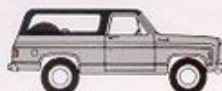
Solid Paint with Black Hardtop