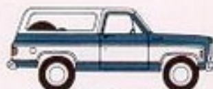
Exterior Decor Package (ZY5) with White Hardtop