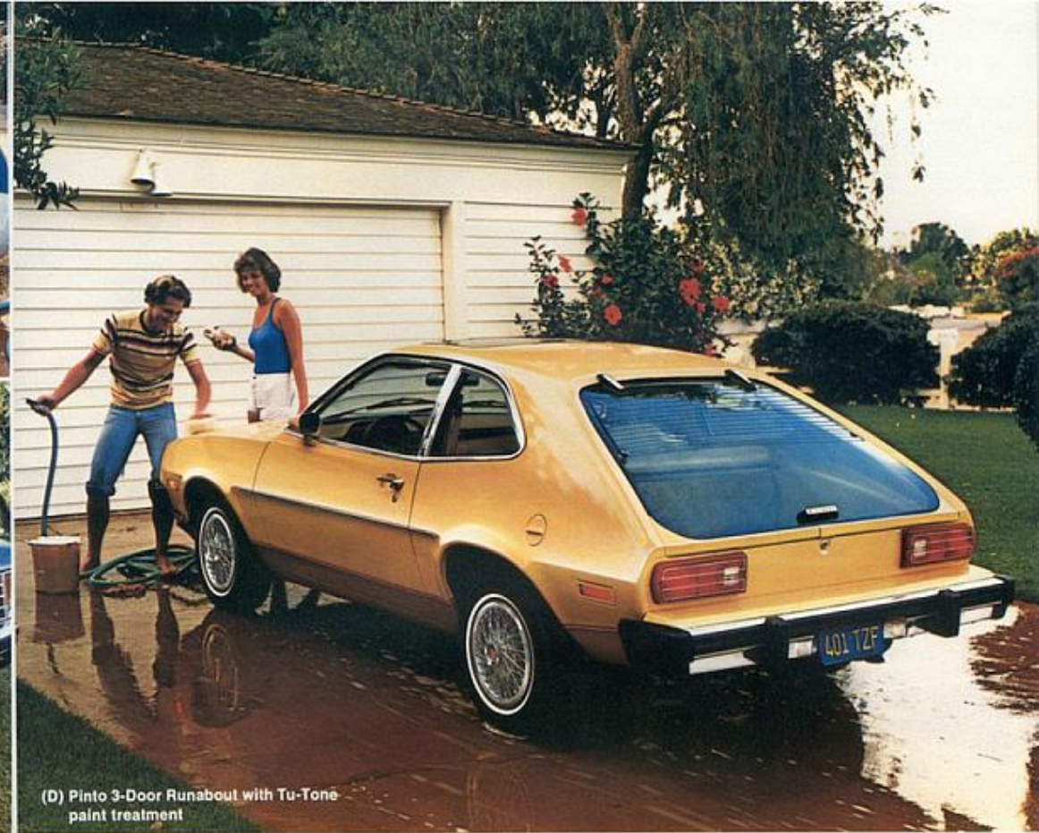
(D) Pinto 3-Door Runabout with Tu-Tone paint treatment