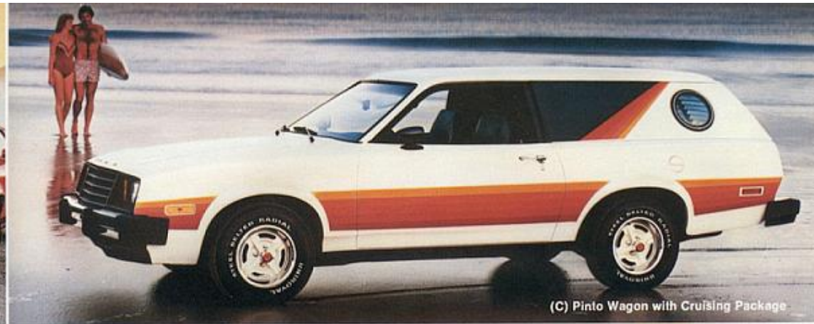
(C) Pinto Wagon with Cruising Package