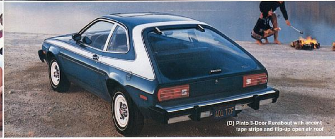
(D) Pinto 3-Door Runabout with accent tape stripe and flip-up open air roof