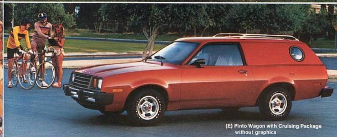
(E) Pinto Wagon with Cruising Package without graphics

(C) Loads of space. Pinto Wagons really haul. They have over five feet of flat floorspace, with the rear seat down, to accommodate many of the things you wish to carry.