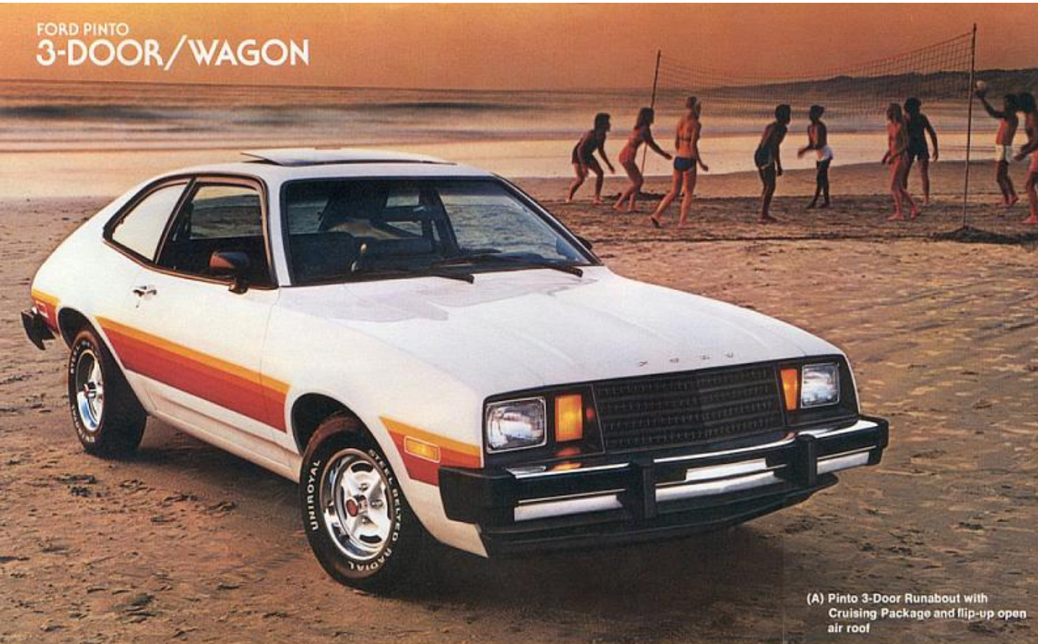
(A) Pinto 3-Door Runabout with Cruising Package and flip-up open air roof