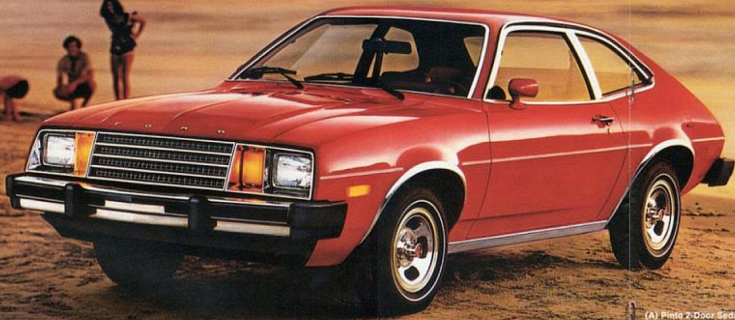
(A) Pinto 2-Door Sedan with Exterior Decor Group