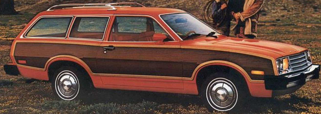
(A) Pinto Squire Wagon