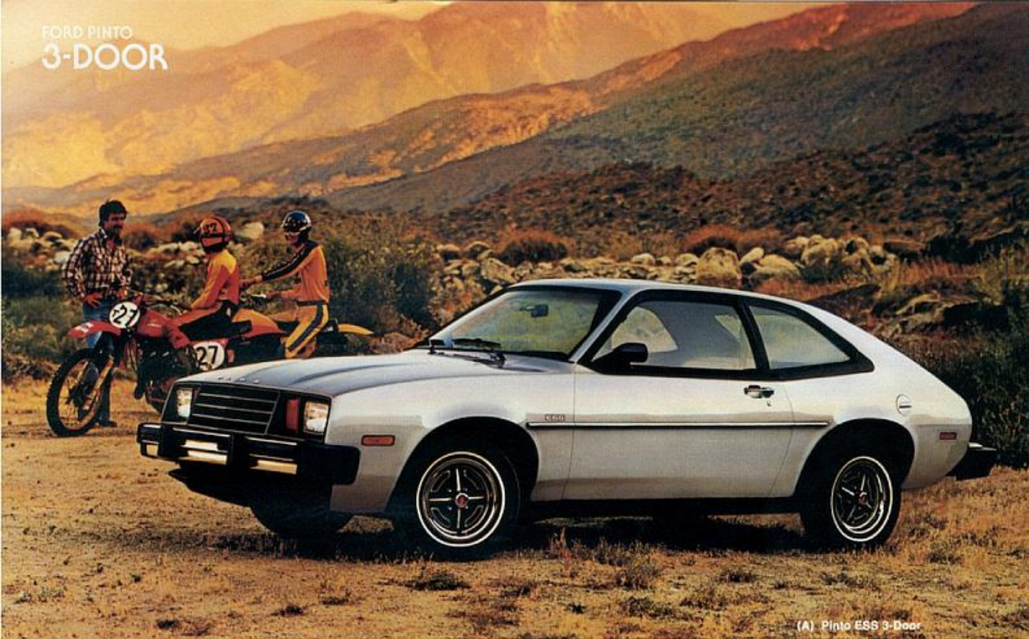
(A) Pinto ESS 3-Door