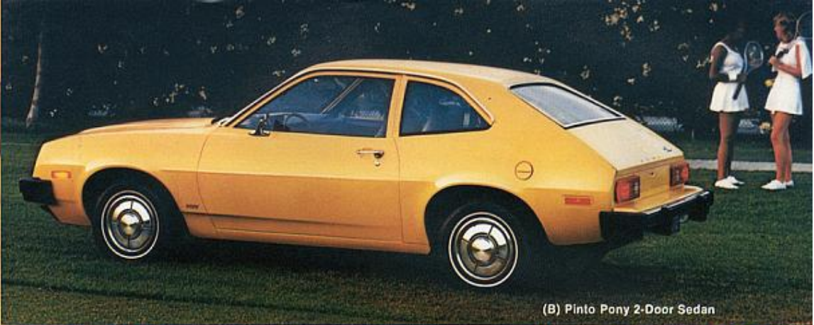
(B) Pinto Pony 2-Door Sedan

The second was a Truck Passing Test. Each car accelerated starting at 20 mph as it passed a truck and returned to its original traffic lane. Pinto won once again. The '79 Pinto, with a more stylish new look and the makings of a winner, invites the competition to a rematch at Indy. Show you've got the makings of a winner