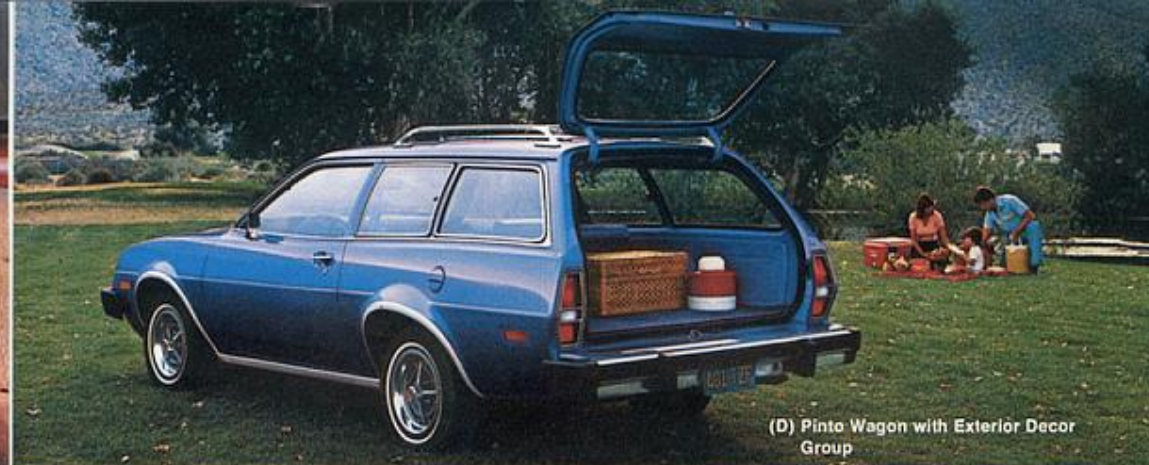
(D) Pinto Wagon with Exterior Decor Group