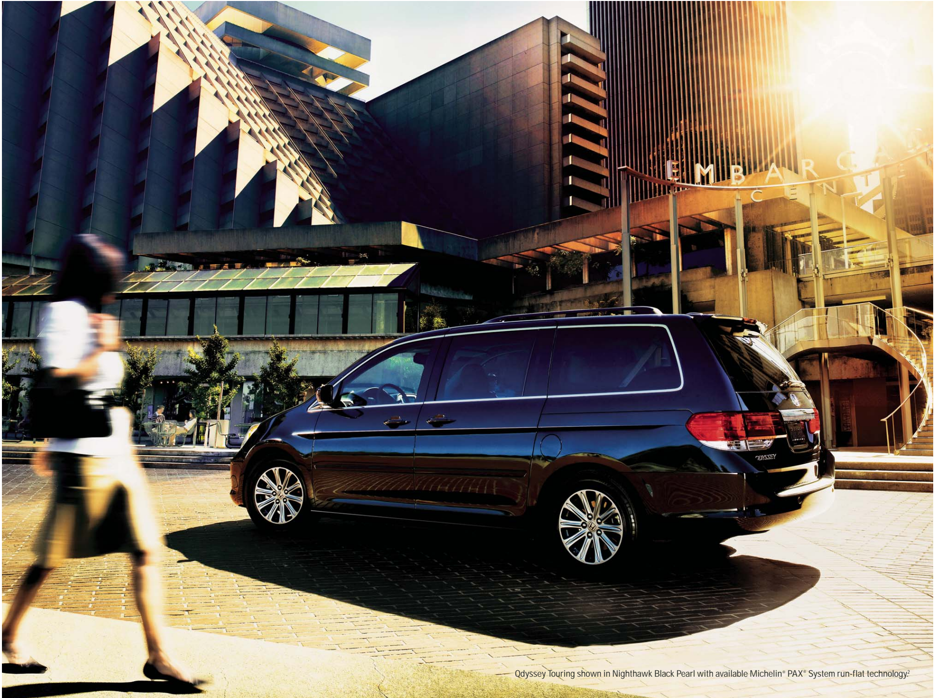
Odyssey Touring shown in Nighthawk Black Pearl with available Michelin® PAX® System run-flat technology 2