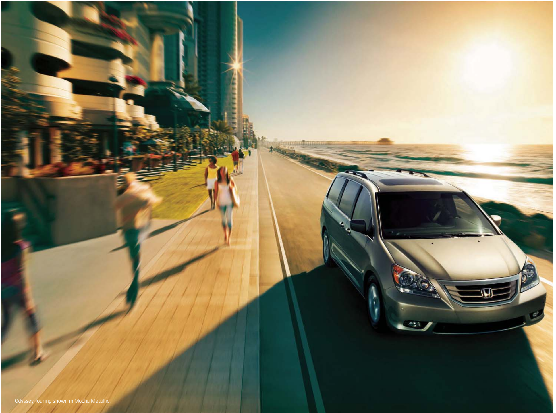
Odyssey Touring shown in Mocha Metallic.