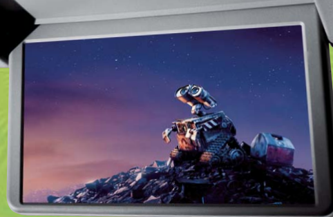
Wall-E Coming to DVD November 18.

With so many entertainment options, moments of peace, love and harmony are a whole lot easier to achieve.