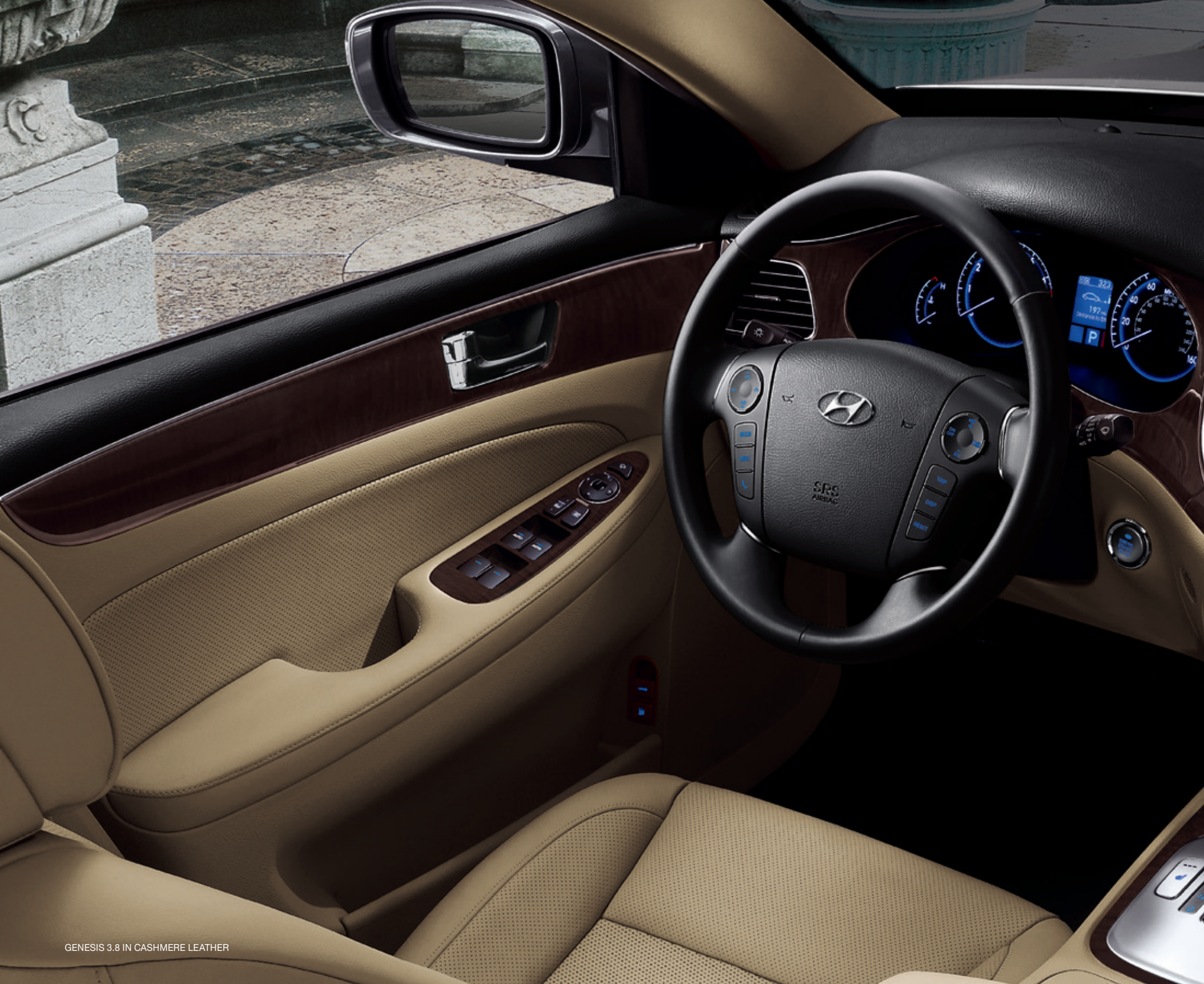
GENESIS 3.8 IN CASHMERE LEATHER