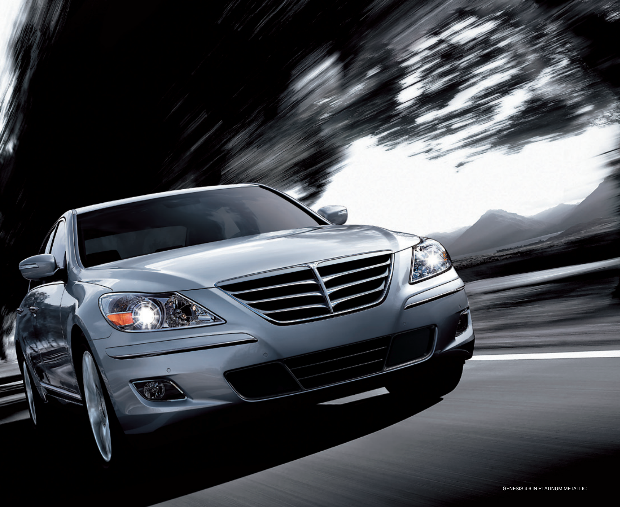
GENESIS 4.6 IN PLATINUM METALLIC