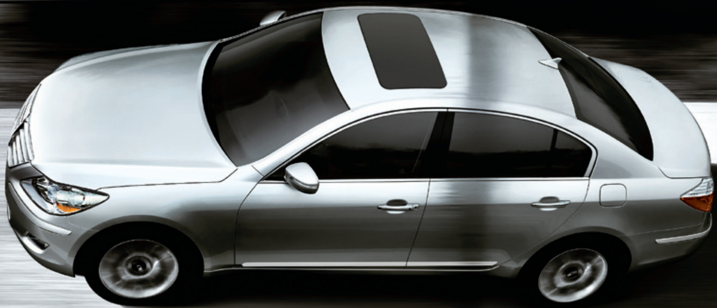
GENESIS 4.6 IN PLATINUM METALLIC