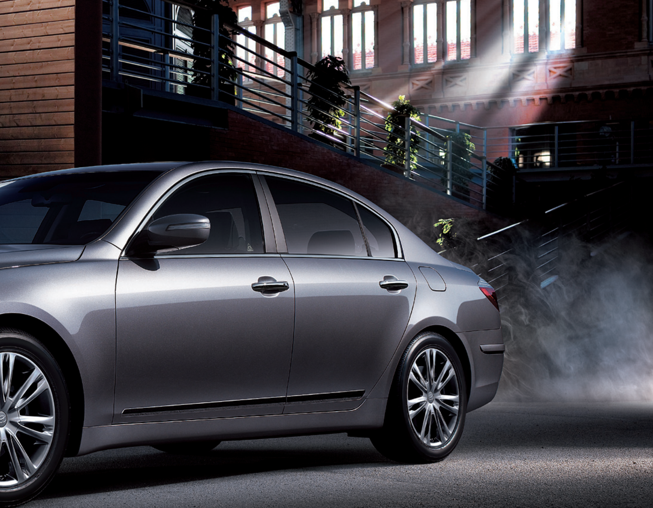
GENESIS 3.8 IN TITANIUM GRAY METALLIC