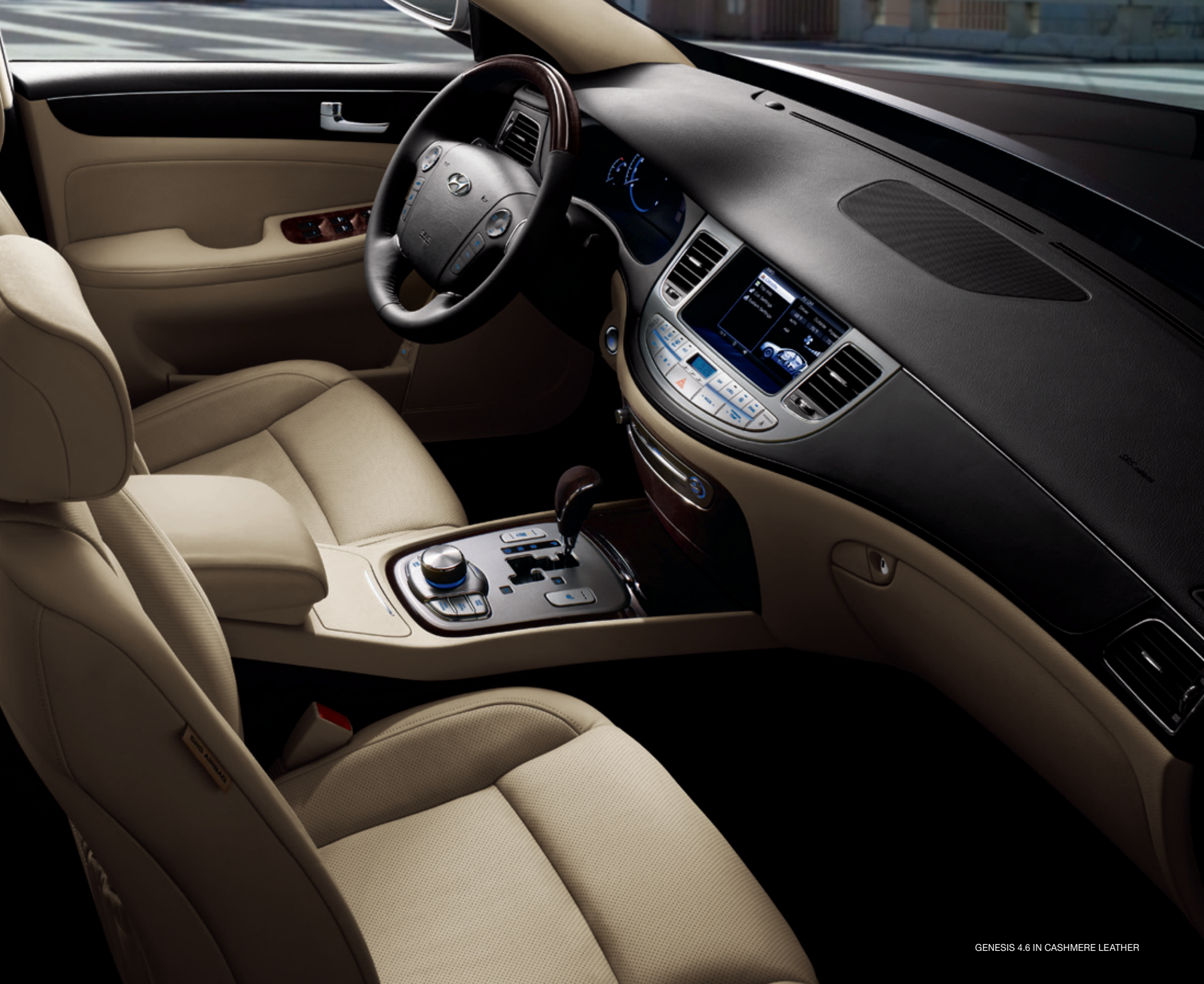
GENESIS 4.6 IN CASHMERE LEATHER