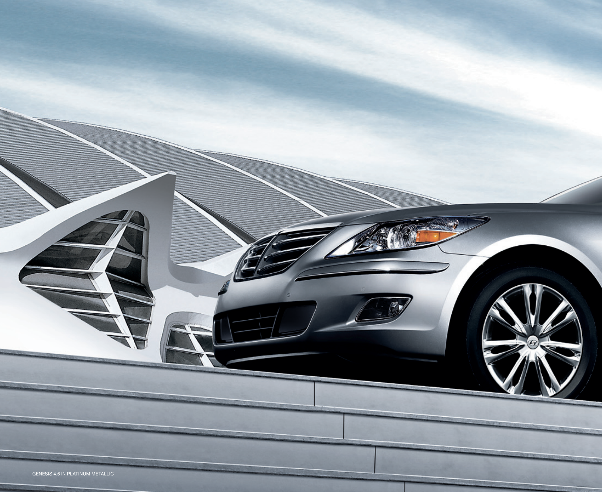
GENESIS 4.6 IN PLATINUM METALLIC