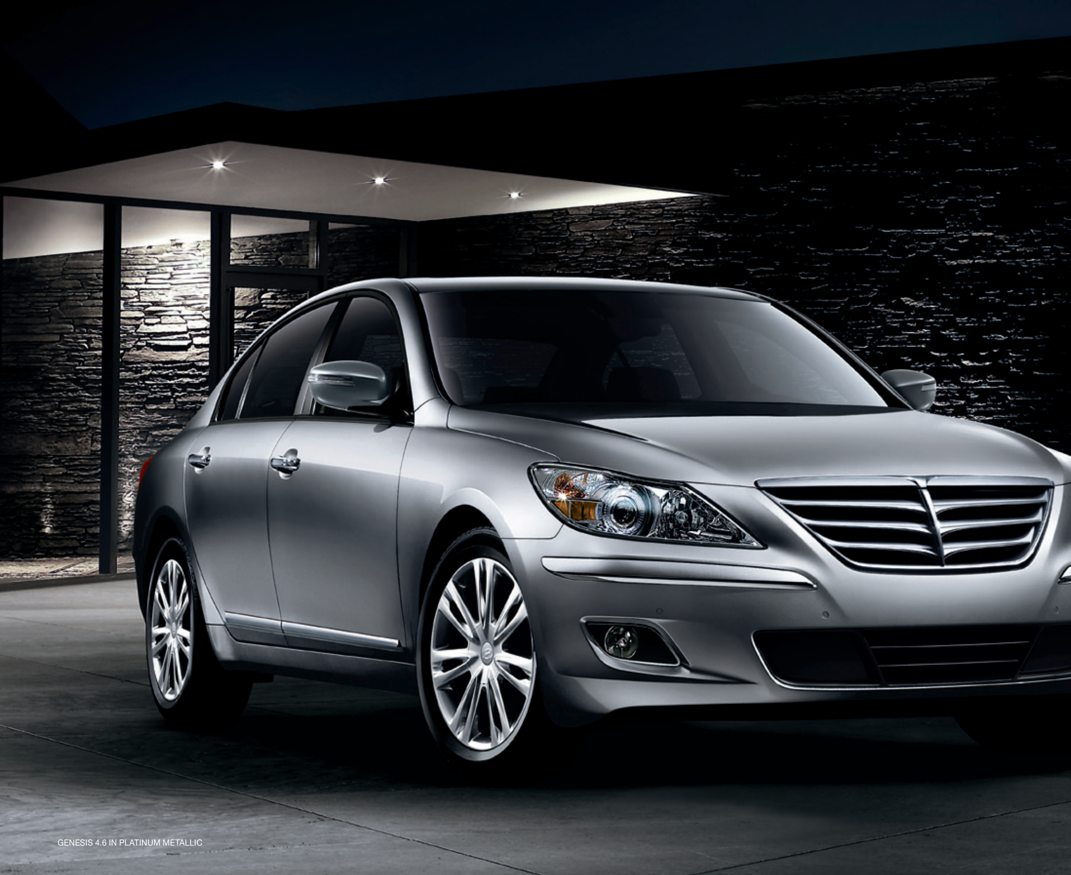
GENESIS 4.6 IN PLATINUM METALLIC