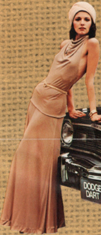
Dart Special Edition 4-door sedan

Now Dodge brings you Dart with a whole new dimension of luxurious comfort and style. Consider these standard features: Parchment crushed velour and vinyl interior and parchment (or black) vinyl roof. Automatic transmission. Power steering. AM radio. Plush cut-pile carpeting. Color-keyed wheel covers and whitewall tires. Extra insulation. Carpeted trunk. And bright exterior trim. Dart Special Edition sets high standards of luxury and value.