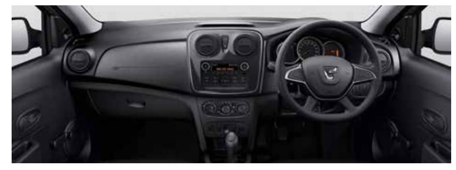
Black 'Cerite' cloth upholstery