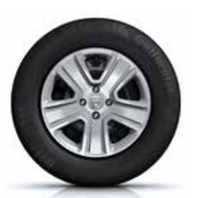
15" Lassen steel wheels