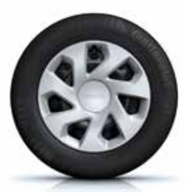
15" Tarkine steel wheels