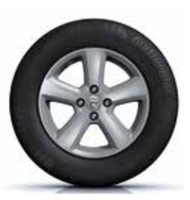
15" Sagano alloy wheels