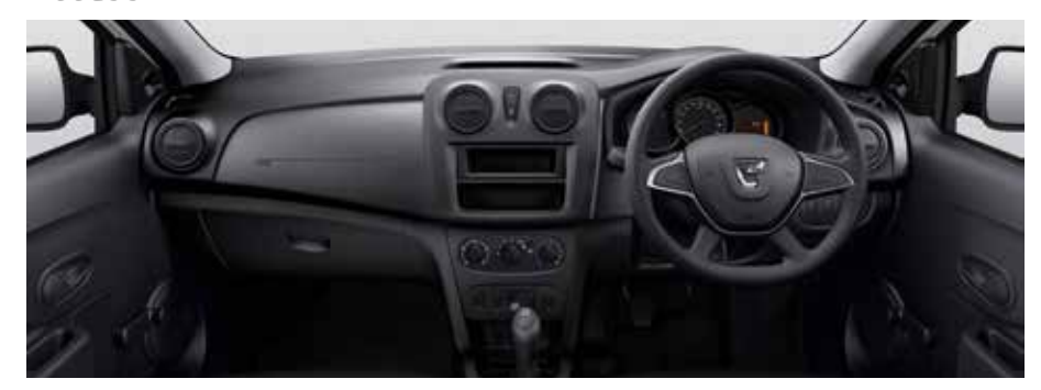
Black 'Cerite' cloth upholstery