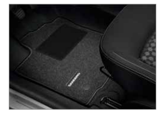
Monitor Mats (Standard)