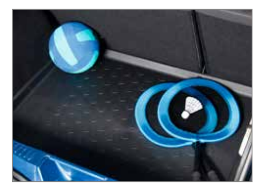
Standard boot liner