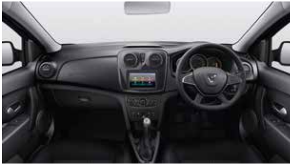
Dark Carbon 'Indite' cloth upholstery with optional armrest