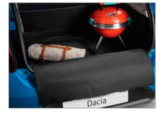
All-in-one boot liner