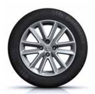
16" Taiga alloy wheels