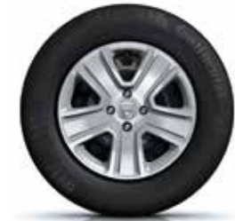
15" Lassen steel wheels