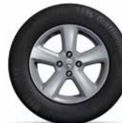
15" Sagano alloy wheels