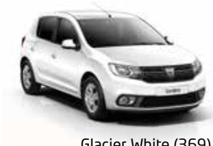
Glacier White (369)