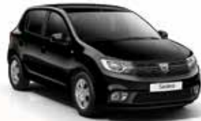
Pearl Black (676)