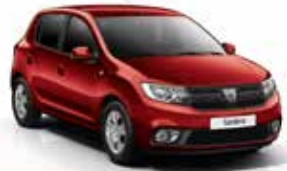
Cinder Red (B76)