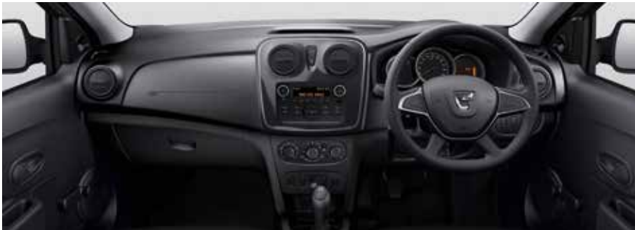
Black 'Cerite' cloth upholstery