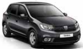
Slate Grey (KNA)