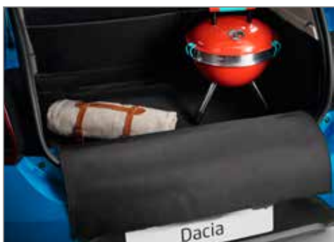
All-in-one boot liner