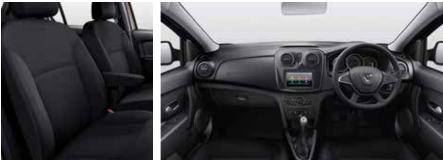
Dark Carbon 'Indite' cloth upholstery with optional armrest