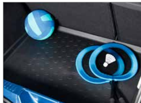
Standard boot liner