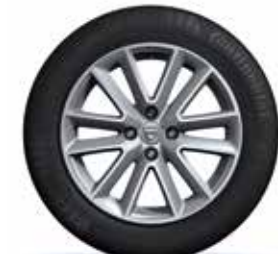
16" Taiga alloy wheels