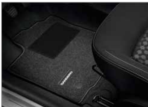
Monitor Mats (Standard)