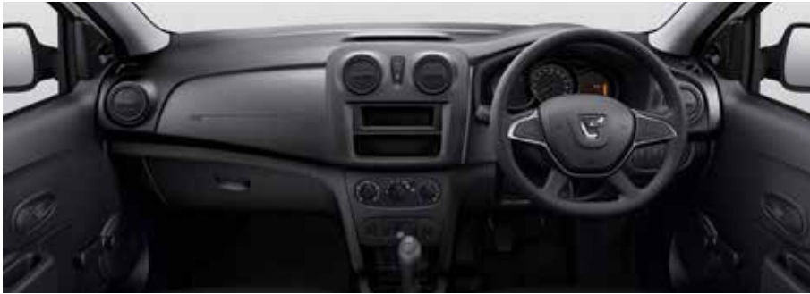
Black 'Cerite' cloth upholstery