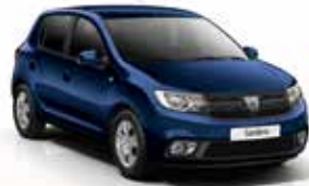
Cosmos Blue (RPR)