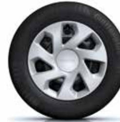
15" Tarkine steel wheels