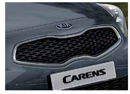
Tiger nose chrome front grille surround ('2' upwards) – which boasts a high gloss black mesh