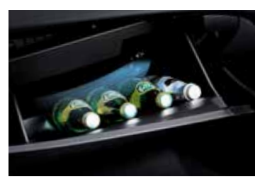
Cooled glove box - The 8-litre glove box Centre console storage - two drinks can Storable luggage area load cover has a cooling function, handy for chilling drinks or storing perishable items on longer journeys.