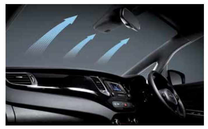
Auto de-fogging system (special edition 'SR7' upwards) – A sensor automatically initiates a de-fogging process when condensation is detected on the windows to ensure optimal visibility and to prevent humidity from building up on the windows.

The useful conversation mirror ('1', special edition 'SR7', '2' and '3' grades) is cleverly hidden in the front overhead console space. When pressed the mirror flips down and provides a rear cabin view so the driver is able to safely observe passengers in the rear seats, especially useful when travelling with children on board.