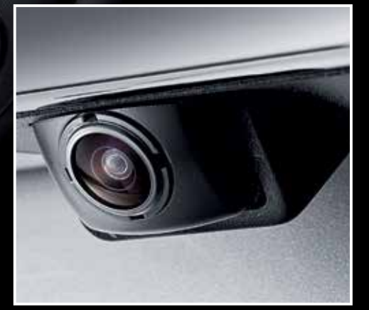
Reversing camera integrated into the centre fascia screen ('3' and '4' grades only) – The popular reversing camera feature is combined with reversing sensors which help minimise the collision risks involved when parking or manoeuvring. The rear camera view shows superimposed parking guidelines to assist the driver in easier, more effective parking. Reversing sensors are a standard feature on the special edition 'SR7' models upwards.