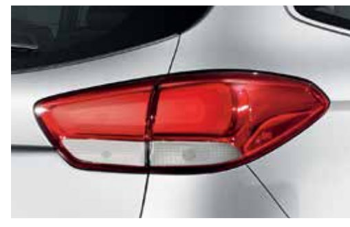
Sculpted rear lights – The rear lights wrap around the boot and side panels for visual impact.