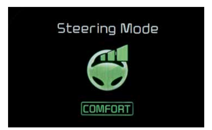
Flex Steer – This innovative feature allows you to choose between three modes of steering – simply select 'comfort' to make light work of city driving, 'normal' for regular driving or 'sport' mode for even more responsive steering, ideal for motorway driving or on narrow country lanes.