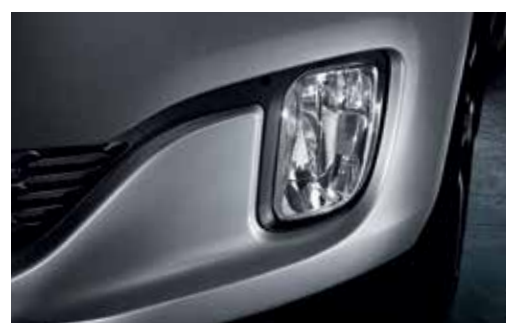
Front fog lights (special edition 'SR7' models upwards) – integrated into the front bumper, the fog lights combine safety considerations with aesthetic appeal.