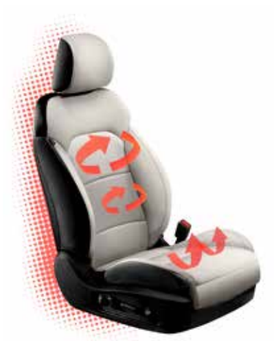
Heated front seats ('3' and '4') – create the perfect driving comfort whatever the weather.