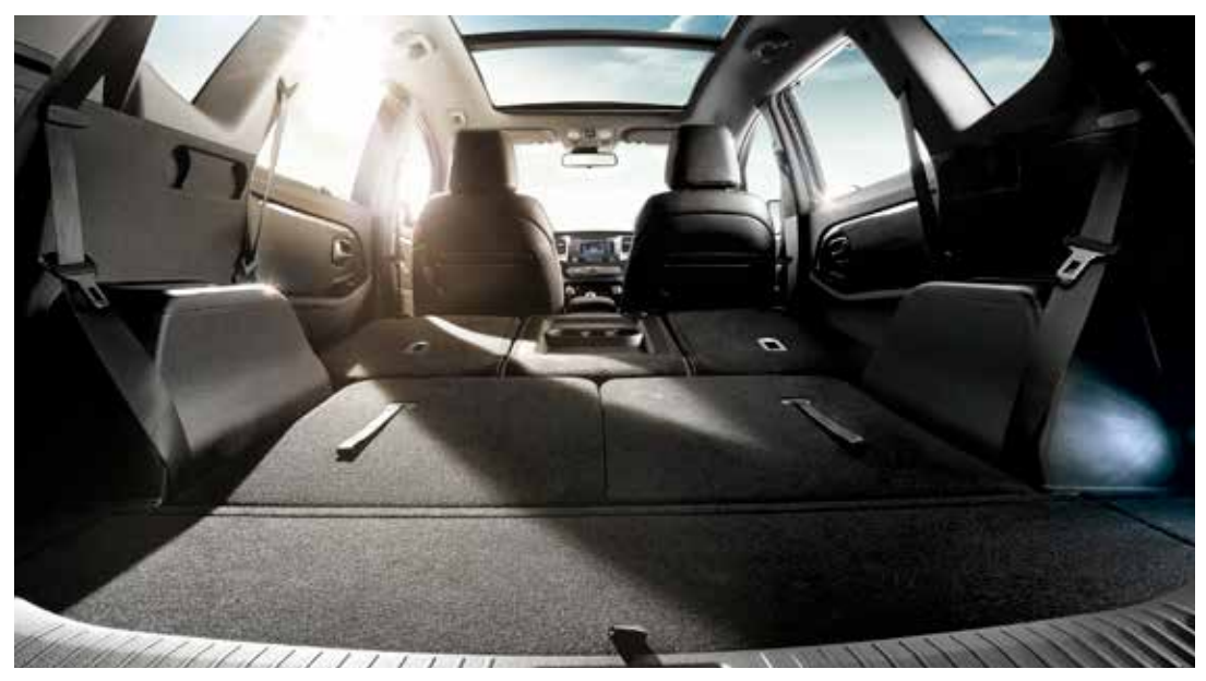
Spacious cargo room - the outer second row seats feature a walk-in device to ensure easy access to the third row seats. The luggage capacity (when the second and third row seats are folded) is up to 1,650 litres.

The luggage area boasts convenient net hooks and there are numerous storage areas for bottles or loose items in the front and rear door pockets. Even the third row seats feature convenient cupholders and the '2' upwards also comes with a luggage net which keeps items from moving around whilst travelling. The detachable LED torchlight ('2' upwards) can be mounted into the luggage side wall socket to recharge and acts as the luggage light too.