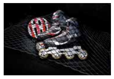
Luggage net ('2' upwards) - A handy luggage net can be fastened using convenient hooks to prevent items from rolling around.