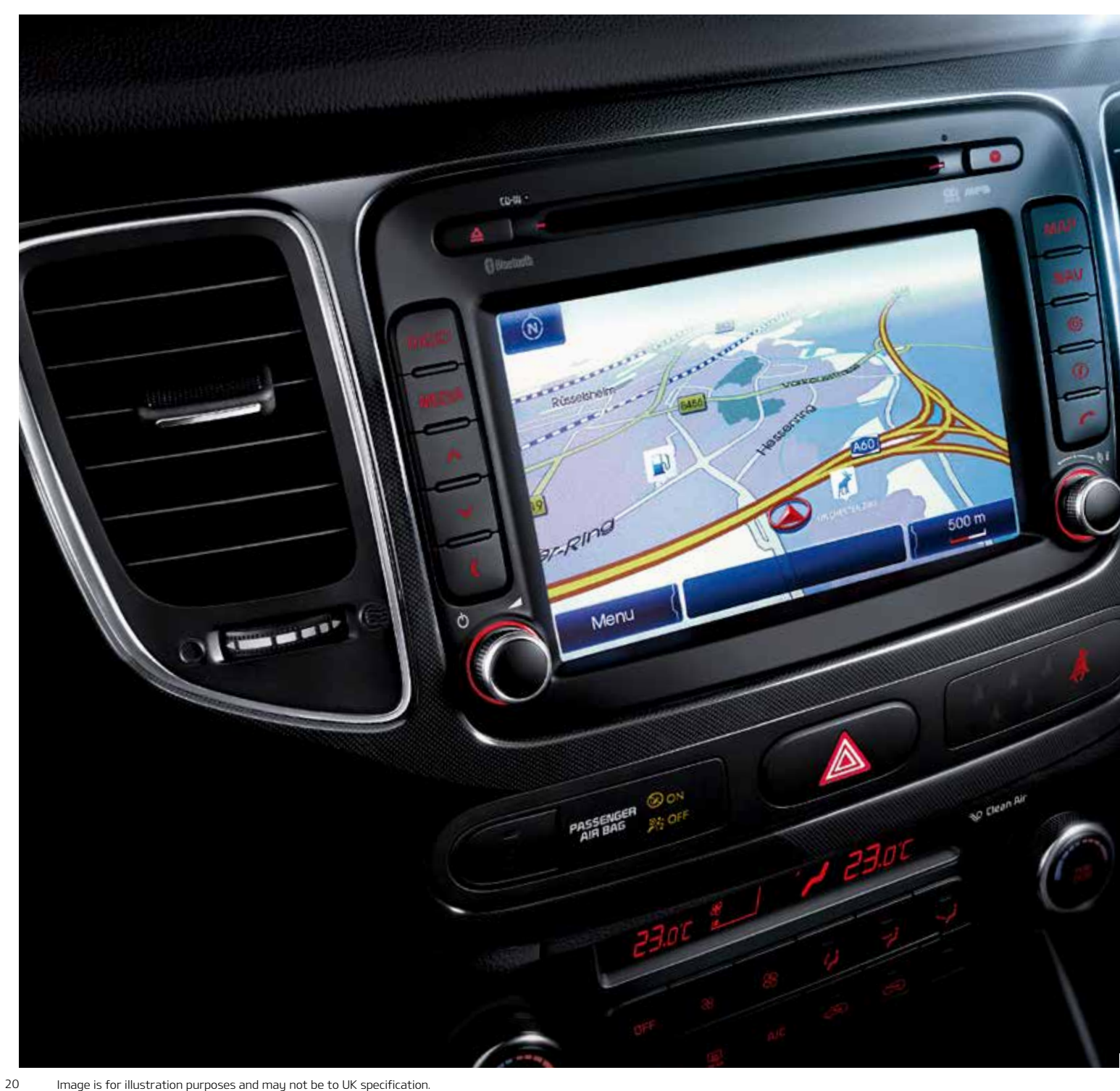
Image is for illustration purposes and may not be to UK specification. Feature shown is amongst the standard specification on the range-topping Carens '3' and '4'.