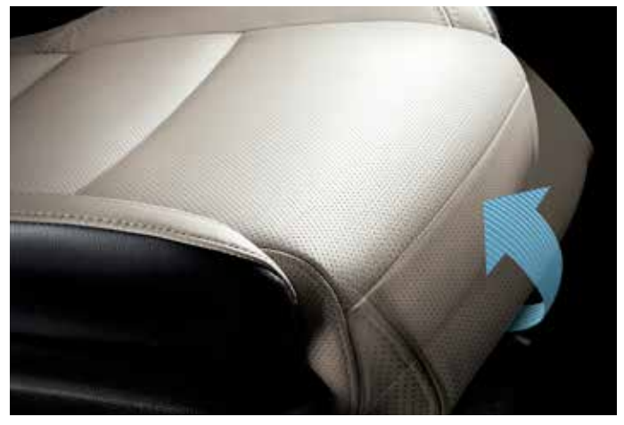
Electric seat cushion extension ('3' and '4') – Designed with long-legged drivers in mind, the seat cushion can be extended for optimal driving comfort.