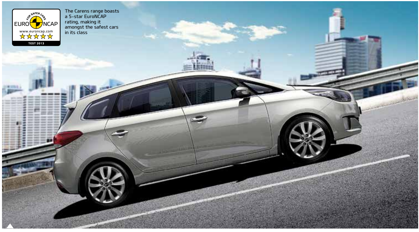
HAC (Hill-start Assist Control) - By maintaining brakeforce until you accelerate, HAC prevents the vehicle from rolling backwards when starting on a steep hill.