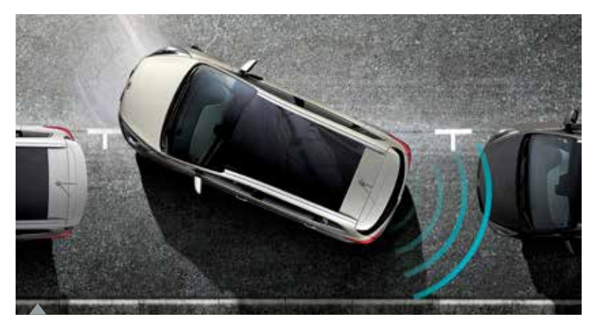
The Carens can even help you park your vehicle easily and conveniently with the Parallel Park Assist System (PPAS) ('4' grades) – This clever system searches for a parallel parking space via 10 sensors (6 at the front and 4 at the rear) and once found, calculates the optimum route to park the vehicle into the space. The steering wheel is operated automatically, therefore all the driver needs to do is select the appropriate gear displayed on the LCD display and control the accelerator and brake.

A 7" touchscreen satellite navigation system with European mapping is standard on the '3' and '4' grades. Integrated into the centre fascia the system has full UK postcode recognition and includes other useful features such as a Traffic Management Channel and Points of Interest.