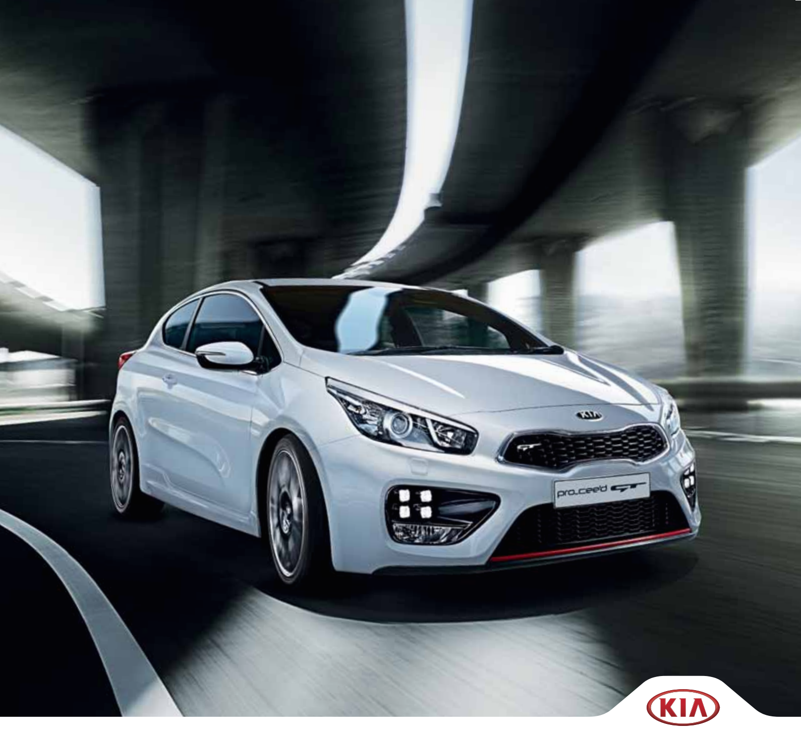
The Power to Surprise