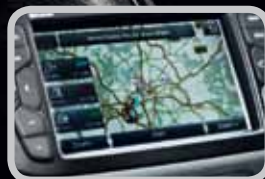
7" Touchscreen Satellite Navigation ('SE' and 'GT Tech')