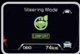
Flex Steer ('S' and 'SE')