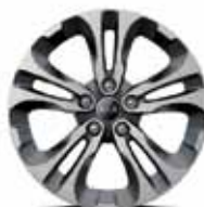
17-inch 5x2 spoke alloy wheels

'SE' 1.6 GDi 133bhp 6-speed manual ISG (137 g/km)