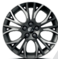
18-inch alloy wheels with graphite finish

'GT Tech' 1.6 T-GDi 201bhp 6-speed manual (171 g/km)