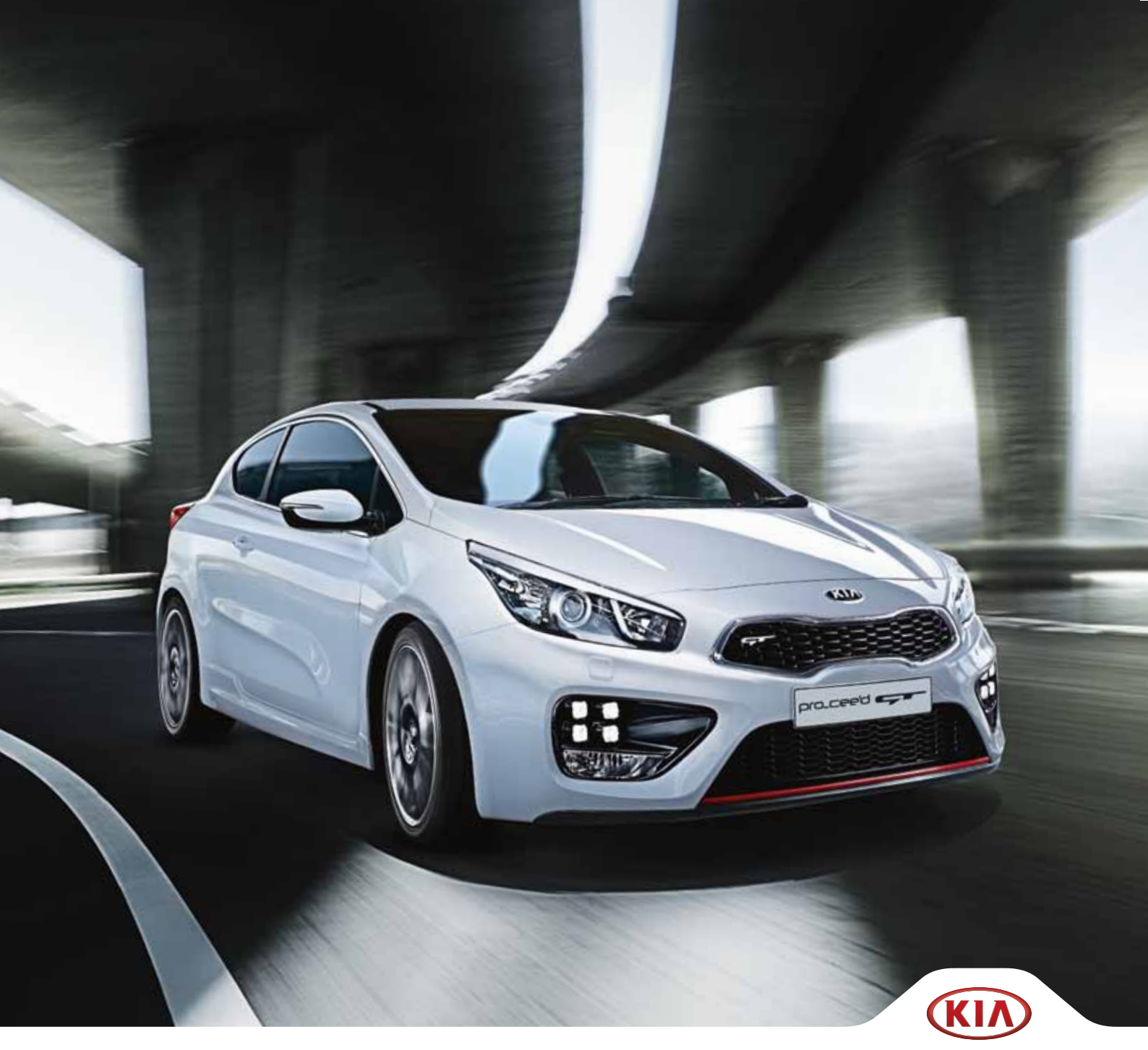
The Power to Surprise