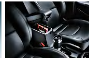
COVERED CONSOLE Dual cup holders and a storage bin with an available sliding armrest* let you keep personal items close at hand.