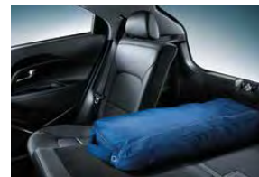
60/40 SPLIT-FOLDING SEATS Split-folding rear seats give you the flexibility to conveniently carry passengers or cargo. 1