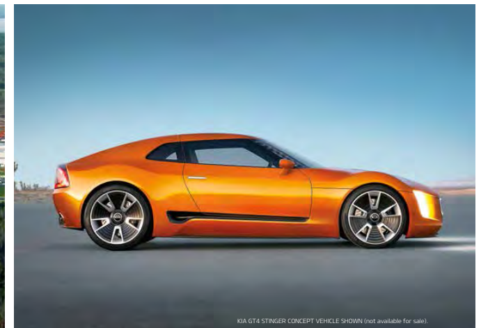
KIA GT4 STINGER CONCEPT VEHICLE SHOWN (not available for sale).

Kia vehicles have captured worldwide attention for their interior and exterior styling, which represents the collaborative work of designers who have created a look that makes every Kia recognizable at first sight. Today, the lineup consists of vehicles that fill owners, as well as Kia's designers, with pride.