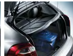
CONCEALED STORAGE 1 The cargo cover allows you to store your valuable items out of sight.