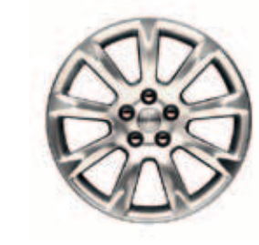
D - 19" 9-spoke machined aluminum, painted