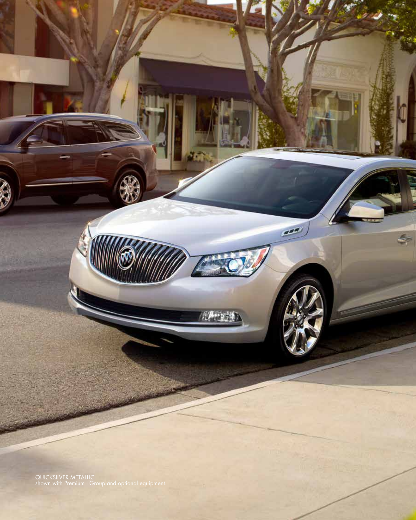
QUICKSILVER METALLIC shown with Premium I Group and optional equipment.