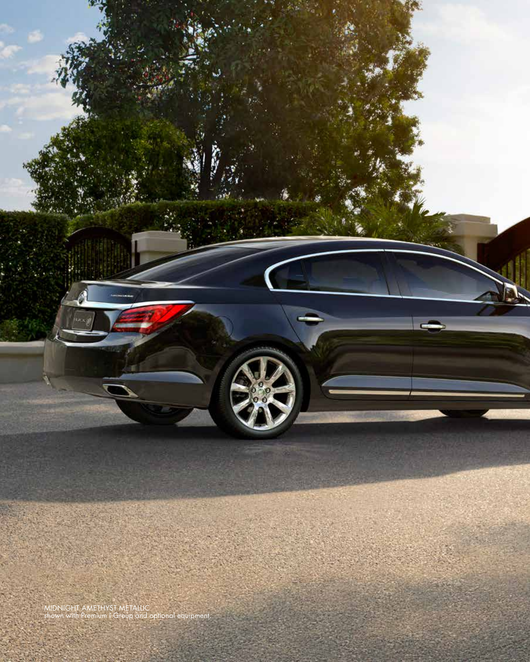
MIDNIGHT AMETHYST METALLIC shown with Premium I Group and optional equipment.