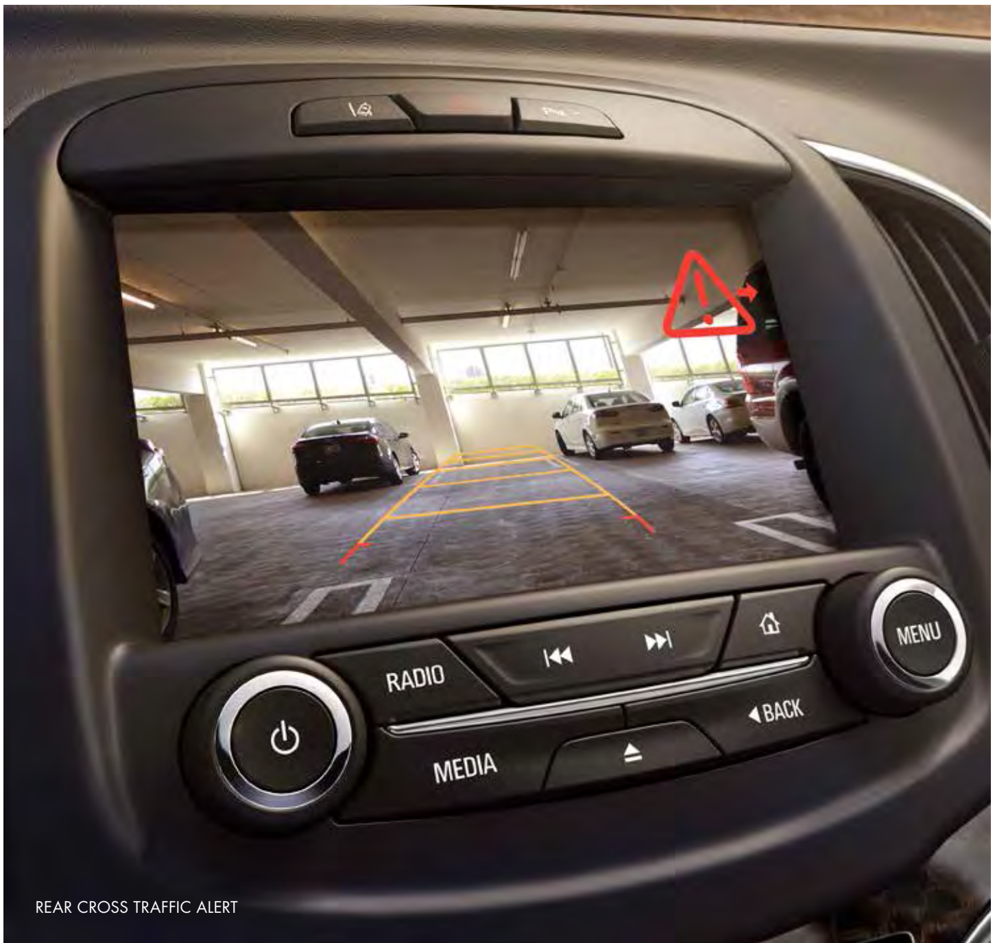
REAR CROSS TRAFFIC ALERT