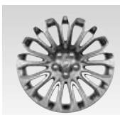
Q7N 20" MACHINE-FACED SILVER PAINTED ALLOY