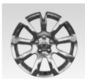
REK 19" CHROME ALLOY