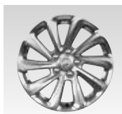
REP 18" STERLING SILVER PAINTED ALLOY