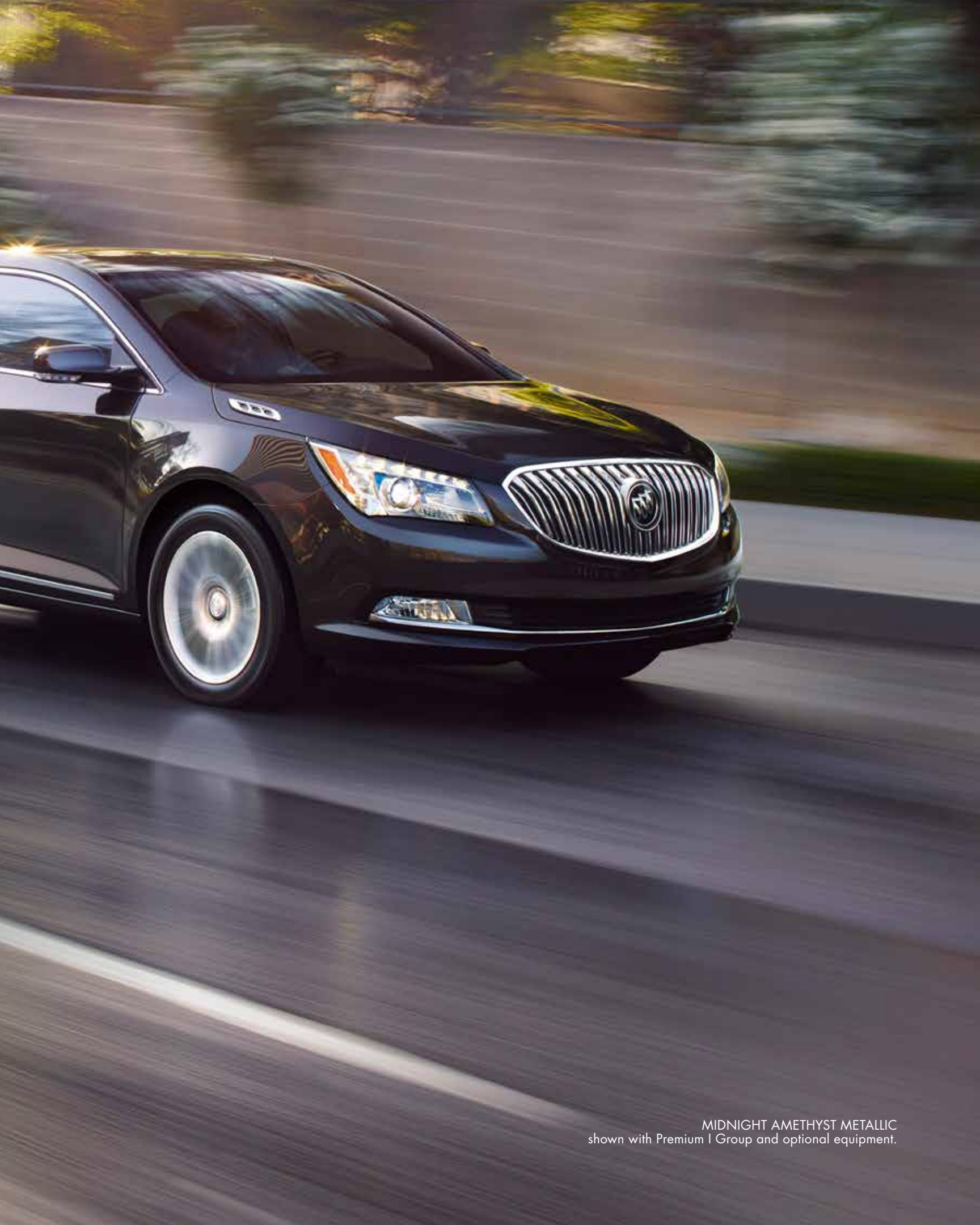
MIDNIGHT AMETHYST METALLIC shown with Premium I Group and optional equipment.