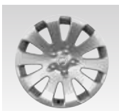
REJ 19" SILVER PAINTED ALLOY