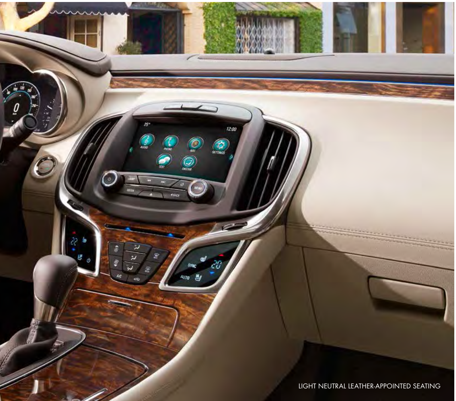
LIGHT NEUTRAL LEATHER-APPOINTED SEATING

Settle into the available premium leather-appointed seating. Ice-blue ambient lighting and the soft-touch instrument panel surround you to make your ride more comfortable and enjoyable. Directly in front of the driver, there's a 203 mm (8") diagonal Driver Information and Cluster Display that can be configured with the information you use most often. Atop the centre console is a 203 mm (8") diagonal colour touch-screen that makes it easy to use the latest generation of IntelliLink, 1 Buick's acclaimed infotainment system. Below the centre screen, the dual-zone climate controls and available heated and ventilated front seats can be easily controlled by using intuitive capacitive touch controls, meaning fewer buttons and putting every control just where you need it. Your passengers' comfort isn't left to chance, either. In fact, our engineers designed first-class rear seating in this luxury sedan to have more rear leg room than even the Lexus ES 350, Acura TL and Infiniti Q70 sedans. 2