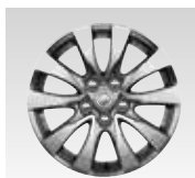
RDL 17" MACHINE-FACED SILVER PAINTED ALLOY