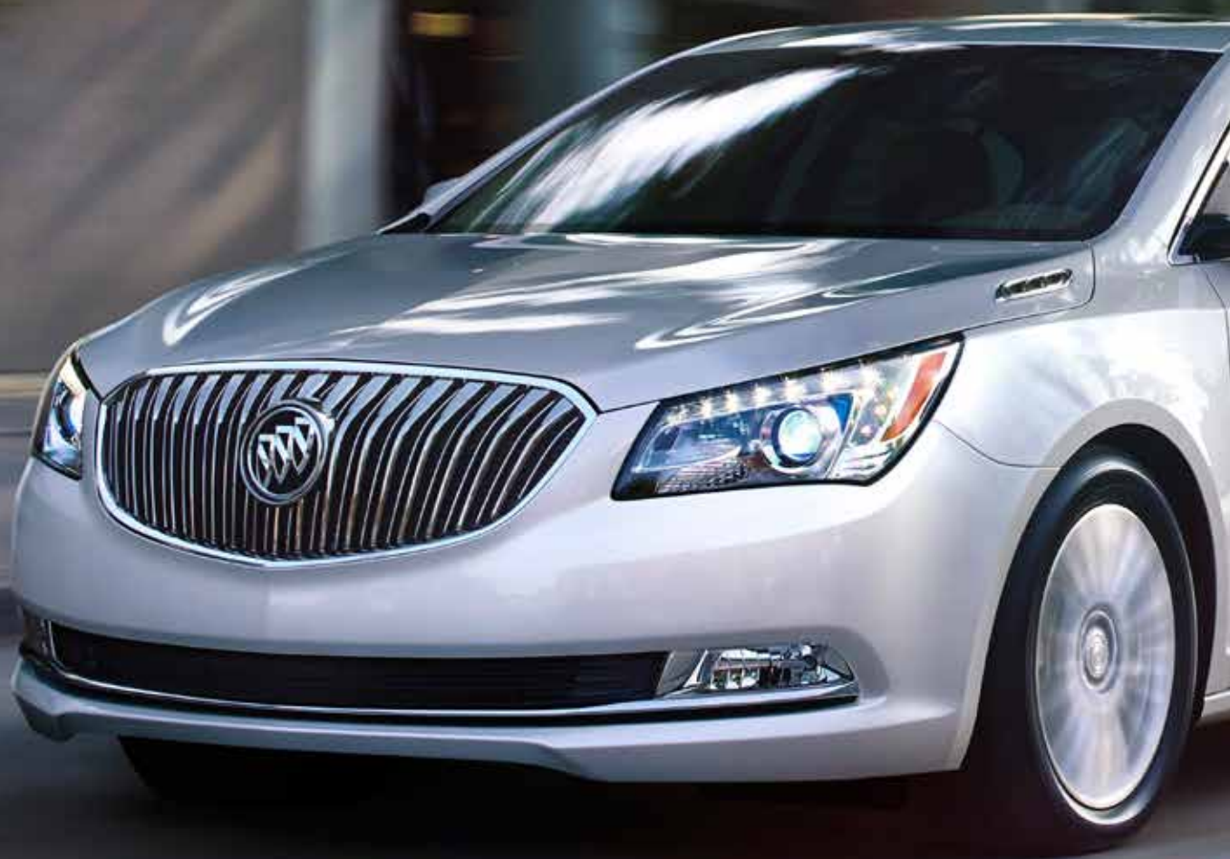
QUICKSILVER METALLIC shown with Premium II Group and optional equipment.