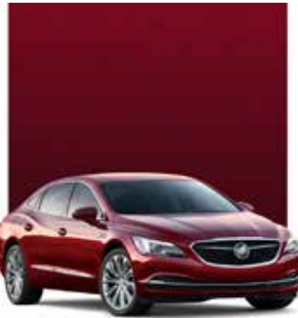
CRIMSON RED TINTCOAT 1,2