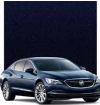
DARK SAPPHIRE BLUE METALLIC 1,2