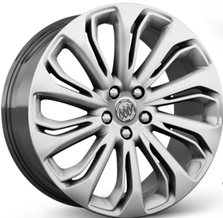
Q7Q 20" ALUMINUM ALLOY