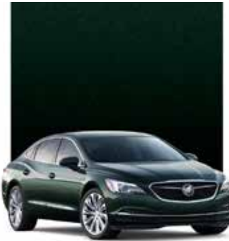
DARK FOREST GREEN METALLIC 2