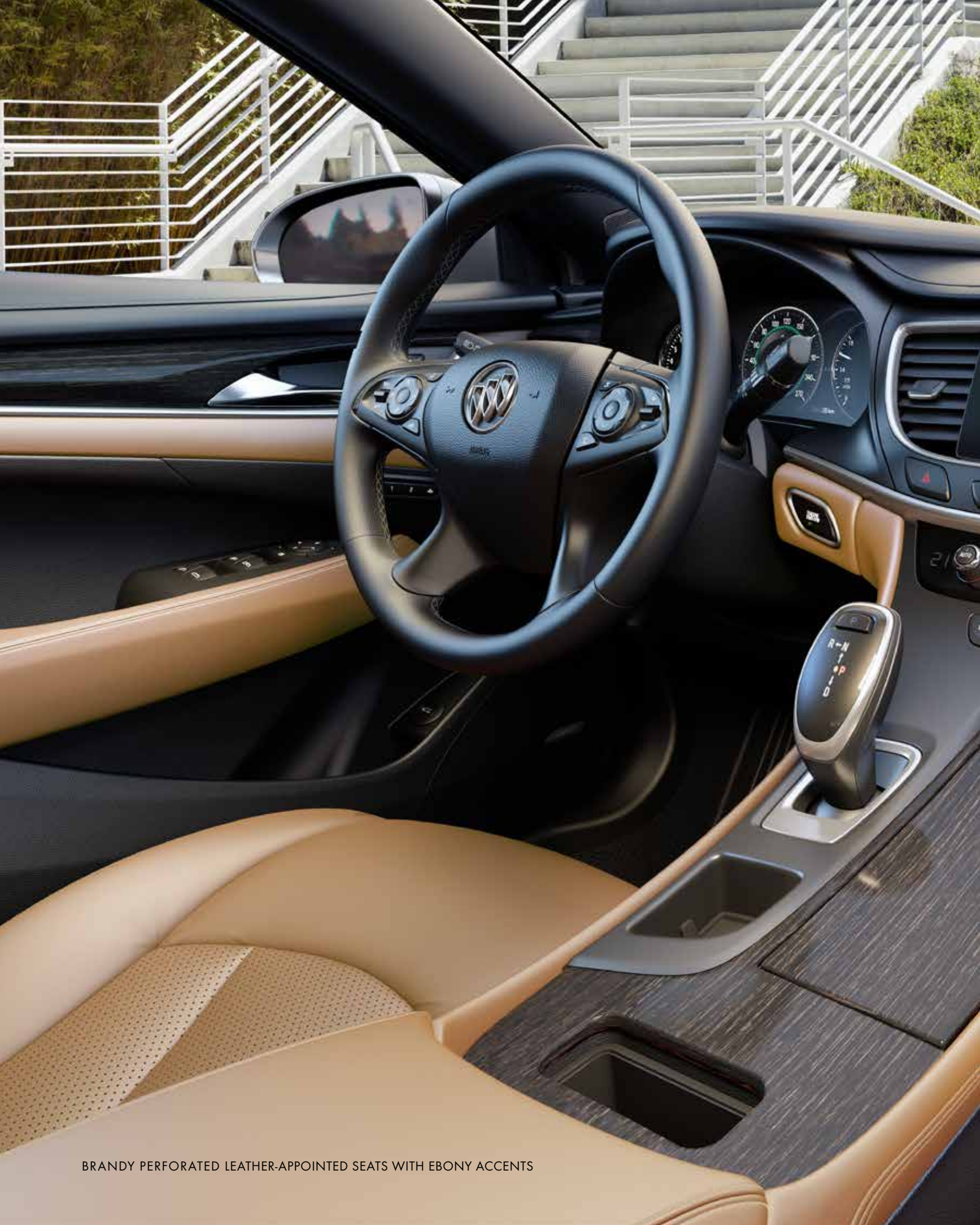
BRANDY PERFORATED LEATHER-APPOINTED SEATS WITH EBONY ACCENTS