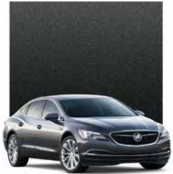
GRAPHITE GREY METALLIC 2