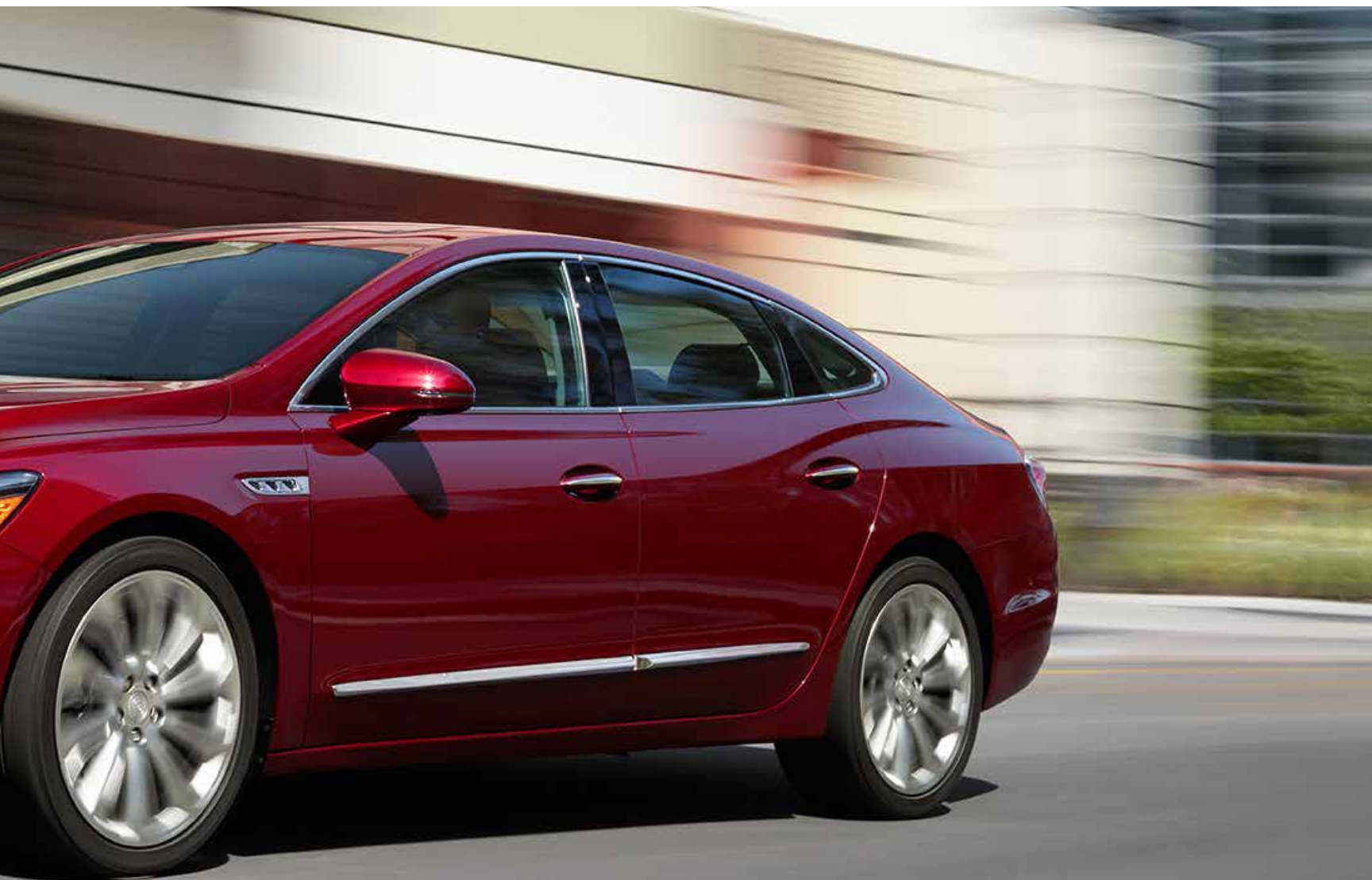
CRIMSON RED TINTCOAT shown with Premium Group and optional equipment.