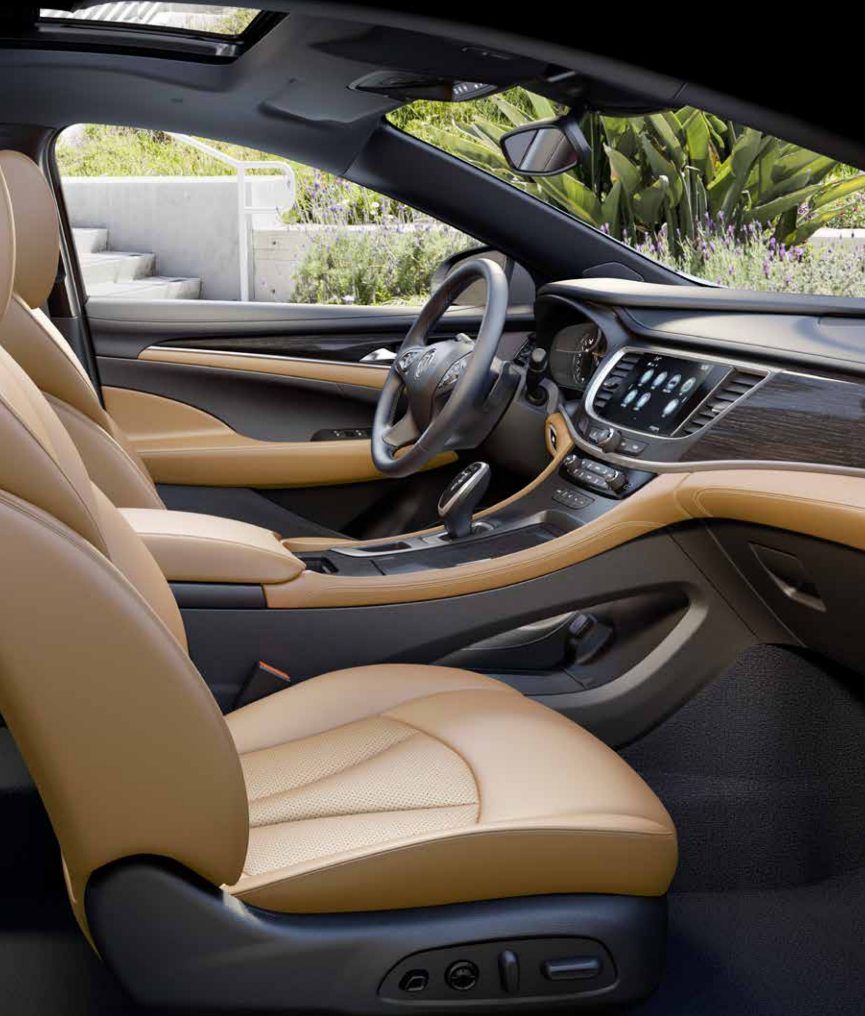
LACROSSE INTERIOR SHOWN IN BRANDY WITH EBONY ACCENTS