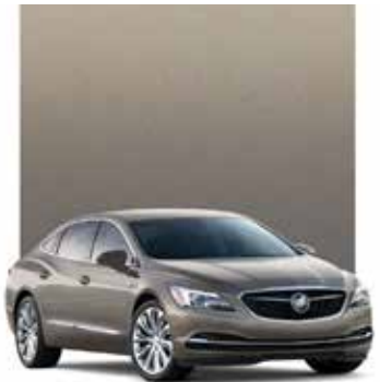
PEPPERDUST METALLIC 2