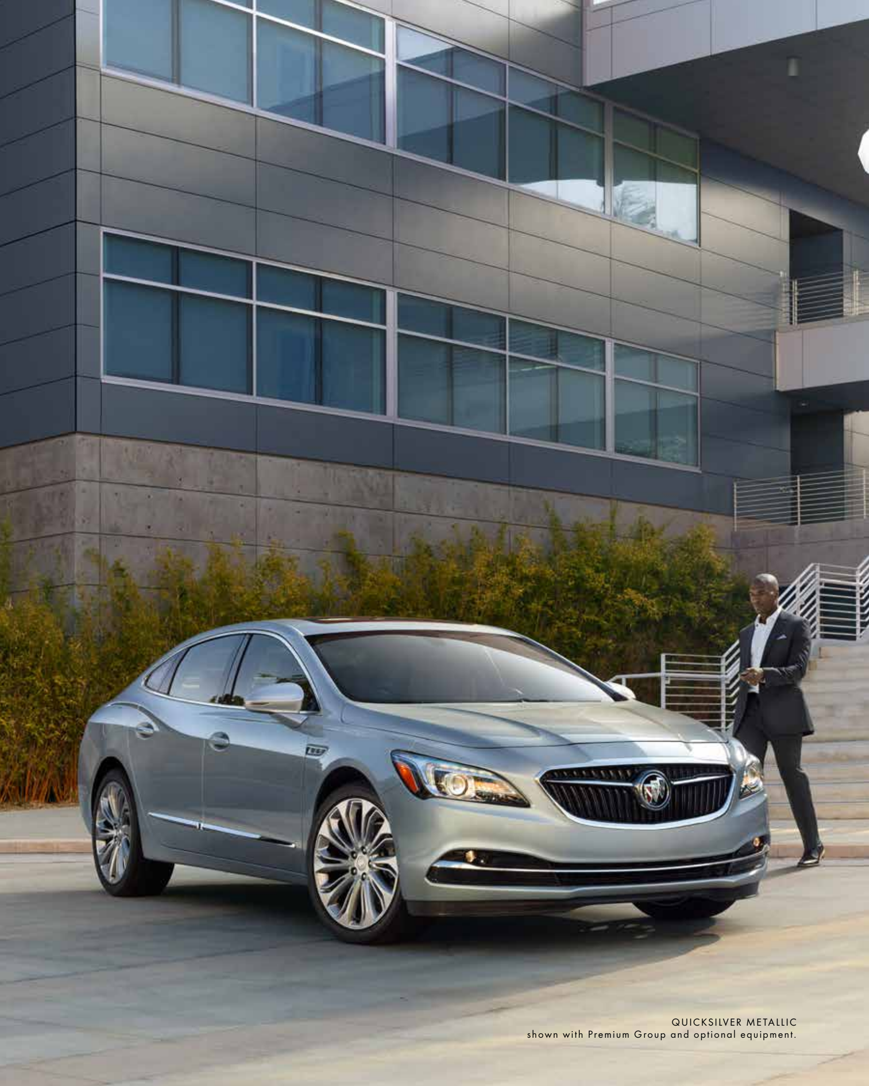
QUICKSILVER METALLIC shown with Premium Group and optional equipment.