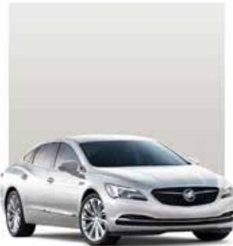
WHITE FROST TRICOAT 1,2