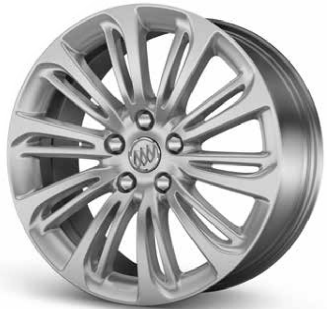
Q7A 18" ALUMINUM ALLOY