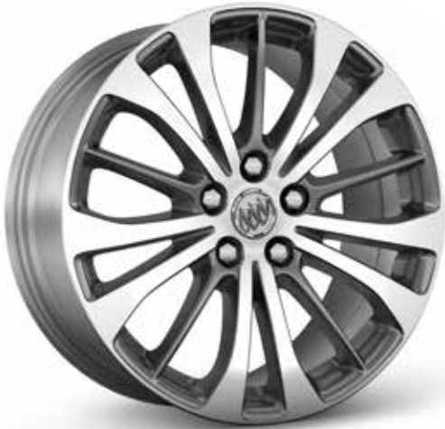
RDA 18" ULTRA-BRIGHT MACHINE-FACED ALUMINUM