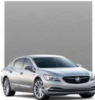
QUICKSILVER METALLIC 2