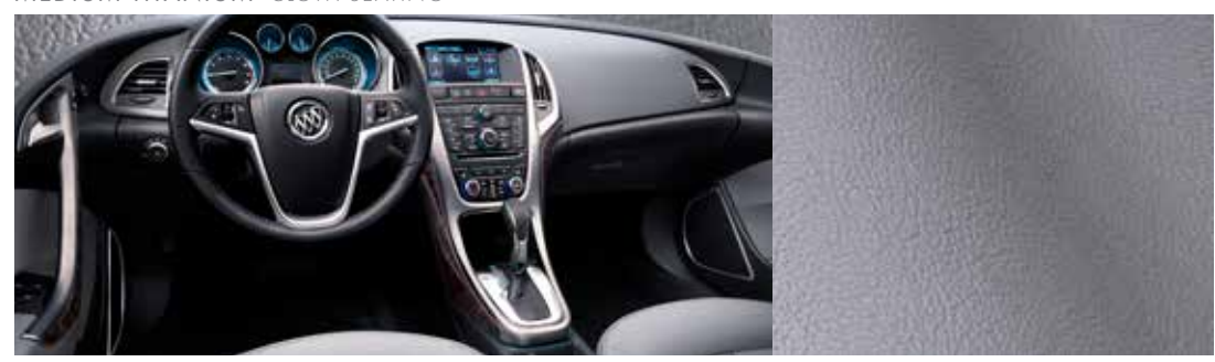
CASHMERE LEATHER-APPOINTED SEATING OR CLOTH