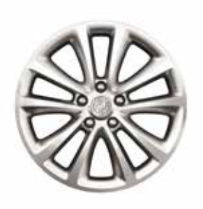
RV3 18" MULTI-SPOKE MACHINED ALLOY WITH STERLING SILVER FINISHED POCKETS