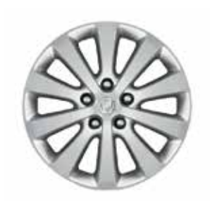
PNM 17" MULTI-SPOKE ALLOY WITH STERLING SILVER FINISH