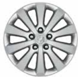
PNM 17" MULTI-SPOKE ALLOY WITH STERLING SILVER FINISH