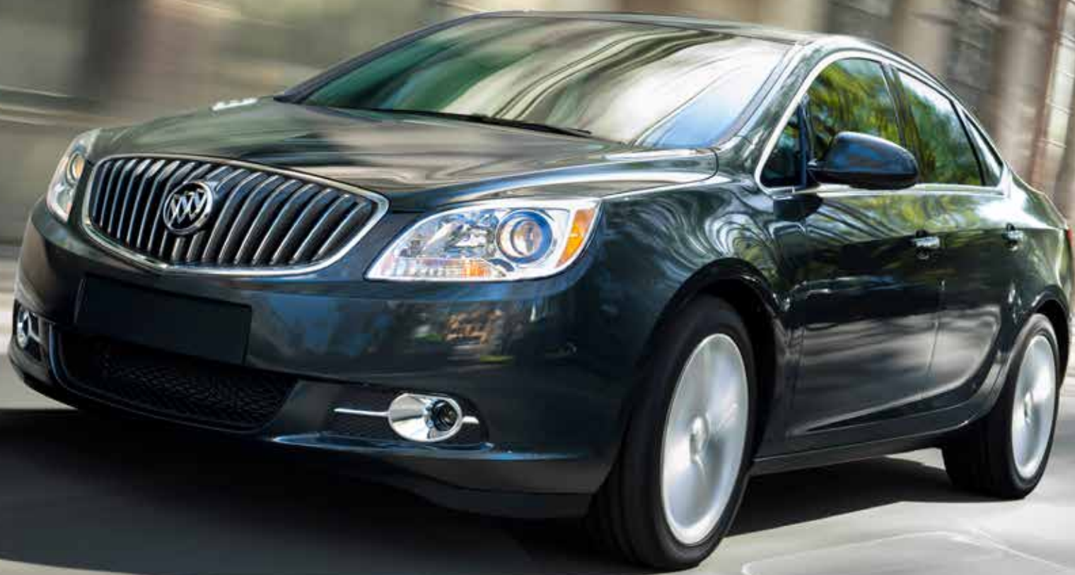
EBONY TWILIGHT METALLIC shown with Leather Group and optional equipment.