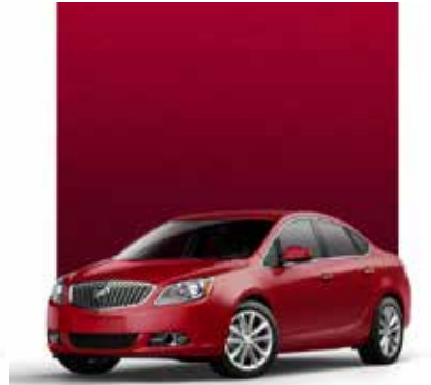
CRYSTAL RED TINTCOAT 2