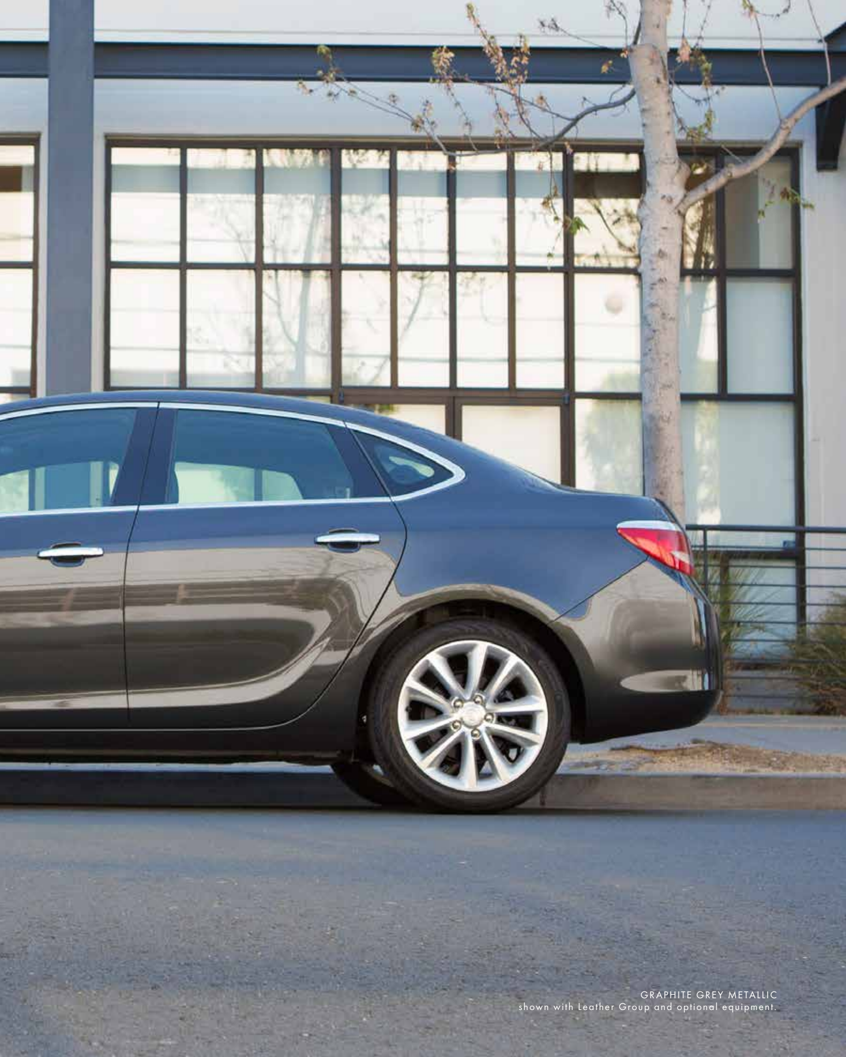
GRAPHITE GREY METALLIC shown with Leather Group and optional equipment.