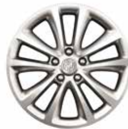
RV3 18" MULTI-SPOKE MACHINED ALLOY WITH STERLING SILVER FINISHED POCKETS