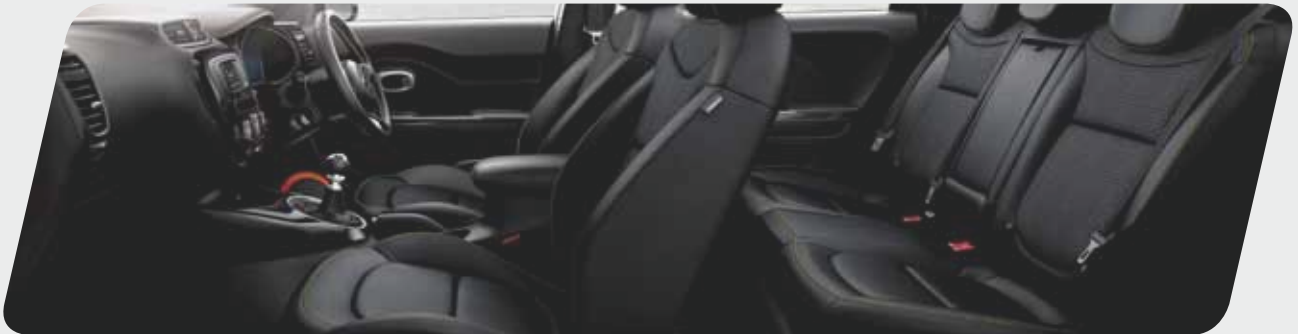
Black Woven with Yellow stitching (black one tone interior) upholstery is standard on the following Soul models: 'Connect' (Clear White and Inferno Red exterior colours only), 'Connect Plus' (Clear White, Inferno Red and Acid Green exterior colours only) and 'Mixx' (Powder Blue and Clear White exterior colours only).