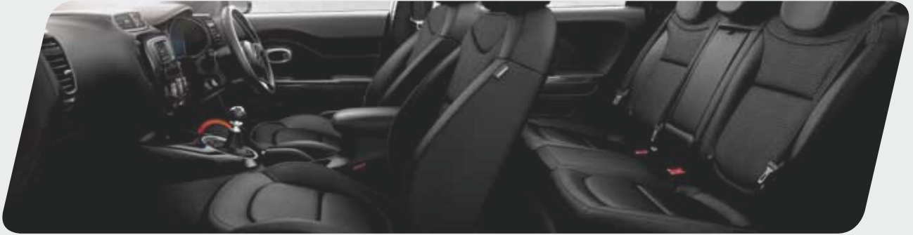
Black Woven and Tricot (black one tone interior) upholstery is standard on the Kia 'Start'.