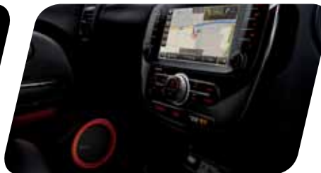
8 Speaker Infinity® audio system with external amplifier and subwoofer ('Connect Plus' upwards) The 8-speaker system has a subwoofer with external amplifier for superior sound quality and has been perfectly tuned to provide excellent sound quality in all driving.