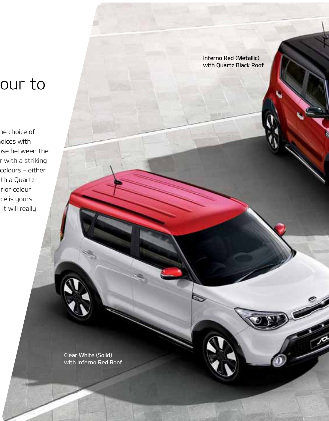
Clear White (Solid) with Inferno Red Roof