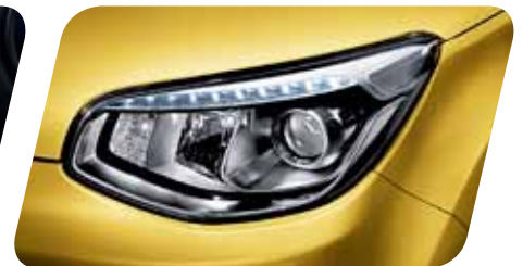
LED daytime running lights ('Mixx' and 'Maxx') Striking LED daytime running lights significantly improve visibility to oncoming traffic