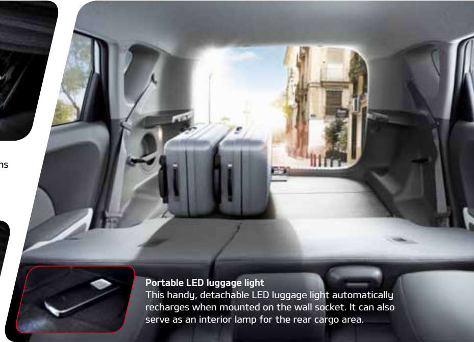
Portable LED luggage light This handy, detachable LED luggage light automatically recharges when mounted on the wall socket. It can also serve as an interior lamp for the rear cargo area.