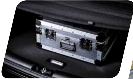
Luggage area load cover The screen helps you keep valuable items out of sight from prying eyes.