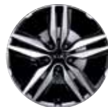
Premium 18" Alloy Wheels

'Maxx' 1.6 litre GDi (petrol) 130bhp 6-speed manual (170 g/km)