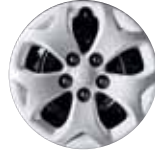
16" Steel Wheels

'Start' 1.6 litre GDi (petrol) 130 bhp 6-speed manual (158 g/km)