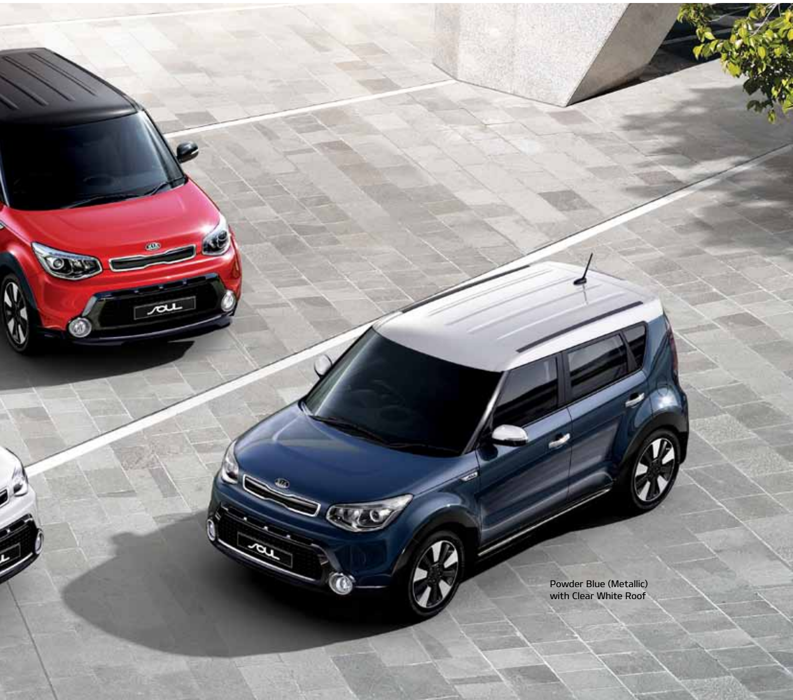
Powder Blue (Metallic) with Clear White Roof