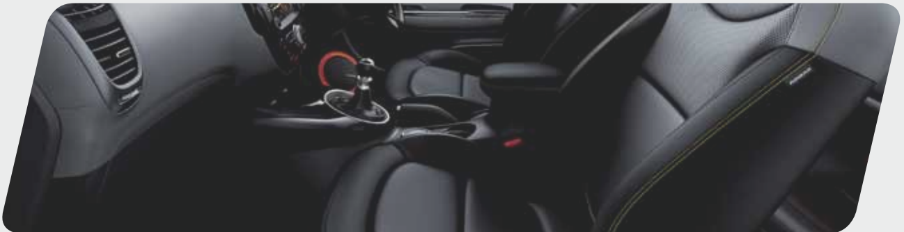
Grey and black woven with yellow stitching (grey two-tone interior) upholstery is standard on the following Soul models: 'Connect' (Quartz Black and Titanium Silver exterior colours only), 'Connect Plus' (Quartz Black and Titanium Silver exterior colours only) and 'Mixx' (Inferno Red exterior colour only).