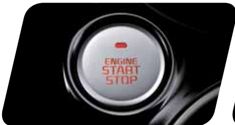
Engine start/stop button with smart entry system ('Maxx') The engine starts with one touch of the start/stop button which adds a sporty feel to the cabin.