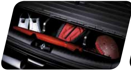
Luggage under-floor tray ('Mixx' upwards) A handy partitioned tray located under the floor of the luggage compartment is the perfect place to store emergency safety and car cleaning supplies.