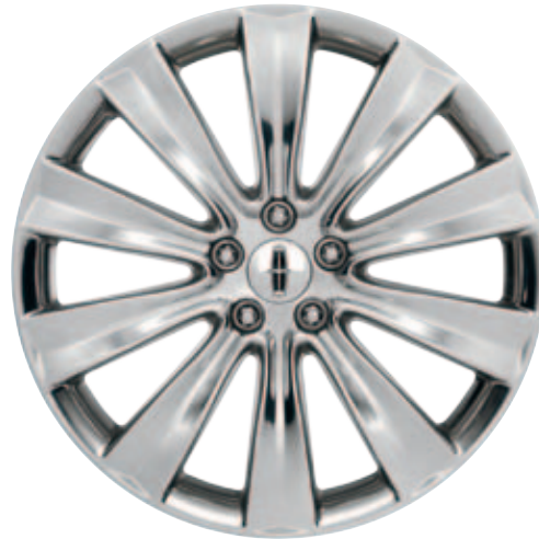
20" Polished Aluminum Standard on EcoBoost®