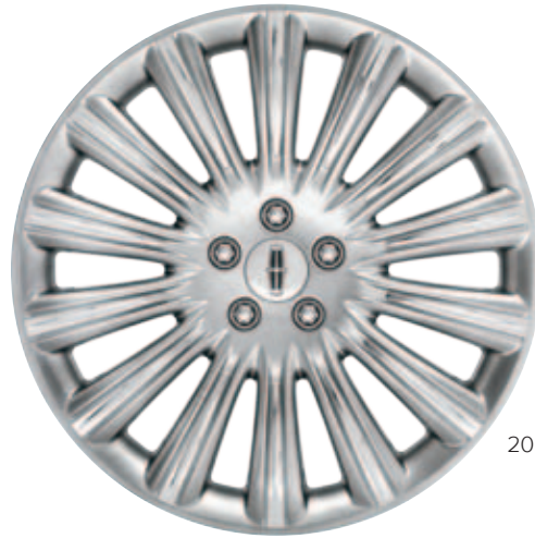
20" Premium Painted Aluminum with Chrome Inserts Available