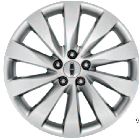
19" Premium Painted Aluminum Standard

Technology Package includes adaptive cruise control and collision warning with brake support, active park assist, and Lane-Keeping System 3