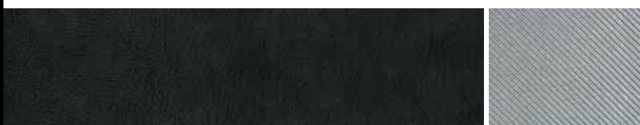
CHARCOAL BLACK PREMIUM LEATHER | WOVEN-METAL APPEARANCE PACKAGE

Woven-Metal Appearance Package is available with all exterior colors