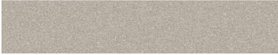
GOLD LEAF METALLIC