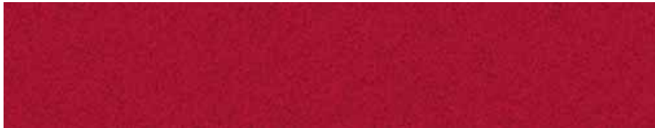
RED CANDY METALLIC TINTED CLEARCOAT 1