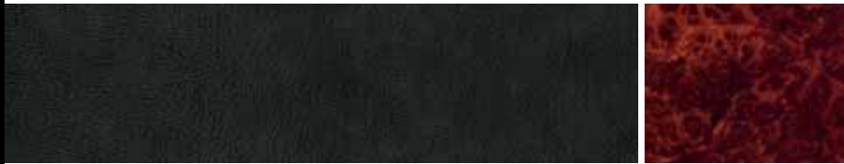
CHARCOAL BLACK PREMIUM LEATHER | WALNUT SWIRL WOOD

Charcoal Black Premium Leather trim is available with all exterior colors