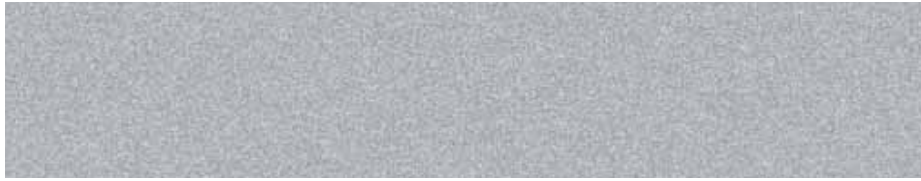
INGOT SILVER METALLIC