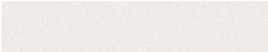
WHITE PLATINUM METALLIC TRI-COAT 1

1 Additional cost. Colors are representative only.