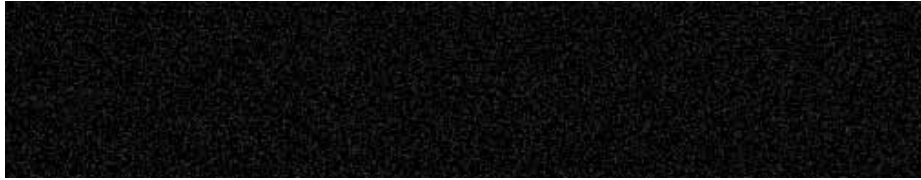
TUXEDO BLACK METALLIC