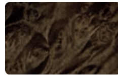
Prussian Burl Wood