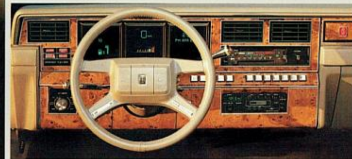
1986 Lincoln Town Car Cartier Designer Series interior in Oxford Gray. Some features shown may be optional. See option list on page 16.

Luxuriously appointed, masterfully fashioned, the Cartier Designer Series Lincoln Town Car is a total delight to the senses.