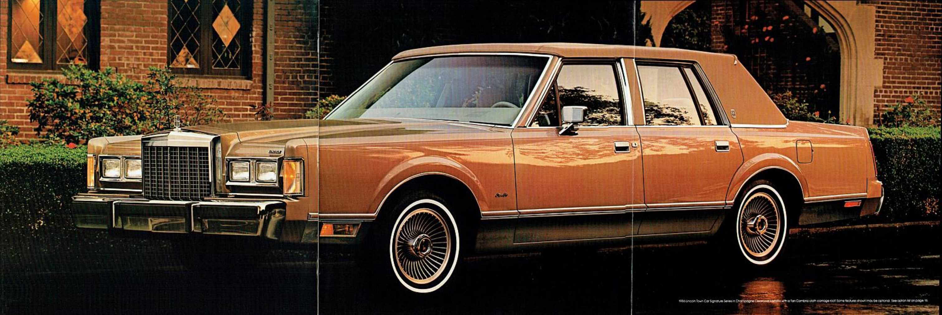
1986 Lincoln Town Car Signature Series in Champagne Clearcoat Metallic with a Tan Cambria cloth carriage roof. Some features shown may be optional. See option list on page 18.