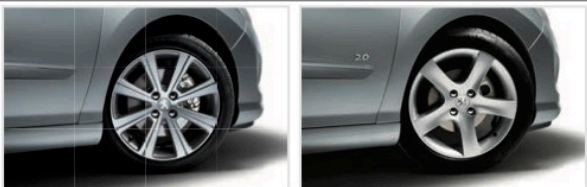
408 1.6 TURBO MELBOURNE