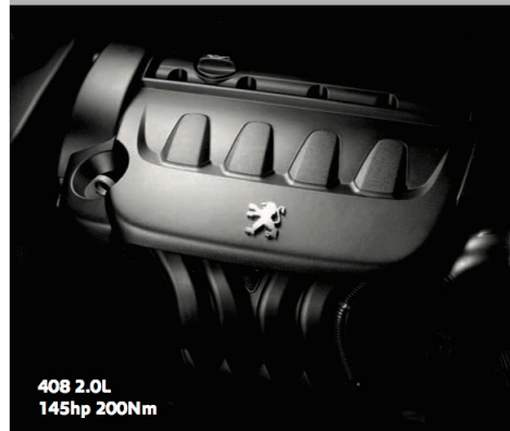
408 2.0L 145hp 200Nm

The interior styling of the 408 is one of unbridled space and elegant sophistication. A combination of exceptional comfort and premium European styling creates the desire to extend the moment, the time of a journey, for as long as possible. Drive it to experience it.