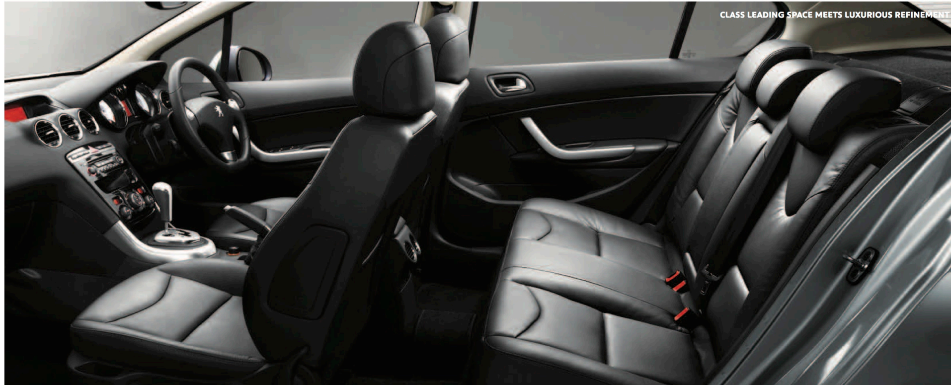
CLASS LEADING SPACE MEETS LUXURIOUS REFINEMENT