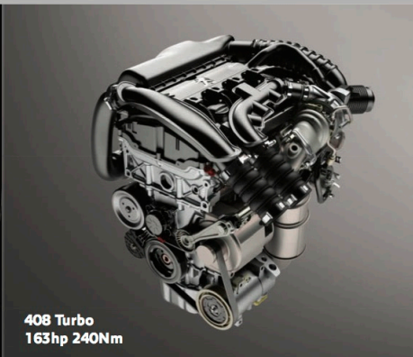
408 Turbo 163hp 240Nm