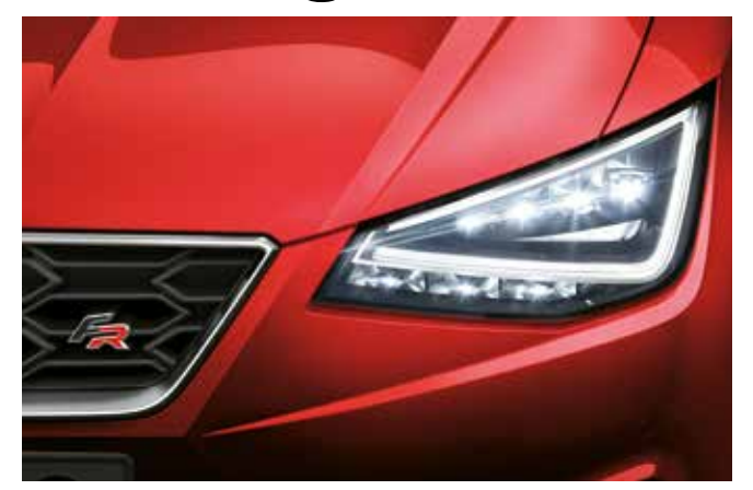
The future looks brilliant. The All-new SEAT Ibiza's Full LED Headlights illuminate the night as if you were driving in daylight. You'll love them.