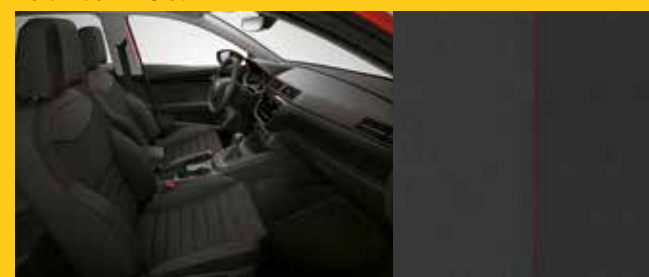
Black Alcantara with red stitching 🖪