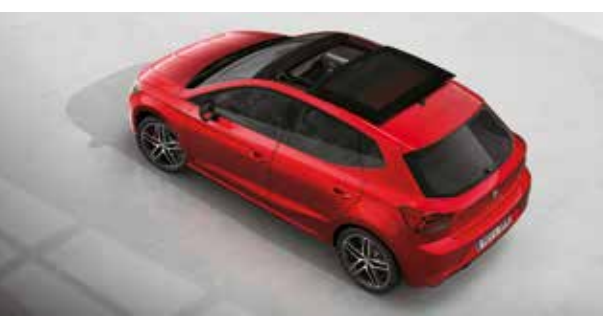
The panoramic glass sunroof allows more light into the cabin and gives a greater feeling of space.