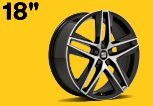
18" 'Performance' Bi-colour Machined Alloy Wheels 🖪