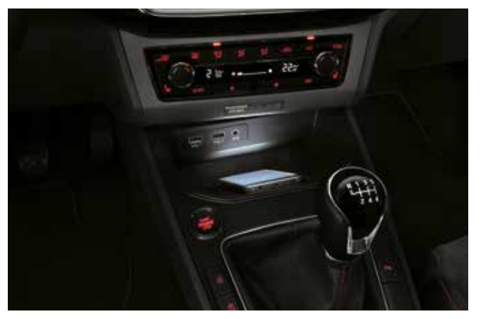
If it's not easy, it's not mobility. So just place your smartphone in SEAT Ibiza's Connectivity Hub and let it charge up without wires or fuss. The integrated GSM amplifier ensures signal won't be a problem either.