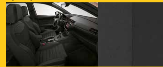
Black Alcantara with contrast stitching 🖾

S /S/ SE /SE/ SE Technology /SE Tech/ FR /FR/ XCELLENCE /XC/