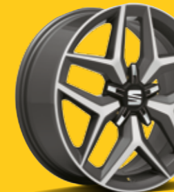
17" 'Dynamic' Bi-colour Machined Alloy Wheels XC

S /S/ SE /SE/ SE Technology /SE Tech/ FR /FR/ XCCELLENCE /XC/