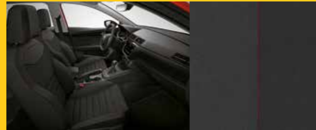
Black Alcantara with red stitching FR

S /S/ SE /SE/ SE Technology /SE Tech/ FR /FR/ XCCELLENCE /XC/