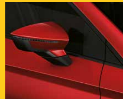
Desire Red*** S SE SE TECH FR

S /S/ SE /SE/ SE Technology /SE Tech/ FR /FR/ XCCELLENCE /XC/