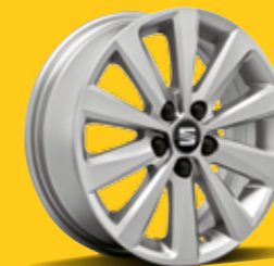
'Enjoy' Alloy Wheels SE SE TECH