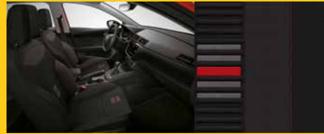
Nora Black FR Cloth FR