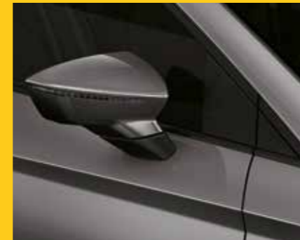
Monsoon Grey** S SE SE TECH FR XC