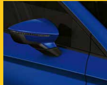
Mystery Blue** S SE SE TECH FR