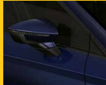
Mediterranean Blue* S SE SE TECH FR XC

Make your statement with the perfect choice of colour.