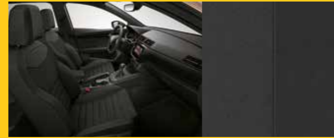
Black Alcantara with contrast stitching XC