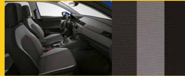
Orgad Grey Cloth SE SE TECH