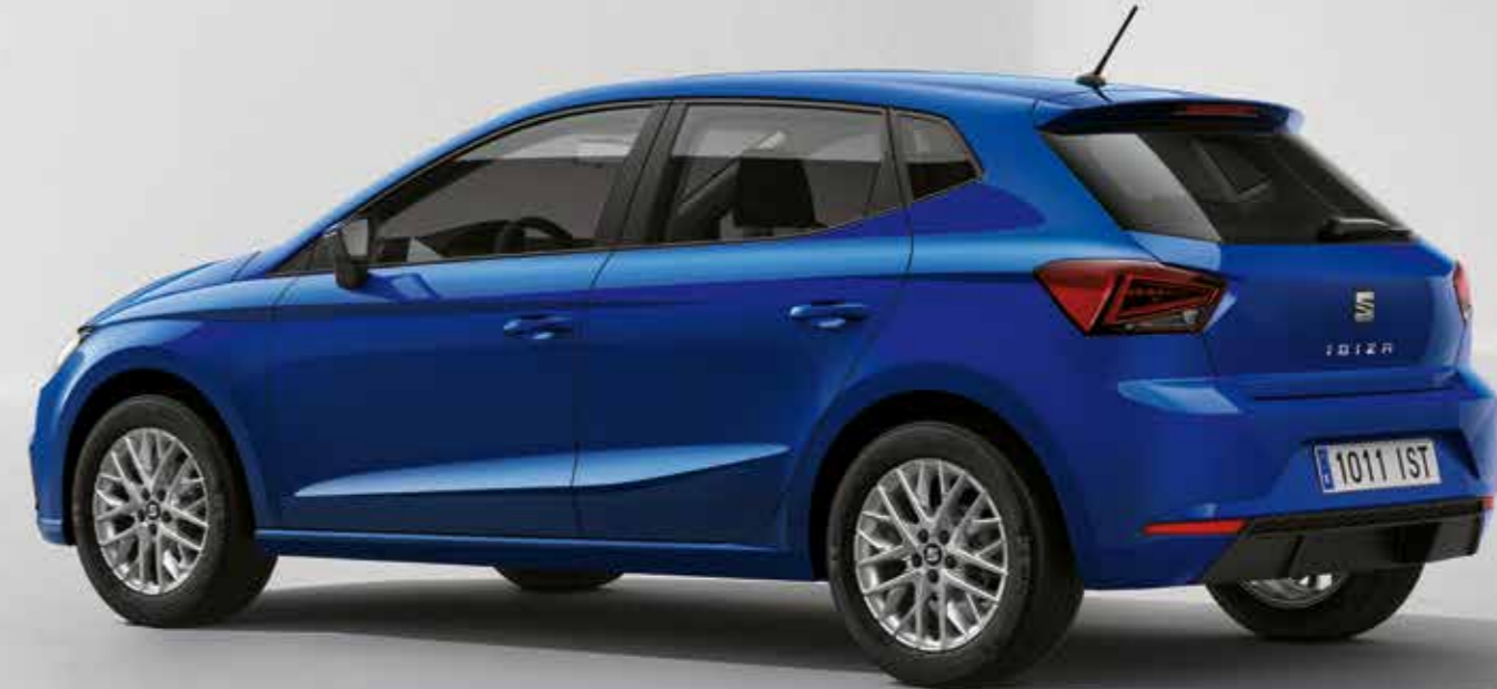
Model shown: Ibiza SE Technology with optional 16" "Design" alloy wheels, Vision Pack Plus and Mystery Blue metallic paint.