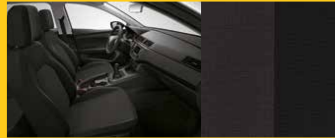
Titan Black Cloth S

Why have one choice, when you can have so many? With the All-new Ibiza, the fun's only getting started. So aim higher and make it yours with the choices of upholstery colours, fabrics and finishing touches that suit you, not us.