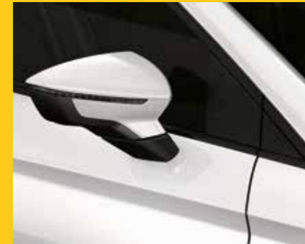
White* S SE SE TECH FR XC