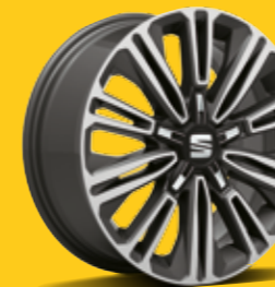
16" 'Design' Machined Alloy Wheels XC