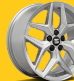
17" 'Dynamic' Alloy Wheels FR