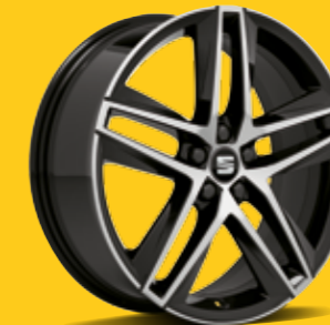
18" 'Performance' Bi-colour Machined Alloy Wheels FR