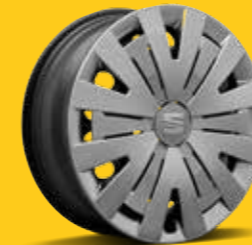
'Urban' Steel Wheels S