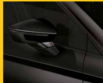
Midnight Black** S SE SE TECH FR XC