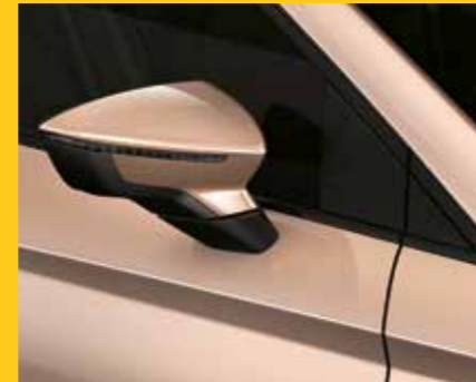
Mystic Magenta** S SE SE TECH XC