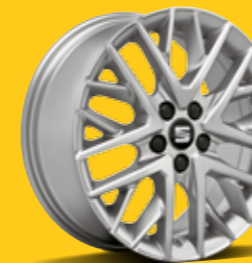
'Design' Alloy Wheels SE SE TECH