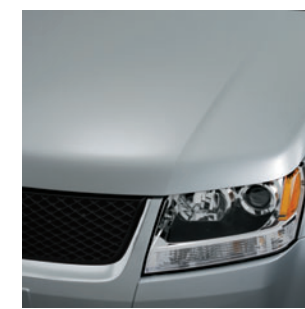
Silky Silver Metallic