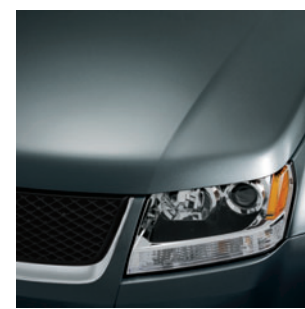
Azure Grey Metallic