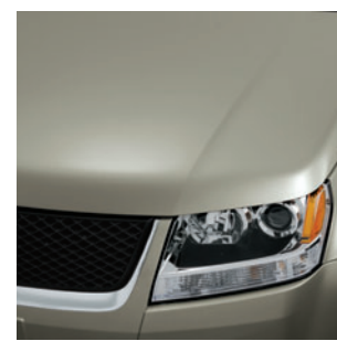
Clear Beige Metallic