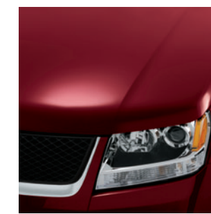
Shining Red Pearl