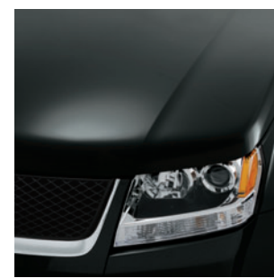
Black Onyx Pearl