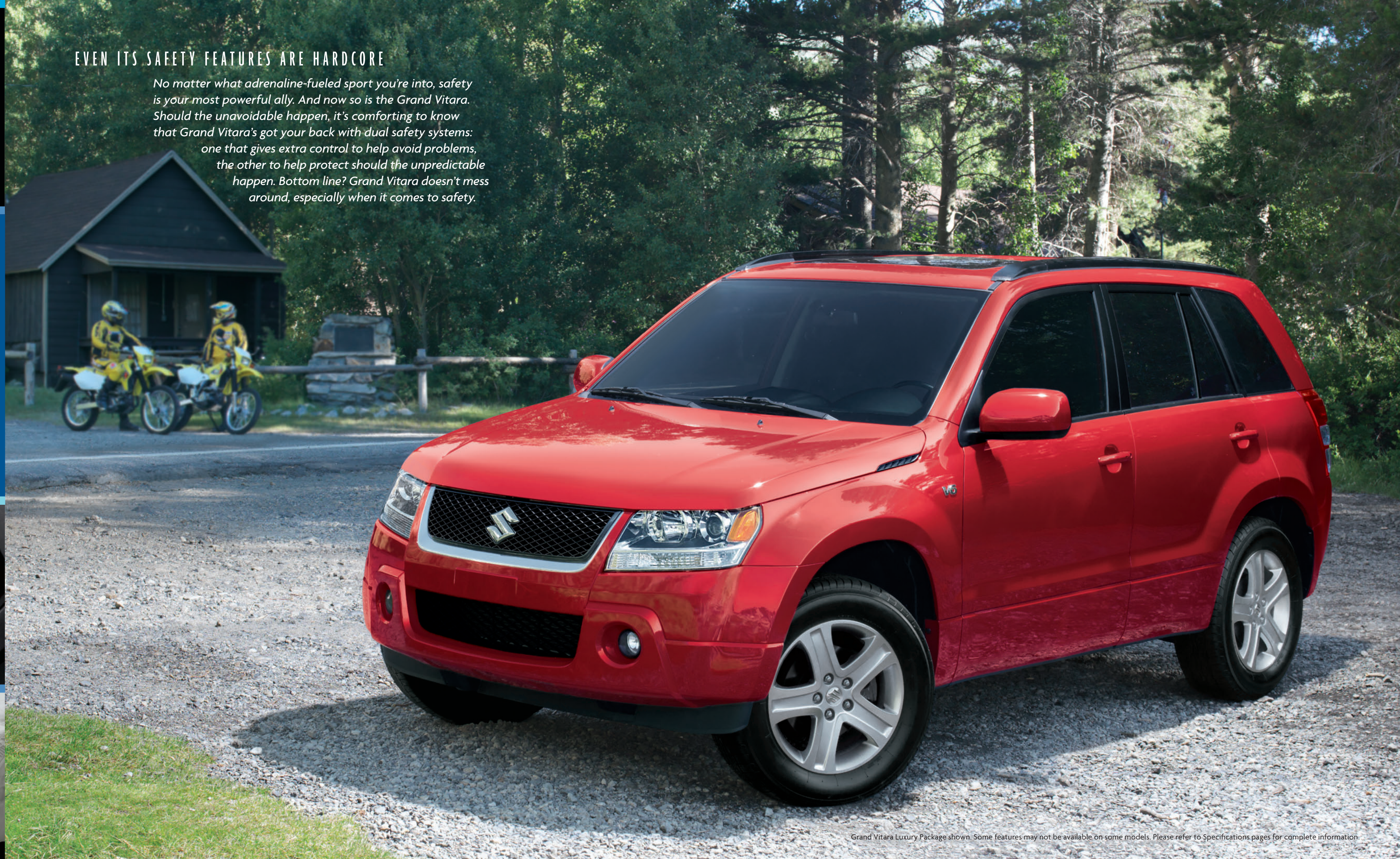
Grand Vitara Luxury Package shown. Some features may not be available on some models. Please refer to Specifications pages for complete information.