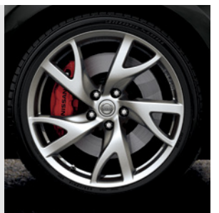
subject to customer agreement at siriusxm.ca/terms. All fees and programming subject to change. ©2016 Sirius XM Canada Inc. The Sirius XM % and Sirius XM % names and all related marks and logos are trademarks of Sirius XM Radio Inc. All other trademarks are the property of their respective owners. Alcantara® is a registered trademark of Alcantara S.p.A. Corporation. Bose® is a registered trademark of The Bose Corporation. Bridgestone® and Potenza® are registered trademarks of Bridgestone Corporation. HomeLink® is a registered trademark of Gentex Corporation. iPod® is a registered trademark of Apple, Inc. All rights reserved. iPod® not included. RAYS® is a registered trademark of RAYS Engineering. Recaro® is a registered trademark of Recaro North America Inc. Yokohama® and ADVAN Sport® are registered trademarks of The Yokohama Tire Corporation.