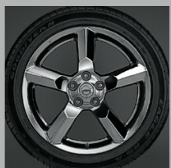
18" Chrome Wheel