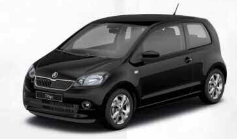
3. Deep Black Pearlescent*