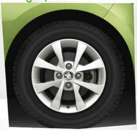
14" Apus alloys 5J x 14"† and temporary space saver spare wheelt