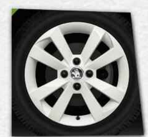
15" Auriga wheels white