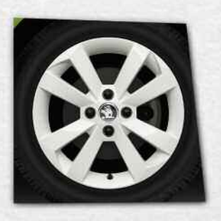
15" Auriga alloys in white

- you can choose from black or white 15" Auriga alloy wheels to personalise your Colour Edition.