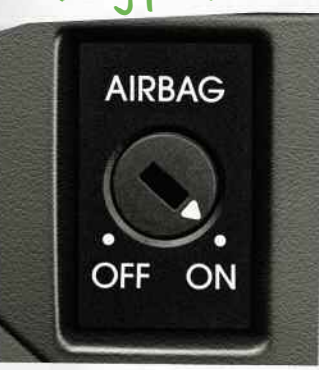
City-Safe with ESC and Passenger airbag switch-off function