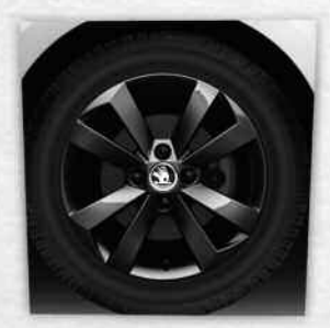
15" Auriga alloys in black