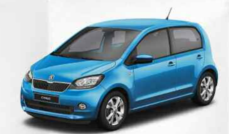
8. Crystal Blue metallic