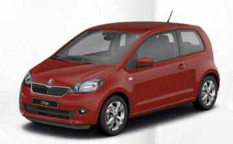
1. Tornado Red (solid colour)