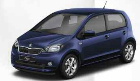
7. Dark Sapphire Blue metallic