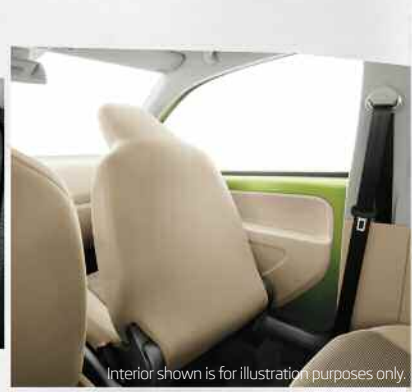
A backrest release for front seats with Easy Entry