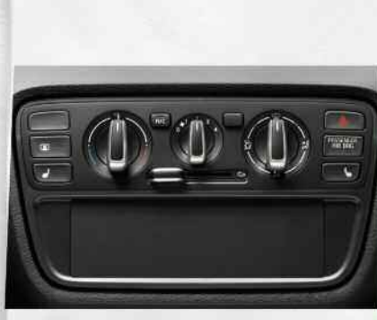
Manual air conditioning