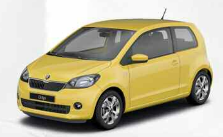
5. Sunflower Yellow*