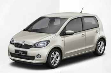
6. Tungsten Silver metallic

* Deep Black Pearlescent and Sunflower Yellow are charged as metallic colours, please see individual options for further details.