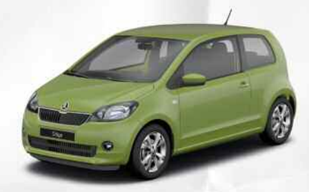
4. Spring Green metallic