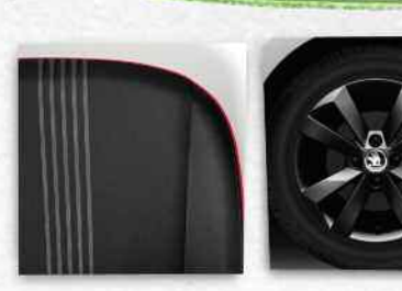
Monte Carlo upholstery 15" Auriga black alloys