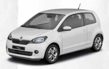
2. Candy White (special colour)