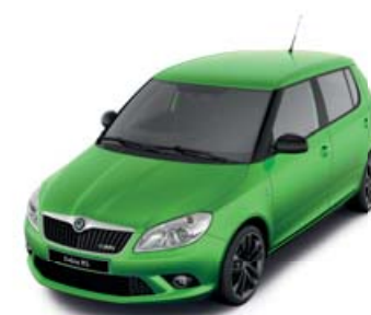
Rallye Green metallic