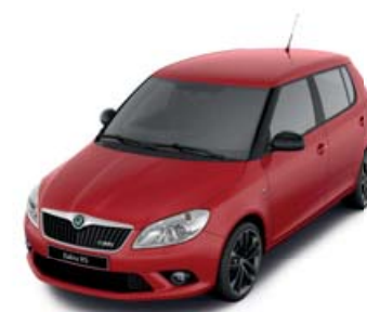
Corrida Red uni