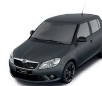
Anthracite Grey metallic