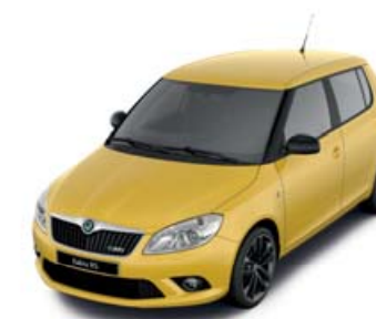
Sprint Yellow special