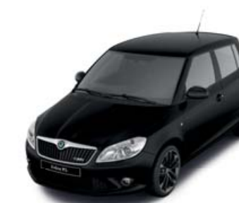
Black Magic pearl effect