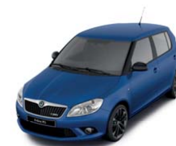
Race Blue metallic