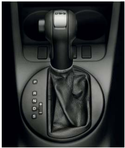
The 1.4 TSI/132kW engine, delivered along with the 7-speed DSG automatic transmission, offers remarkable performance and power in a wide range of revs, as well as economic operation. This engine enables Fabia RS to accelerate from 0 to 100 km/h in just 7.3 seconds.