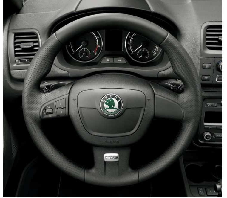
The 3-spoke sports leather steering wheel enhances the dynamic riding experience. The car may also come equipped with the multifunctional leather steering wheel (see photo), which enables you to control the radio, phone and shifting of the DSG automatic transmission.