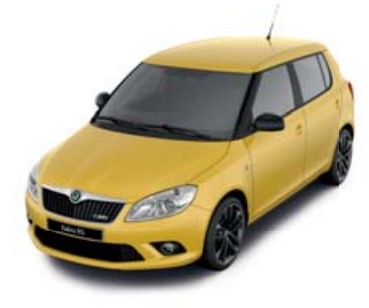
Sprint Yellow special