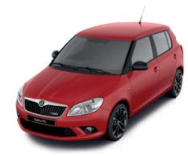
Corrida Red uni