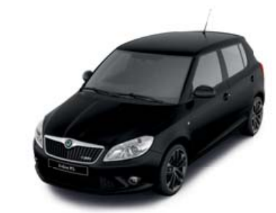
Black Magic pearl effect