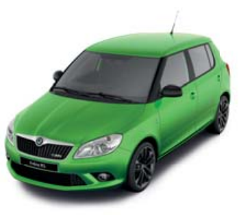
Rallye Green metallic