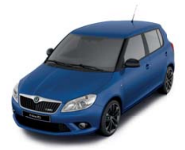
Race Blue metallic