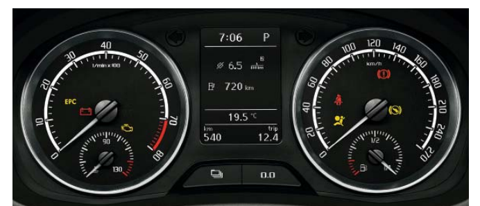
The High-line instrument panel incorporates the Maxi DOT multifunctional display which, among other details, displays the current DSG automatic transmission speed gear.