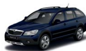
Pacific Blue uni