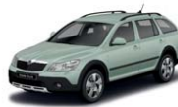
Arctic Green metallic