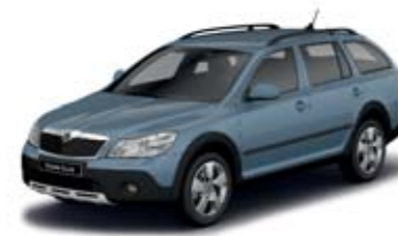
Satin Grey metallic