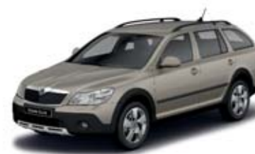
Cappuccino Beige metallic