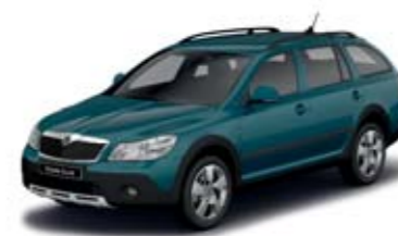
Lava Blue metallic