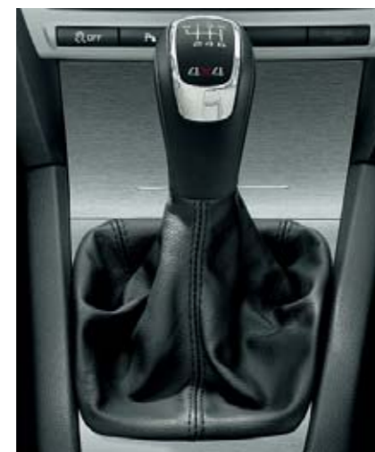
The gear stick knob is made of leather and decorated with the 4x4 emblem . The vehicle may be equipped with a manual 6-speed transmission (on the photo) and for the 2.0 TDI CR DPF/103kW engine we also offer an automatic 6-speed DSG. Its excellent manoeuvrability is aided by advanced electronic systems including ESP (Electronic Stability Programme).