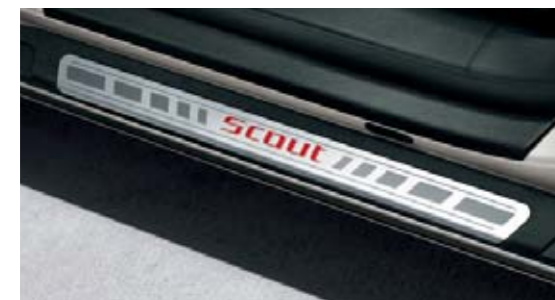
The decorative door sill strips with the Scout inscription are an original accessory with aesthetic as well as practical functions.