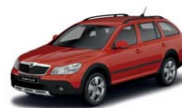
Corrida Red uni