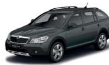
Anthracite Grey metallic