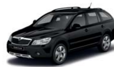
Black Magic pearl effect