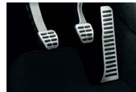
The noble steel foot pedal covers , an optional extra, amplify the elegant sports style of the interior and the sense of comfort.