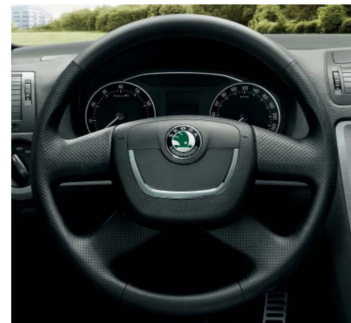
The 4-spoke steering wheel of the Scout model is wrapped in both smooth leather and, in selected areas, compressed leather.