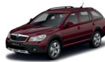
Rosso Brunello metallic