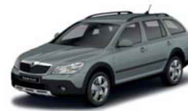
Platin Grey metallic