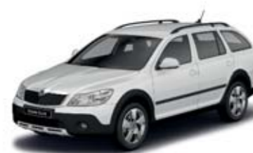
Candy White uni