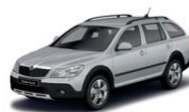
Brilliant Silver metallic