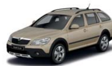
Safari Beige metallic*