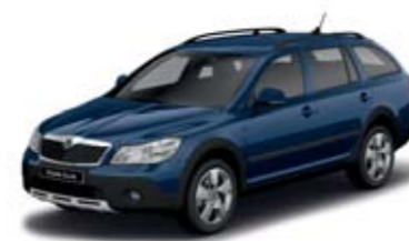
Storm Blue metallic**