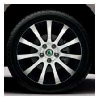
The 17" Annapurna alloy wheels are in a distinctive 2-colour design.