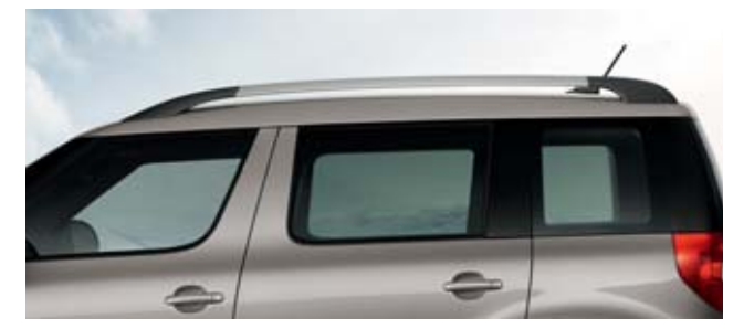
The silver longitudinal roof railings increase the practicality of the vehicle.

The ŠKODA Yeti AllDrive will gladly take you for any track. You will feel perfectly comfortable driving this compact SUV in the city but you'll only discover its true colours when driving on terrain. Whether you set off to high mountains, deep valleys, on snow, sand or gravel, you can always completely rely on the vehicle. The special model is based on the Ambition version and, in addition, brings equipment such as hill hold control, rough road package, AllDrive logo on front mudguards and decorative door sill strips with the AllDrive inscription.