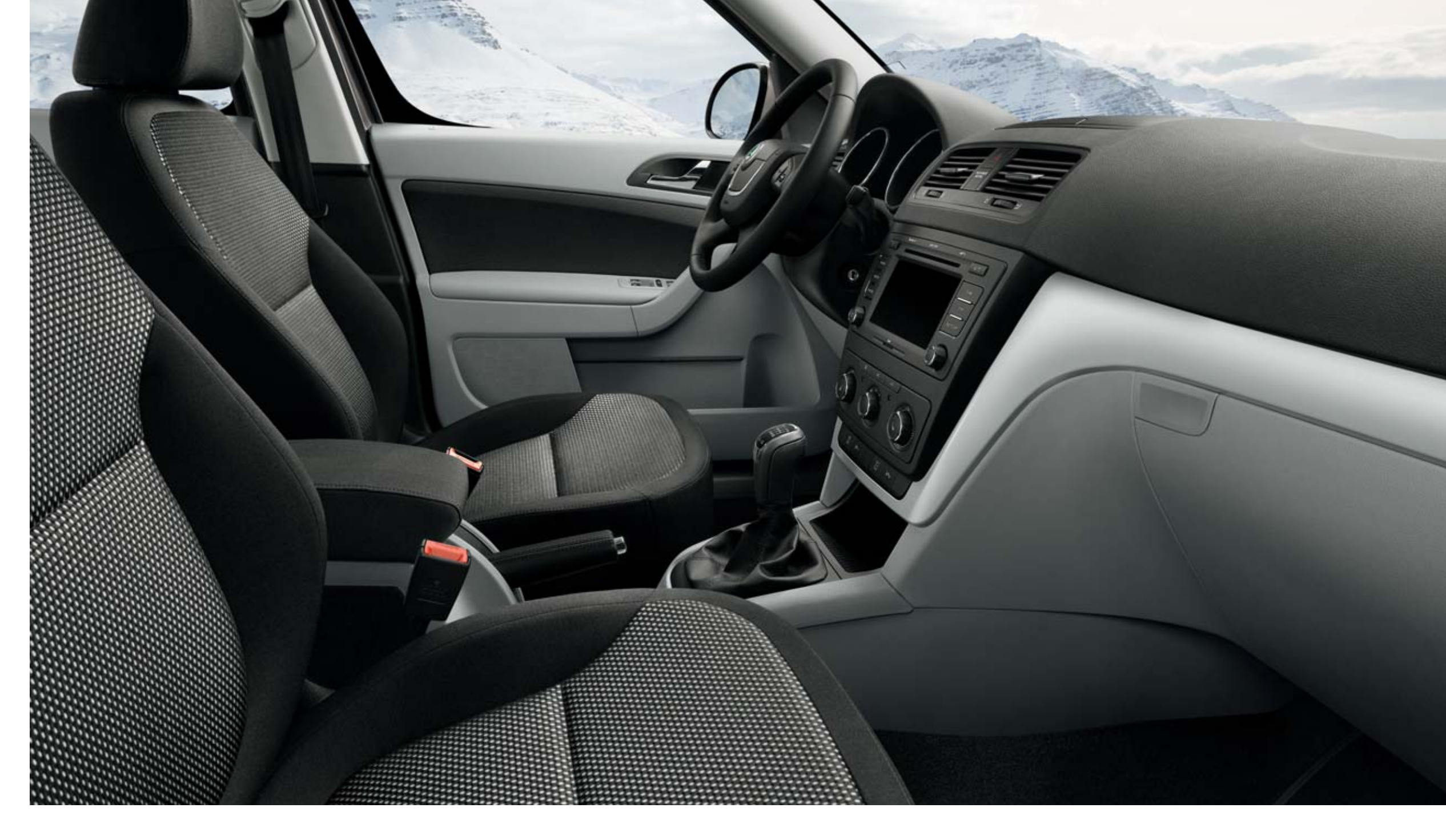
The AllDrive interior in Onyx with high-quality upholstery on the middle section of the seats is available with Onyx/Onyx or Onyx/grey dashboard.