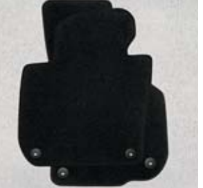
The removable woven carpets with special stitching come as standard for the entire AllDrive special range.