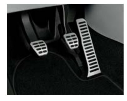
The noble steel foot pedal covers accentuate the sense of comfort.