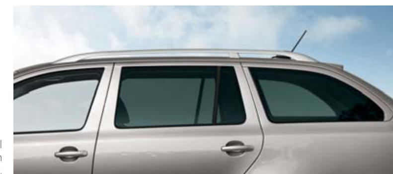
The AllDrive logo on the front mudguards is an original mark of all three special models.

The longitudinal roof railings come in an exclusive silver colour.