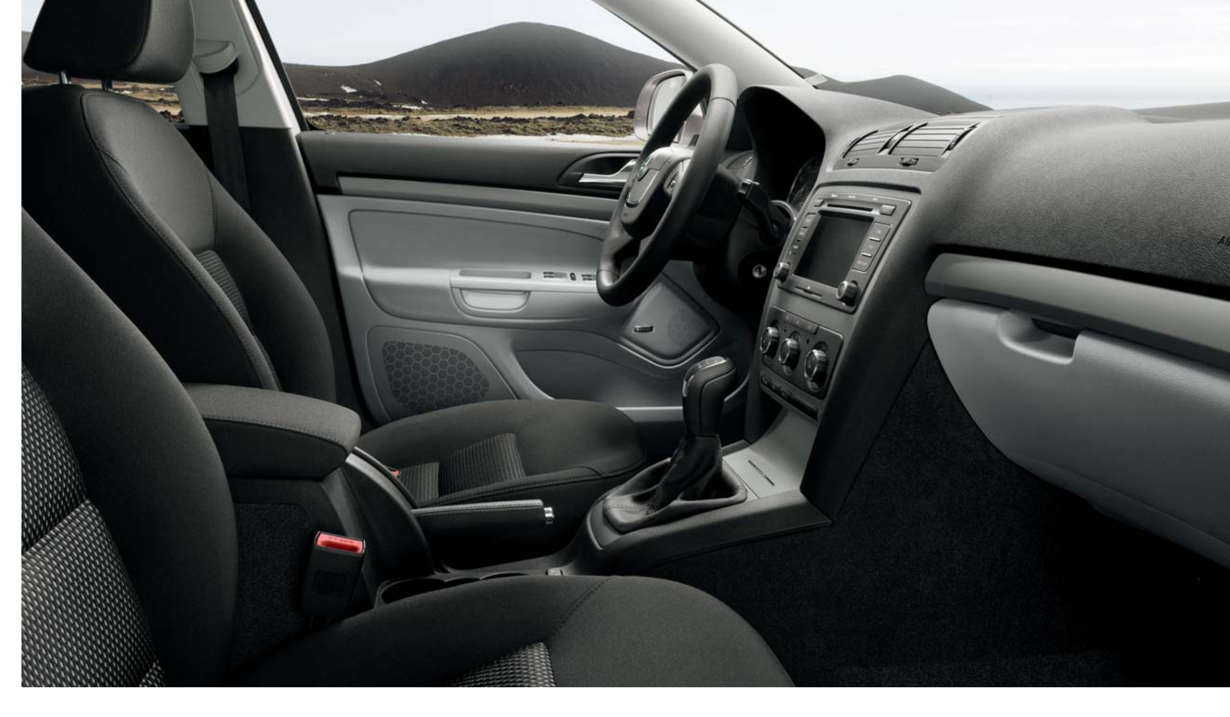
The AllDrive interior in Onyx with high-quality upholstery on the middle section of the seats is available with Onyx/Onyx or Onyx/grey dashboard.