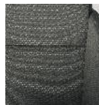
Onyx/grey sports seats