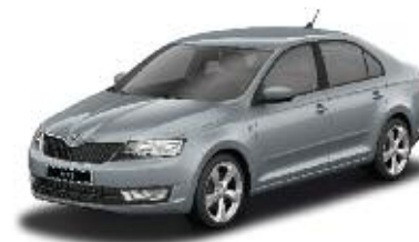
9. Steel grey metallic *