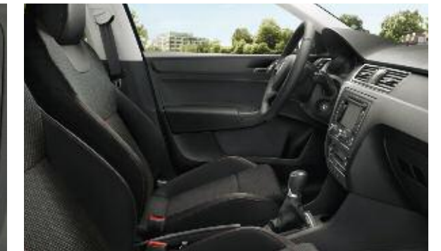
Sports Seats (Optional on SE and Elegance)

◊ For terms and conditions please see page 35.