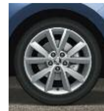
16" 'Antia' alloy wheels