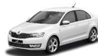
1. Candy White