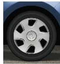
15" 'Dakara' steel wheels