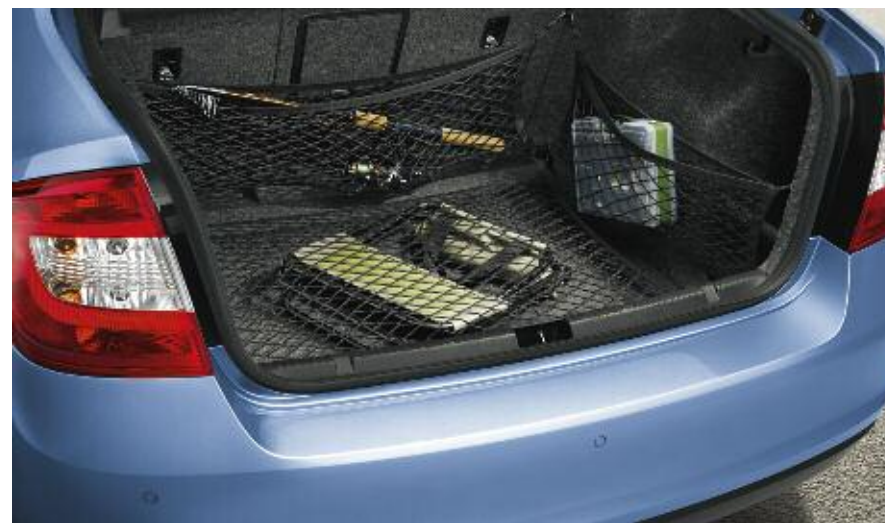
The Net Programme , which consists of two vertical nets and one horizontal net on the floor, enables you to easily secure items so they do not shift while driving (Optional).