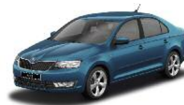
10. Petrol Blue metallic