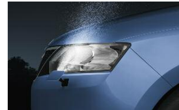
Telescopic front headlight washers (Optional on SE and Elegance)