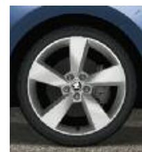
17" 'Camelot' alloy wheels

Pictures are for illustrative purposes only. Please visit your local retailer for further information.