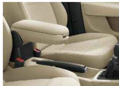
The rear seat armrest with an integrated holder for two drinks gives rear seat passengers the opportunity to enjoy the ride with refreshments. (Optional on SE and Elegance).

As well as offering comfort, this armrest opens to offer yet another clever storage solution. (Standard on Elegance, optional on S and SE).