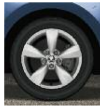
15" 'Carme' alloy wheels