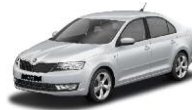
5. Brilliant Silver metallic