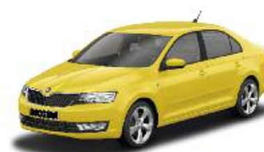
2. Sprint Yellow special