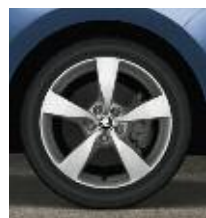
16" 'Dione' alloy wheels