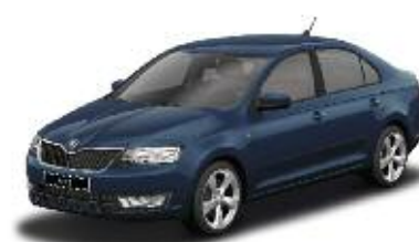
4. Pacific Blue