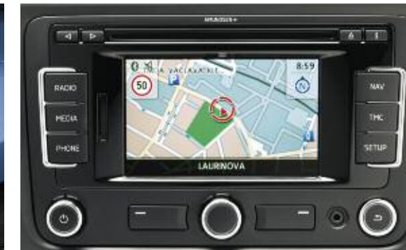
'Amundsen' satellite navigation & digital radio (DAB) (Optional on SE and Elegance)