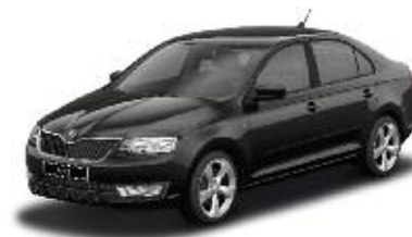
12. Black Magic pearl effect

* Colour may be available on stock vehicles only. Please see your local retailer.