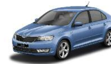
7. Denim Blue metallic