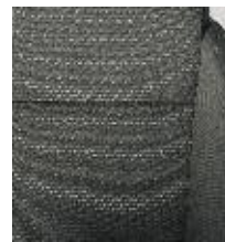
Onyx/grey sports seats