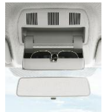
Glasses storage compartment, (standard on SE and Elegance).