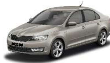
8. Cappuccino Beige metallic