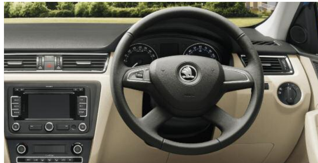
Elegance with ivory upholstery and optional 'Amundsen' sat nav and climate control air conditioning.

Acoustic rear parking sensors (x3) Climate control air conditioning Height adjustable passenger seat