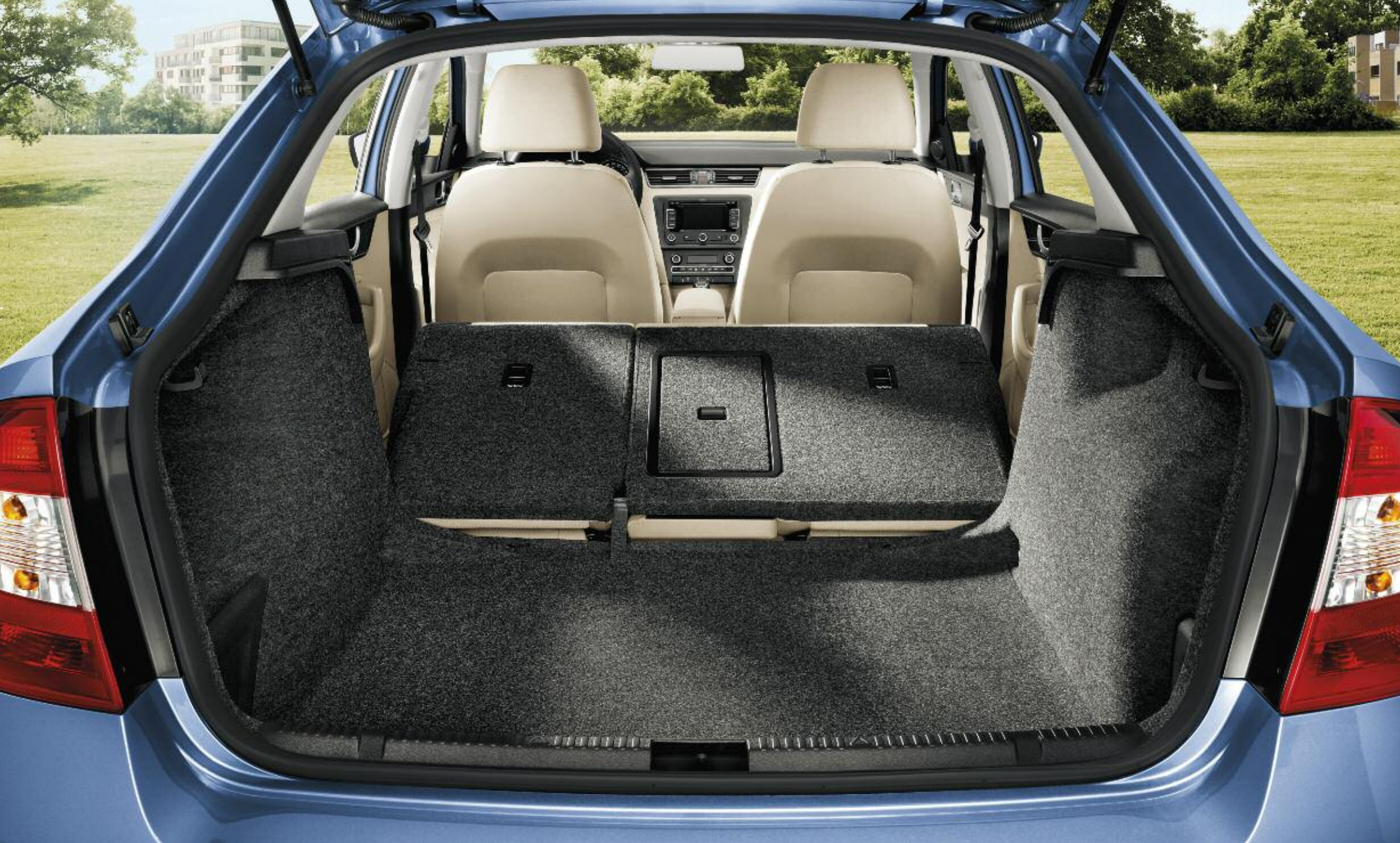
A remarkable 550 litres of storage space (530 litres with a spare wheel) is made even more cavernous with the rear seats down, offering 1490 litres of space. Add a wide hatchback opening and optional bag hooks and removable side storage panels and this Rapid really is ready for anything you throw at (or in) it.

As well as offering comfort, this armrest opens to offer yet another clever storage solution. (Standard on Elegance, optional on S and SE).