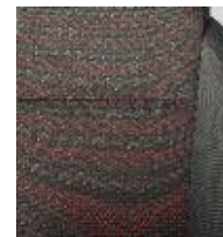
Red sports seats