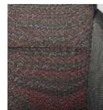
Red sports seats