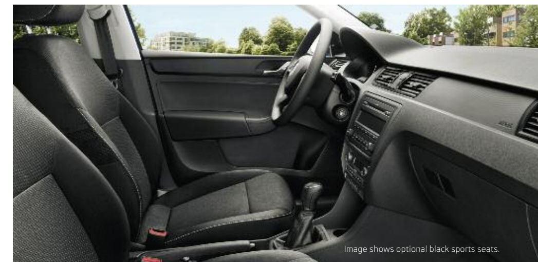
Image shows optional black sports seats.

MDI (mobile device interface)** 6 loudspeakers Cruise control Manual air conditioning Rear electric windows Trip computer MAXI DOT Telephone connection Bluetooth® GSM II