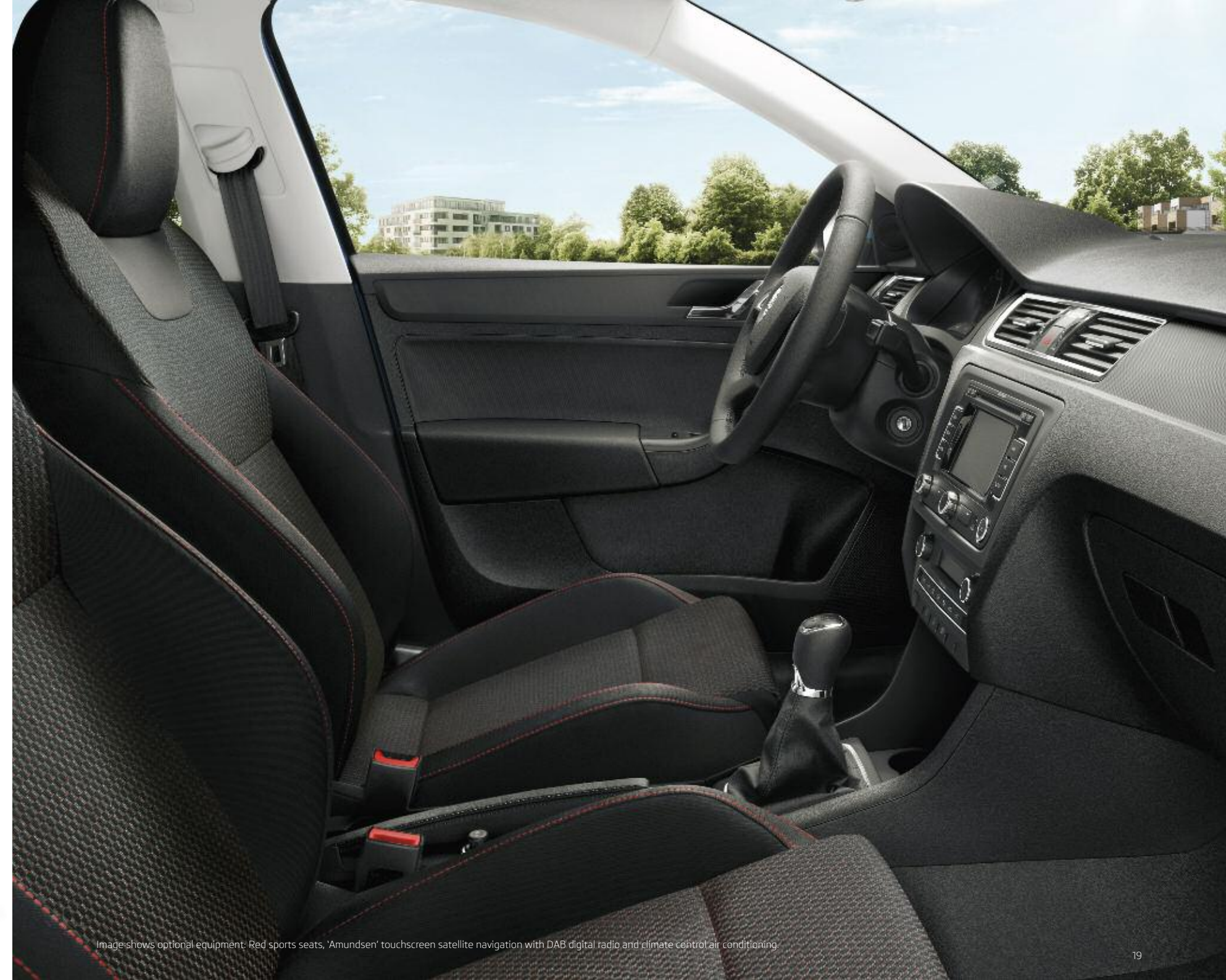
Image shows optional equipment: Red sports seats, 'Amundsen' touchscreen satellite navigation with DAB digital radio and climate control air conditioning.