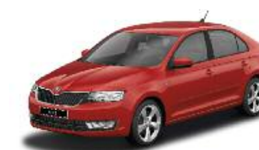
3. Corrida Red