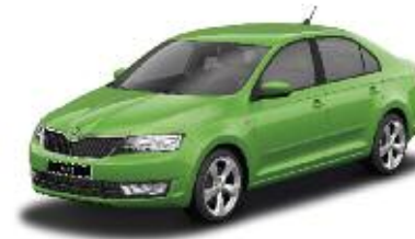
6. Rallye Green metallic