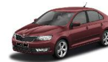
11. Rosso Brunello metallic *