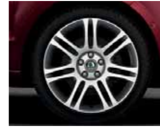
7.5J x 18" Themisto alloy wheels with a polished surface for 225/40 R18 tyres.

The Comfort version is offered with a stylish Ray interior in black. The dashboard and doors are lined with the Stromboli décor. As with the other versions, this interior also features an entire range of decorative high-polish black décor elements such as the cover of the rotating lights switch, air conditioning, radio etc., as well as many chrome components including air inlet frames, rotating lights switch, air conditioning, radio, gear stick lever etc.