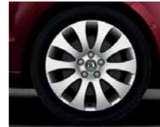
7.0J x 17" Venus alloy wheels for 225/45 R17 tyres.