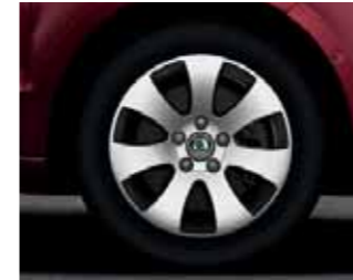
7.0J x 16" Spectrum alloy wheels for 205/55 R16 tyres.