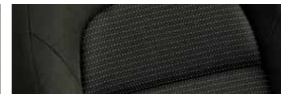
Ray interior – Comfort black fabric