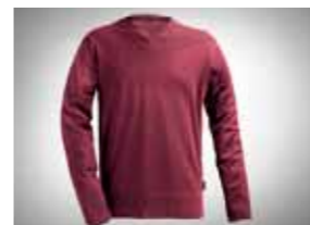
Men's sweater in Rosso Brunello colour