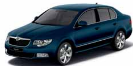
Pacific Blue uni