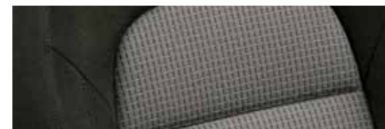
Rubicon interior – Ambition grey/black fabric