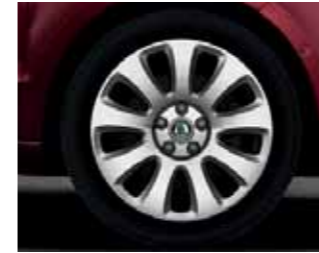
7.5J x 17" Callisto alloy wheels with a polished surface for 225/45 R17 tyres.