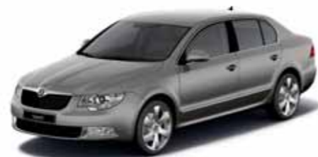
Cappuccino Beige metallic