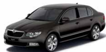
Mocca Brown metallic