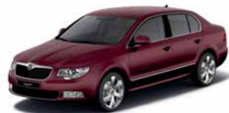
Rosso Brunello metallic