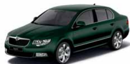
Amazonian Green metallic