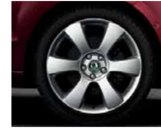
7.5J x 18" Luna alloy wheels for 225/40 R18 tyres.