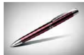
Elegant metal ballpen