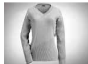
Ladies' sweater in grey colour