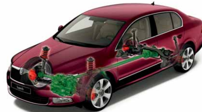
Superb with a 4-wheel drive and a 4th generation Haldex clutch (1.8 TSI/118kW; 3.6 FSI V6/191kW and 2.0 TDI CR DPF/125kW engines)