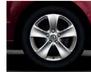
7.0J x 16" Moon alloy wheels for 205/55 R16 tyres.