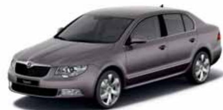
Amethyst Purple metallic