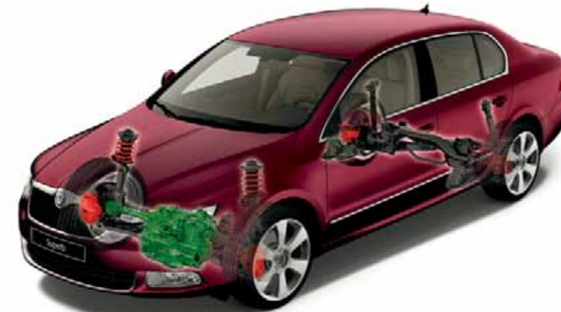
Superb with a front-wheel drive (available for all engine versions except for 3.6 FSI V6/191kW engine)