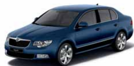
Storm Blue metallic