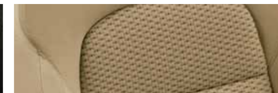
Felicity interior – Elegance Ivory fabric