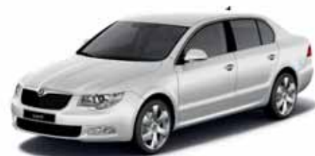
Candy White uni