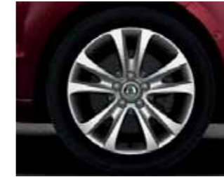
7.5J x 17" Trifid alloy wheels for 225/45 R17 tyres.