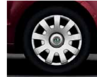
7.0J x 16" steel wheels for 205/55 R16 tyres with Tempel hub covers.