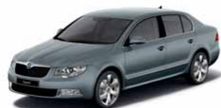
Platin Grey metallic