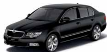
Black Magic pearl effect