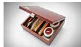
Shoe polishing kit