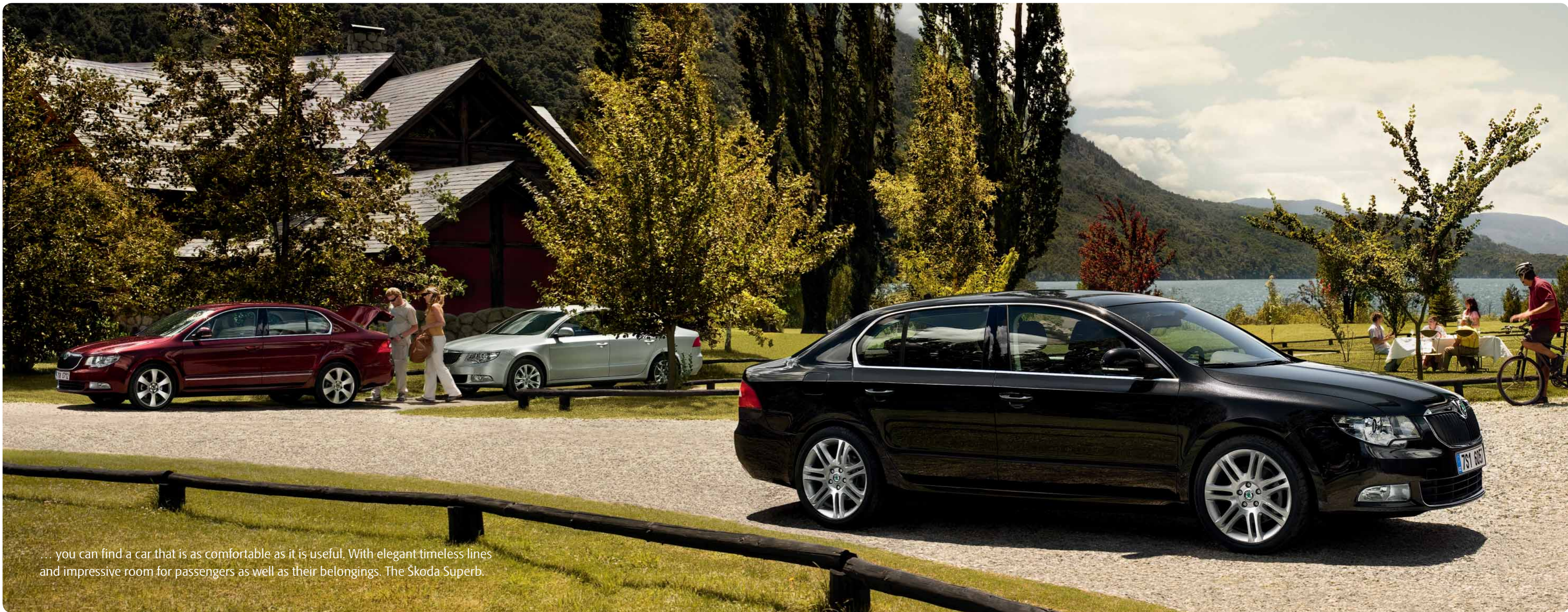
... you can find a car that is as comfortable as it is useful. With elegant timeless lines and impressive room for passengers as well as their belongings. The Škoda Superb.