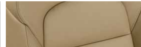
Glamour interior* – Elegance Feinnappa leather/ivory artificial leather