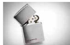
Zippo lighter - type 200