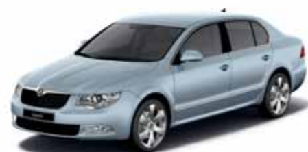
Aqua Blue metallic