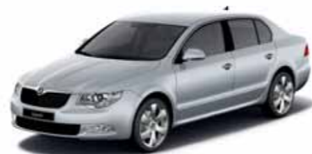
Brilliant Silver metallic