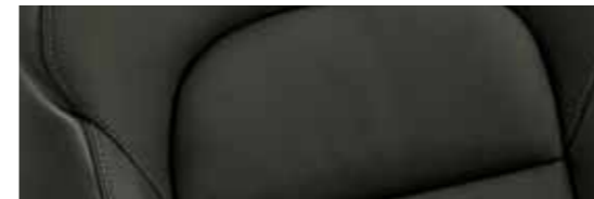
Glamour interior* – Ambition, Elegance Feinnappa leather/black artificial leather