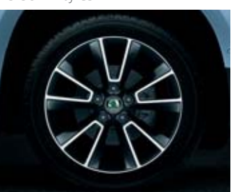
7.0] x 17" Dolomite alloy wheels for 7.0] x 17" Matterhorn alloy wheels* for 225/50 R17 tyres; 2-colour design.