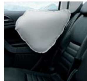
The rear side airbags, which are activated by a side impact, protect the pelvis and chest of passengers on the rear side seats.