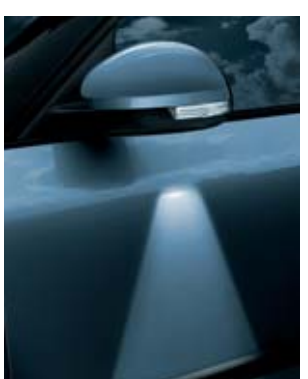
The Boarding Spots ,

designed to illuminate the entry area, are integrated in the external mirrors and enable you to avoid puddles and stones and so get in the car safely, even in complete darkness.