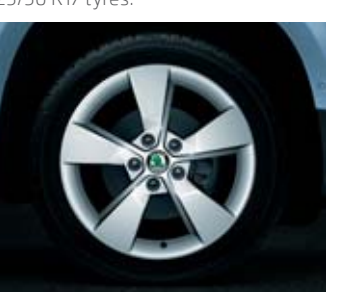
7.0] x 17" Erebus alloy wheels for 225/50 R17 tyres. 7.0] x 16" Nevis alloy wheels for 215/60 R16 tyres.