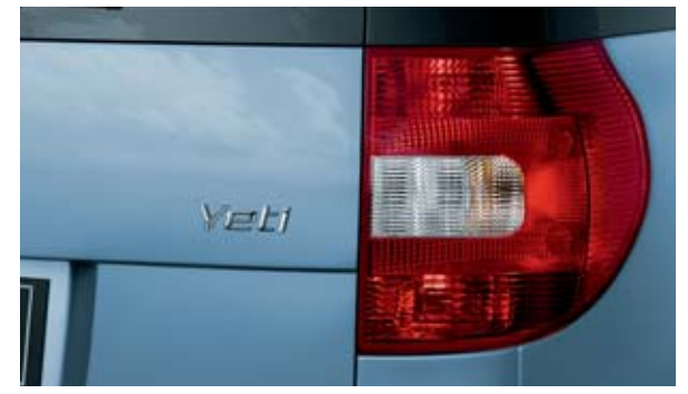
The rear lights also extend all the way to the wings and when activated the traditional letter C lights up.