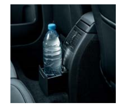
Function package for the Jumbo Box armrest (ashtray and 1.5-litre bottle holder).