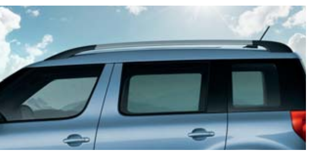
Automaticallyretractable external mirrors upon locking the car.

If you have high expectations of comfort, it is Yeti, in the SUV category, that will fulfil them. Discover unexpected spaciousness as well as an exceptional variability. Then there is of course the pleasant experience of controlling the vehicle. The dashboard was designed exclusively for the Yeti model and you'll intuitively find all controls exactly where you'd expect them. The driving comfort of all passengers is catered for by a range of comfort products, available as standard or extra equipment.