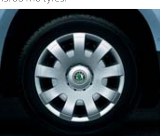
7.01 x 16" steel wheels for 215/60 R16 tyres with Rif hub covers.