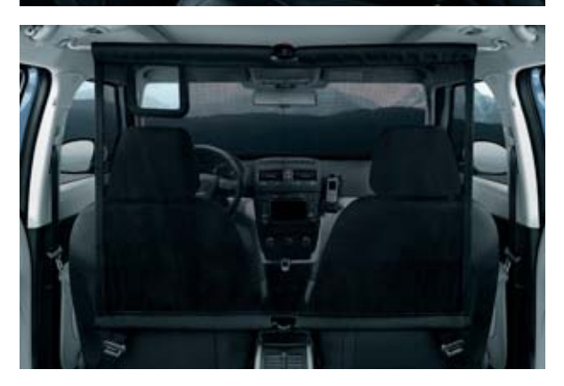
Extendable dividing net separating the passenger space from the luggage compartment.