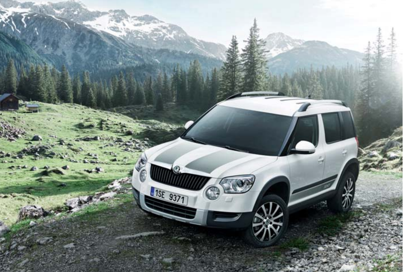
The roof transportation systems will especially be appreciated when carrying various sports equipment. A genuine ŠKODA box with 380-litre capacity, which successfully passed the City Crash test, is also available.