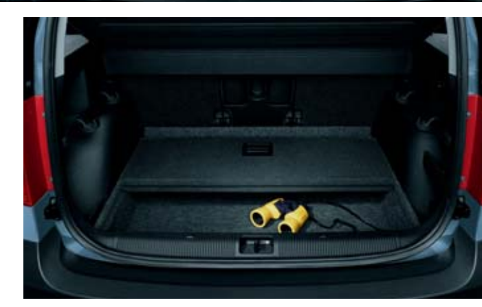
Mid-level luggage compartment floor.