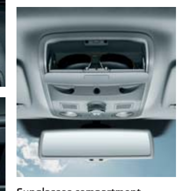
Sunglasses compartment located in the roof panel.