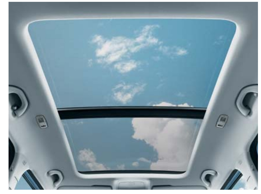
Your driving will gain a whole new dimension thanks to the electrically-adjustable panoramic roof window which allows you to create a large open space above the front seats.