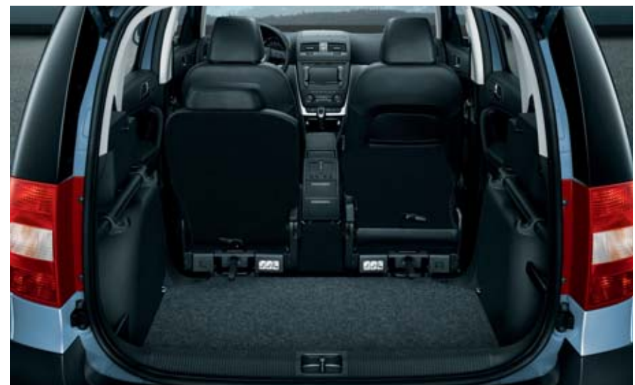
Storage compartments on the sides of the luggage compartment and sliding hooks .

VarioFlex (rear seating system) – 3 separate rear seats, which can be folded or removed independently of each other.