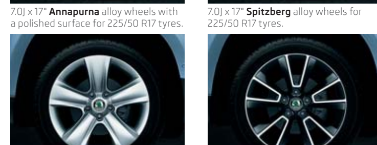
225/50 R17 tyres.