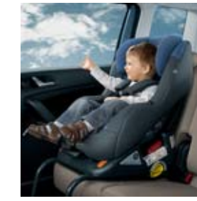
ISOFIX G 0/1 child seat to ensure safe journeys for smaller passengers.

ŠKODA Genuine Accessories add style to your car while enhancing its utility. In our range, which is essentially an extended range of the extra equipment, you will find various products including decorative strips, alloy wheels, leather products, foot mats, radios and navigation systems, roof racks, child safety seats and even a cuddly Yeti toy. To further stress the character of the car, you can go for one of our decorative packages: the off-road package includes bonnet foil, roof strips, alloy wheels, wheel arch extensions etc.; the ALU package offers covers of side mirrors, lateral strips, slats of the front bumper etc. To get a full overview of our range of products, ask any authorised ŠKODA partner for our special accessories catalogue.