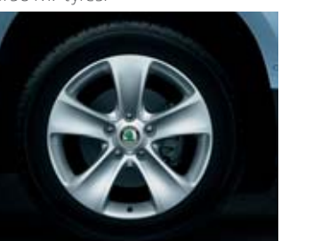
7.01 x 16" Moon alloy wheels for 215/60 R16 tyres.

* Available exclusively as a part of the Reef package.