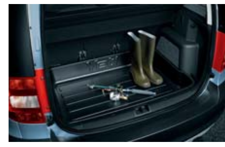
Plastic boot dish with an increased 15cm edge and a Yeti inscription.