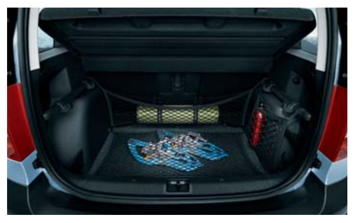
The set of nets offering several arrangement options.