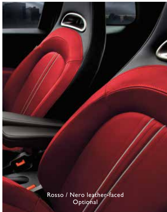
Rosso / Nero leather-faced Optional