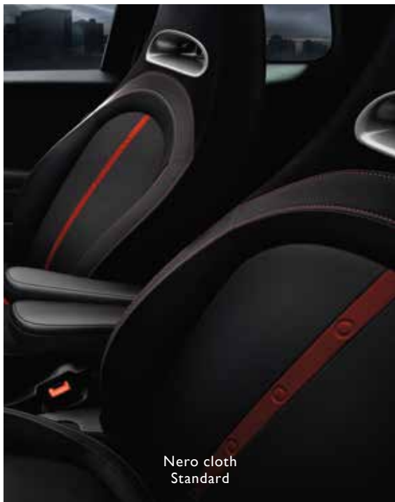
Nero cloth Standard