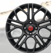
16-INCH HYPER BLACK PAINTED FORGED ALUMINUM Standard on 500 Abarth and 500c Abarth

This groundbreaking engineering is mated to the track-tested 1.4L MultiAir® Turbo engine that kicks out 157 horsepower and 183 lb-ft of torque. Torque Transfer Control (TTC) is a dynamic feature that keeps all that power in check by transferring power to the drive wheels for improved at-the-limit handling. It operates with the Electronic Stability Control (ESC) 2 system to transfer torque from a front wheel that slips to one that grips.