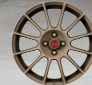
17-INCH BRONZE FORGED ALUMINUM Available on 500 Abarth and 500c Abarth