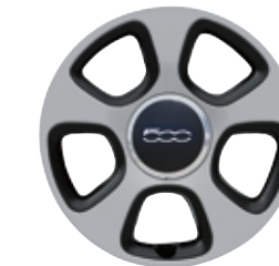
15-INCH CAST ALUMINUM WITH BLACK POCKETS Standard on 500e

• = Standard. O = Optional. P = Available within Package noted. — = Not Available.