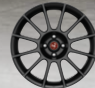
17-INCH HYPER BLACK FORGED ALUMINUM Available on 500 Abarth and 500c Abarth

FIAT 500 Abarth Cabrio shown in Bianca Perla.