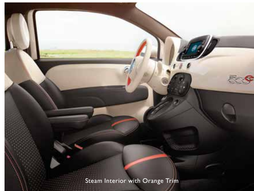
Steam Interior with Orange Trim