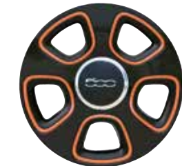
15-INCH BLACK PAINTED CAST ALUMINUM WITH ORANGE ACCENTS Available on 500e with eSport Package