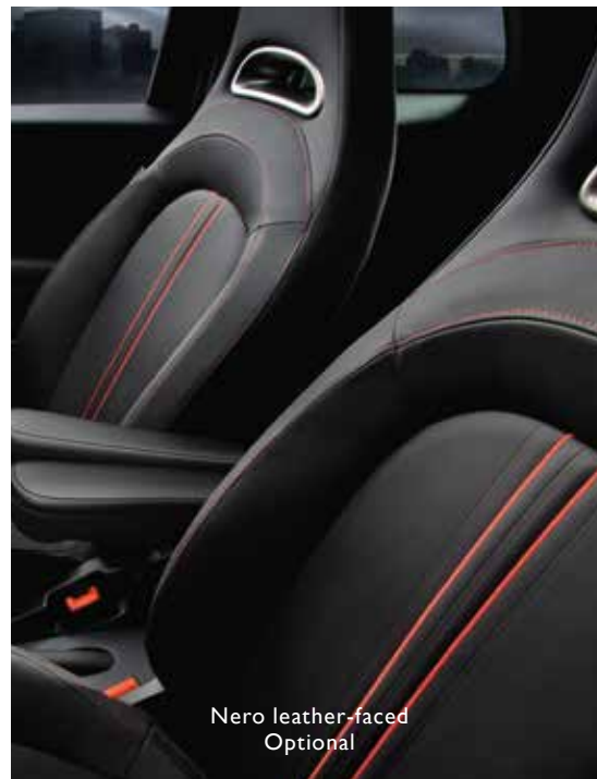
Nero leather-faced Optional