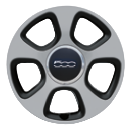
I5-INCH CAST ALUMINUM WITH BLACK POCKETS