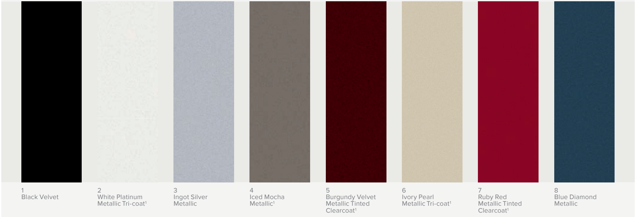
1 Black Velvet