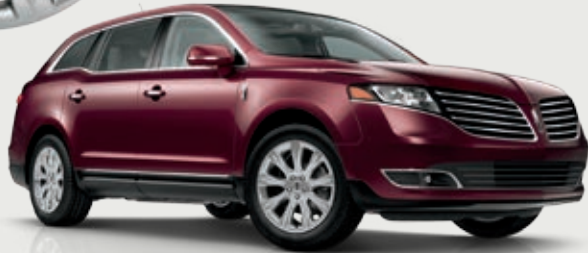
18" Premium Painted Aluminum PREMIERE/RESERVE