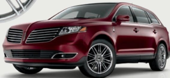
20" Polished Aluminum RESERVE Optional