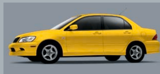
Shown in Lightning Yellow