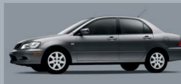
Shown in Thunder Gray Metallic