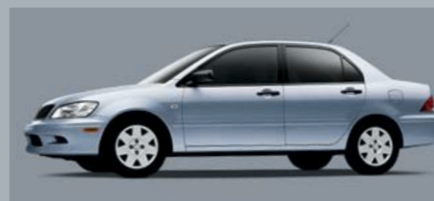
Shown in Munich Silver Metallic