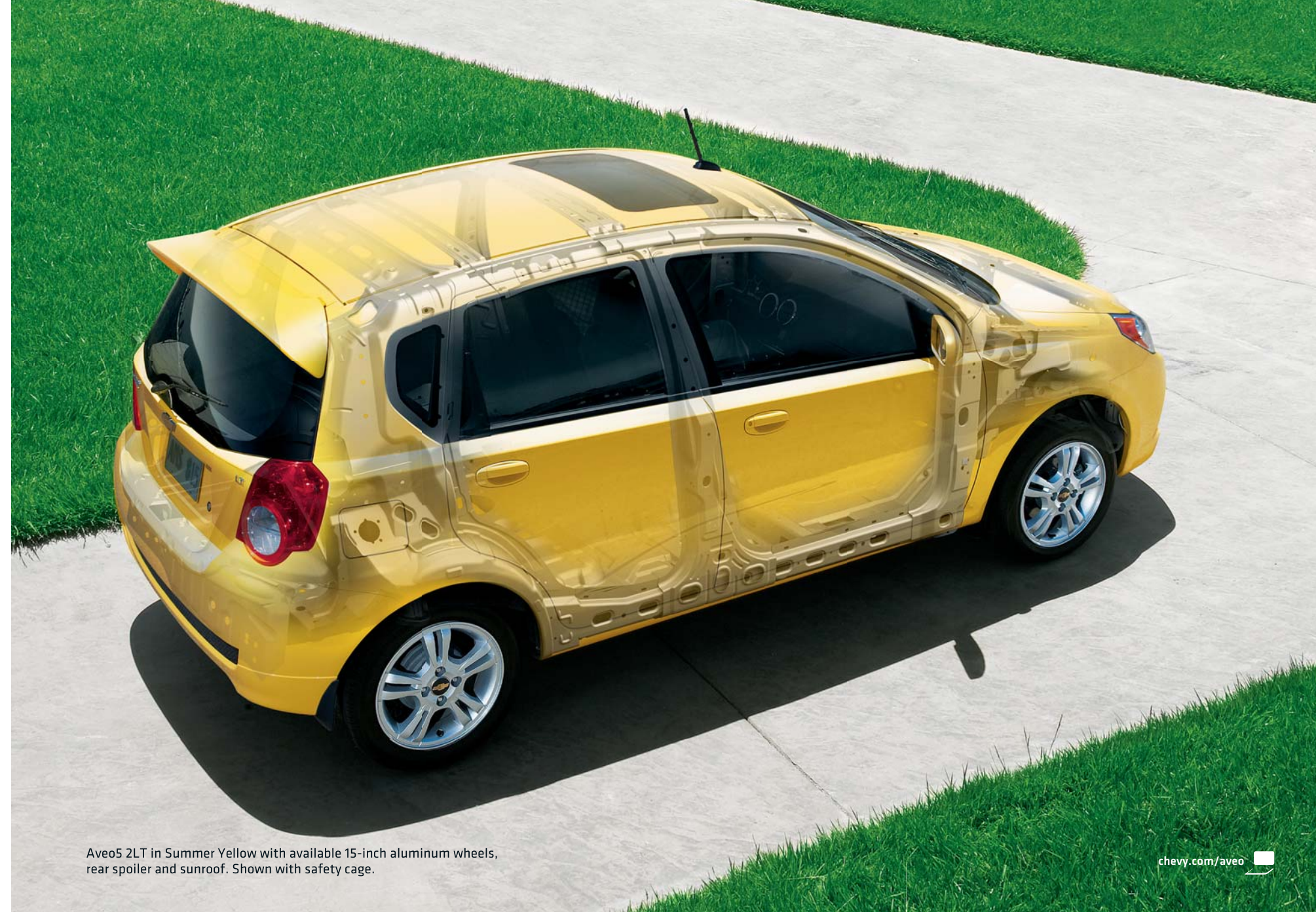
Aveo5 2LT in Summer Yellow with available 15-inch aluminum wheels, rear spoiler and sunroof. Shown with safety cage.

1 A NOTE ABOUT CHILD SAFETY: Always use safety belts and the correct child restraint for your child's age and size. Even in vehicles equipped with the Passenger Sensing System, children are safer when properly secured in a rear seat in the appropriate infant, child or booster seat. Never place a rear-facing infant restraint in the front seat of any vehicle equipped with an active air bag. Air bag inflation can cause severe injury or death to anyone too close to the bag when it deploys. Be sure every occupant is properly restrained. See the Owner's Manual and child safety seat instructions for more safety information. 2 Call 1-888-4ONSTAR (1-888-466-7827) or visit onstar.com for details and system limitations. 3 Based on preliminary internal GM data.