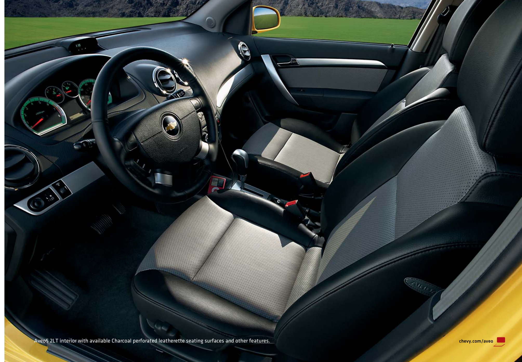
Aveo5 2LT interior with available Charcoal perforated leatherette seating surfaces and other features.