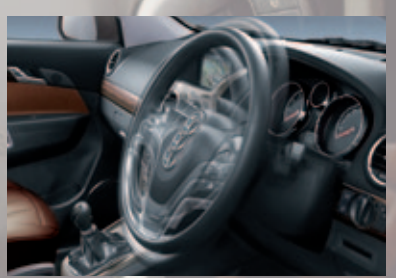
Seating position. You don't just sit high up in Antara. You relax in total comfort, thanks to driver's seat height, tilt and lumbar adjustment, plus a reach and rake adjustable steering column. Both models feature heated front seats – with three separate heat settings as standard.