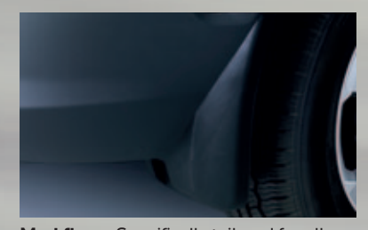
Mud flaps. Specifically tailored for all Antara models they are designed to help protect the vehicle's bodywork against mud, salt and stones whilst aiding visibility for following vehicles by reducing spray in wet weather.