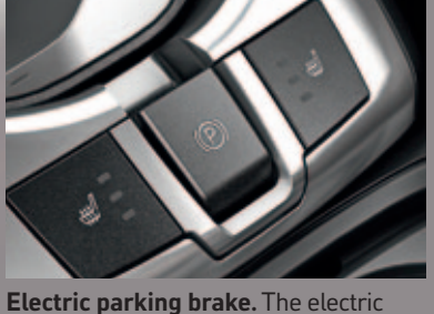
Electric parking brake. The electric parking brake is easy to apply and also has an automatic release function to ease driving off on slopes.