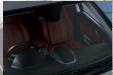
Heat-reflective windscreen. The SE Nav features a multi-layered coating inside the windscreen which reflects the sun's heat, helping the electronic climate control maintain a pleasant – and constant – temperature inside the car.