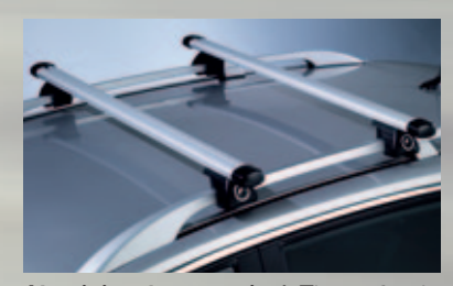
Aluminium base carrier*. The roof rack system begins with this lockable base carrier, comprising two T-track roof bars which support a wide range of products from Thule, including bicycle carriers and roof boxes (illustrated far right).

Genuine Vauxhall accessories are the right choice for your Antara. Whatever you're into, there's certain to be a genuine Vauxhall accessory with your name on it, all fitted by trained Vauxhall professionals. We've only featured a small selection of what's available here, so please check with your Vauxhall retailer for accessory availability information or visit our website at www.vauxhall.co.uk/accessories