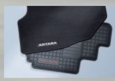
Velour and rubber floor mats. Hardwearing and designed specifically for Antara, our velour or rubber floor mats are the best way to protect your car's interior.