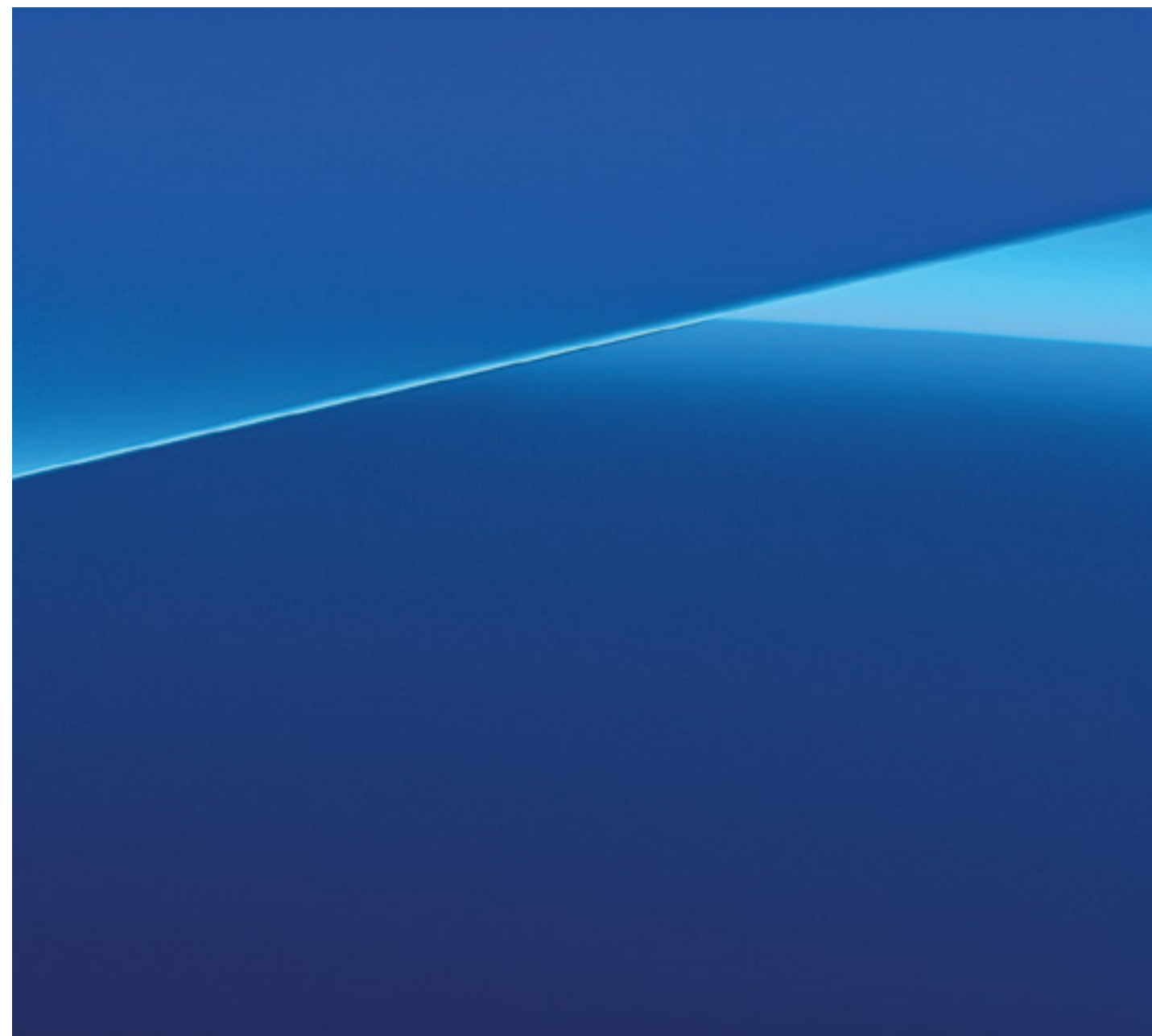
Bleu Alpine (option)