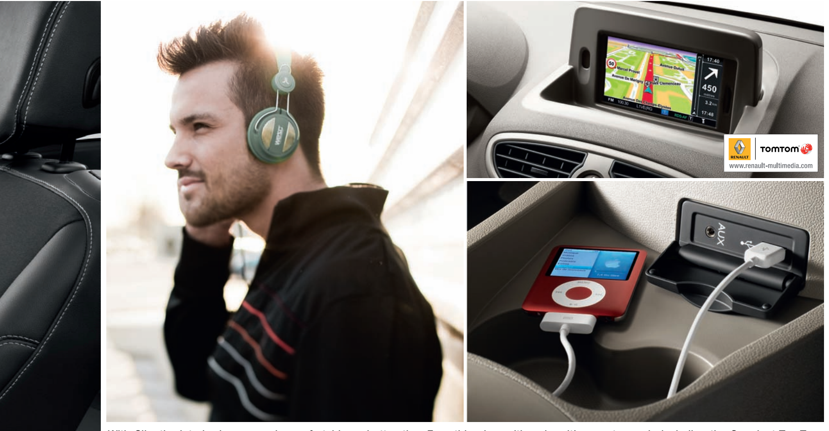
With Clio, the interior is supremely comfortable and attractive. Everything is positioned so it's easy to reach, including the Carminat TomTom. Carminat TomTom makes navigation simple. It is Renault's latest GPS navigation system and is the fruit of an exclusive partnership between Renault and TomTom, to produce a fully integrated navigation unit at an affordable price. And now, Renault offers Carminat TomTom<sup>®</sup> LIVE. Developed with TomTom<sup>®</sup>, the globally recognised specialist, the Carminat TomTom<sup>®</sup> LIVE system brings together a complete range of high-performance and accessible functions, with its intuitive remote control. With one safe movement, you can benefit in real time from high definition traffic information or mobile speed camera warnings. It's easy to update too, with a wide range of online services.