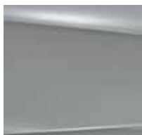
PEARL WHITE KXC (METALLIC)