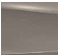
LAVA GREY HXA (METALLIC)