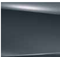
ULTRA SILVER WXA (METALLIC)