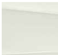
WHITE QXA (SOLID)