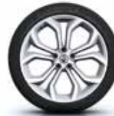
20" Silverstone alloy wheels