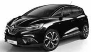
Diamond Black 2 GNE