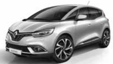
Mercury 2 D69