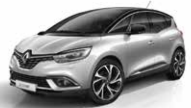
Mercury 2 with Diamond Black roof XNM