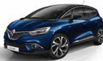
Cosmos Blue 2 with Diamond Black roof XUL