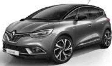
Oyster Grey 2 with Diamond Black roof XNK