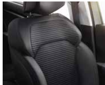
Dark Carbon cloth upholstery