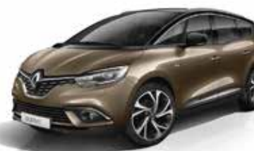
Mink Brown 2** with Diamond Black roof XVR