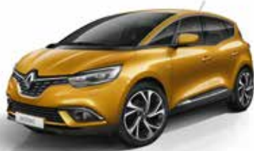
Honey Yellow 2* EPA