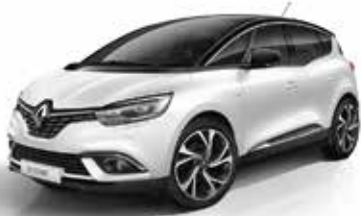
Arctic White 3 with Diamond Black roof XUI