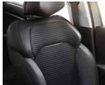
Synthetic leather and Dark Carbon cloth upholstery