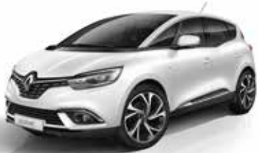
Arctic White 3 QNC