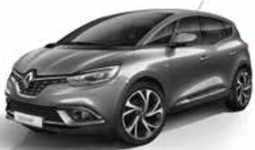
Oyster Grey 2 KNG