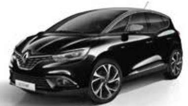
Diamond Black 2 with Oyster Grey roof XUP