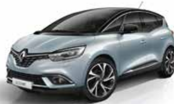
Sky Blue 2 with Diamond Black roof XUK