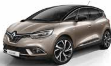
Dune 2 with Diamond Black roof XUJ