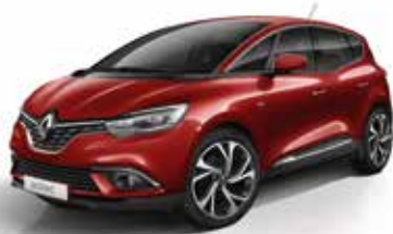
Carmin Red 2 NPF