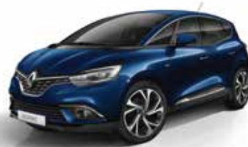
Cosmos Blue 2 RPR