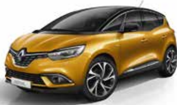
Honey Yellow 2* with Diamond Black roof XUO