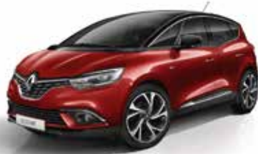
Carmin Red 2 with Diamond Black roof XUM