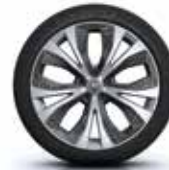
20" Exception alloy wheels