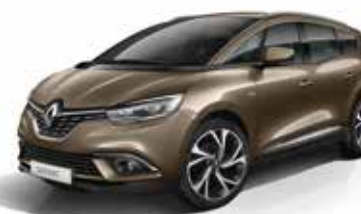
Mink Brown 2** CNM