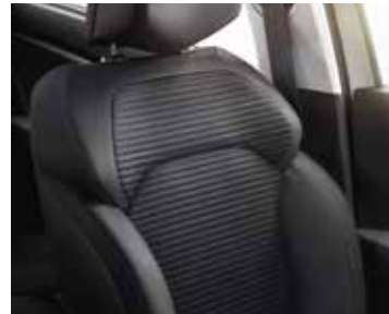
Dark Carbon cloth upholstery