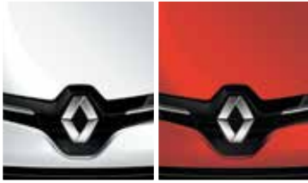
Glacier White 369