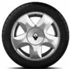
15" Alizar alloy wheel (Standard)