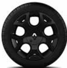
15" Noxiane black wheel