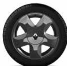
15" Alizar anthracite wheel