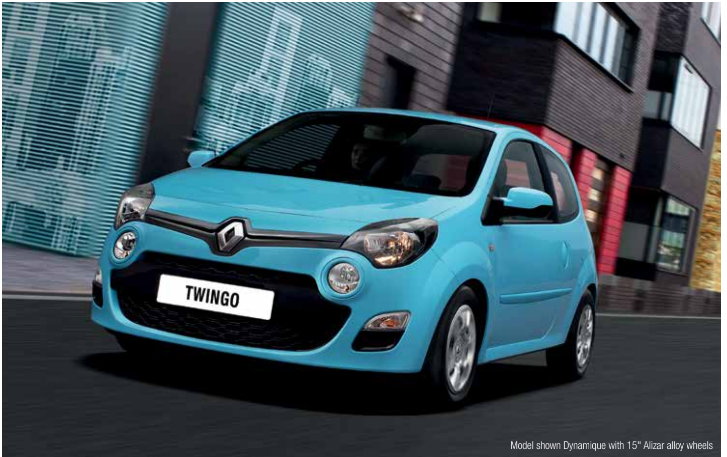
Model shown Dynamique with 15" Alizar alloy wheels