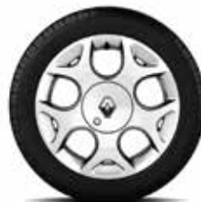
15" Noxiane white wheel