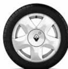
15" Alizar white wheel