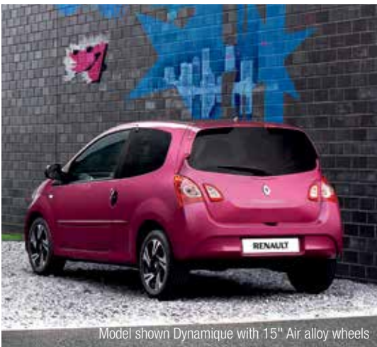
Model shown Dynamique with 15" Air alloy wheels