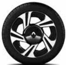
15" Air alloy wheel