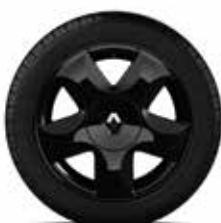
15" Alizar black wheel