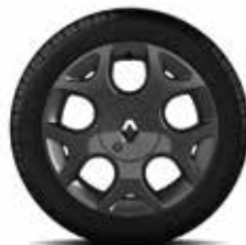
15" Noxiane anthracite wheel