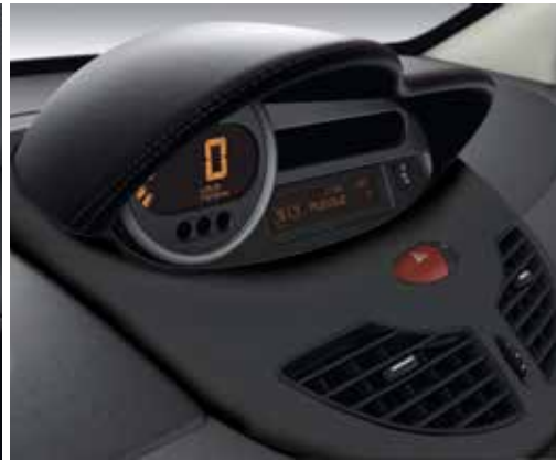
Sporting and chic. A dark charcoal interior, set off with gloss black and chrome highlights, and a red overstitched sun visor... Dynamique creates a clean, classic atmosphere.